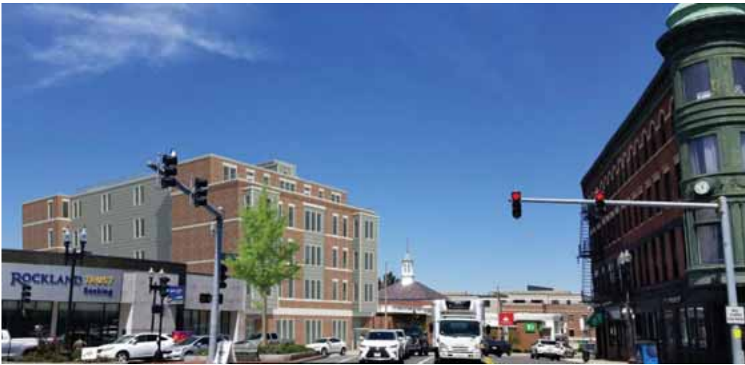
The Zoning Board of Appeals approved a chicken coop in West Roxbury and this larger structure on Market Street in Brighton.