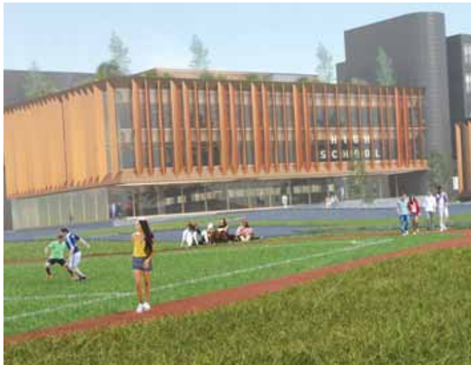
A rendering of the proposed redesign of the West Roxbury Education Complex for the move of the O'Bryant School.