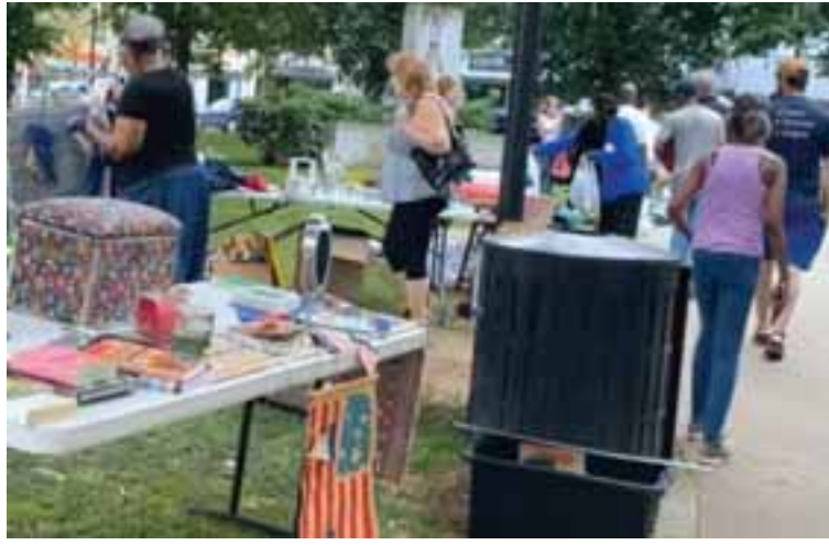
Hundreds came out to the Roslindale Flea Market on Sunday despite the forecasted rain.

Vendors at the market this past weekend were of all ages and races, and even a child showed up to sell his wares. There were unique finds at every table, including a large variety of items that were for sale for this one day only, since the