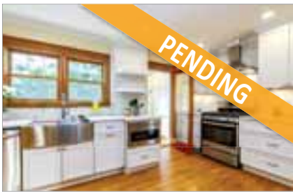
19 SHERBROOK STREET WEST ROXBURY $639,900 Listed by Lisa Sullivan