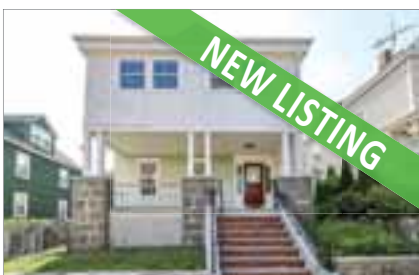
35 PHILBRICK STREET ROSLINDALE $739,000 Listed by Dave Greenwood