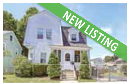
32 LASELL STREET WEST ROXBURY $769,000 Listed by Dave Greenwood