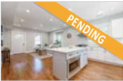
52 MAPLE STREET U:1 HYDE PARK $549,000 Listed by Steven Musto