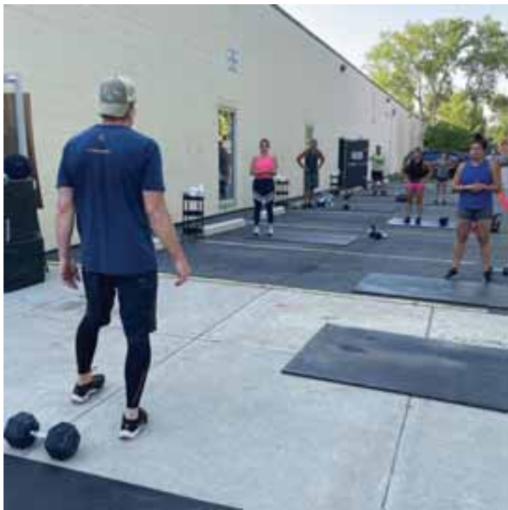
Residents are getting back to the gym in a socially-distant manner in Boston.