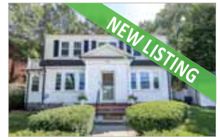
514 WELD STREET WEST ROXBURY $699,000 Listed by Linda Burnett