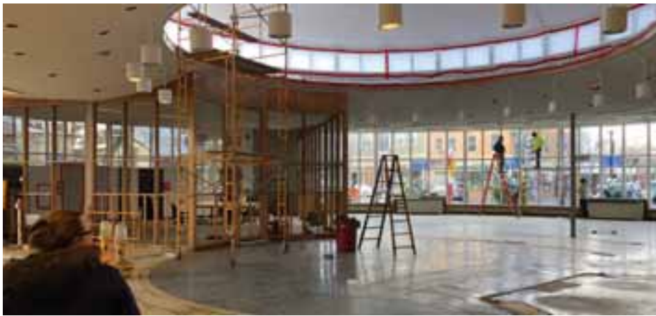
Work on the Roslindale Library was delayed, but has now restarted in the summer months.