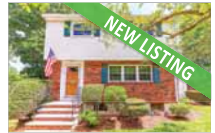
22 FARWELL STREET ROSLINDALE $639,000 Listed by Michael Hunt