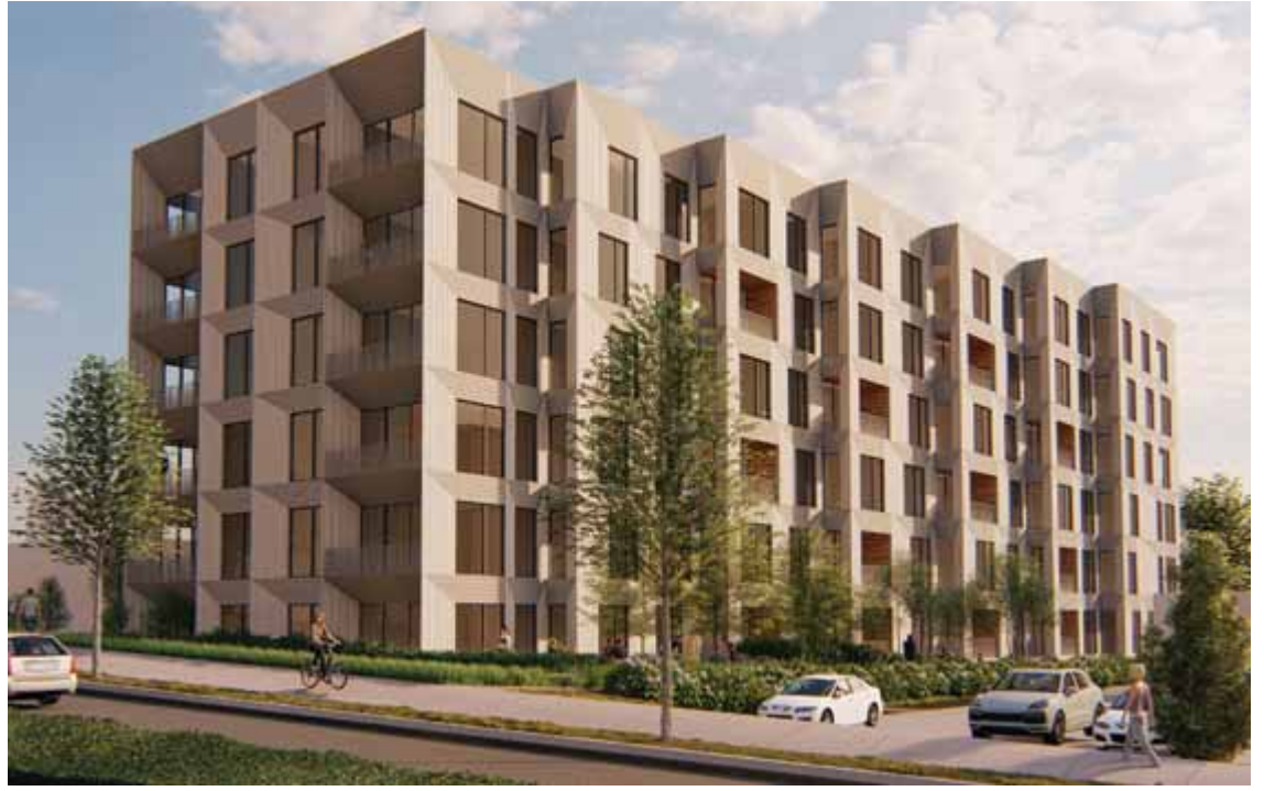
A rendering of the proposed building at 1500 Soldiers Field Rd. in Allston, which has been designed to face the river and provide as many of its residents as possible with a view of the Charles.