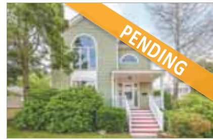
148 LAGRANGE STREET WEST ROXBURY $599,000 Listed by Mary Devlin