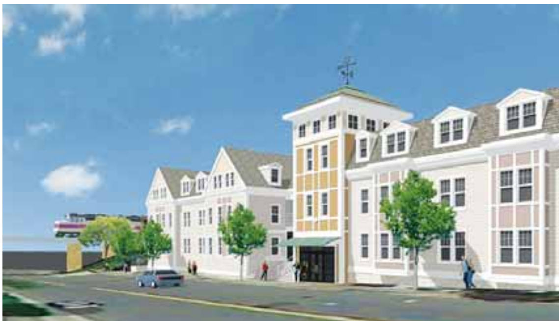
The proposed 40-unit condo building for 425 LaGrange, as it was submitted more than four years ago to the ZBA when it came for its original approval.