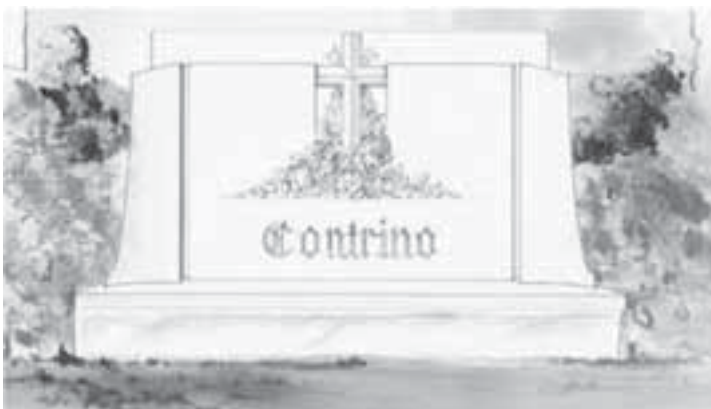
A CENTURY OF SERVICE TO THE COMMUNITY