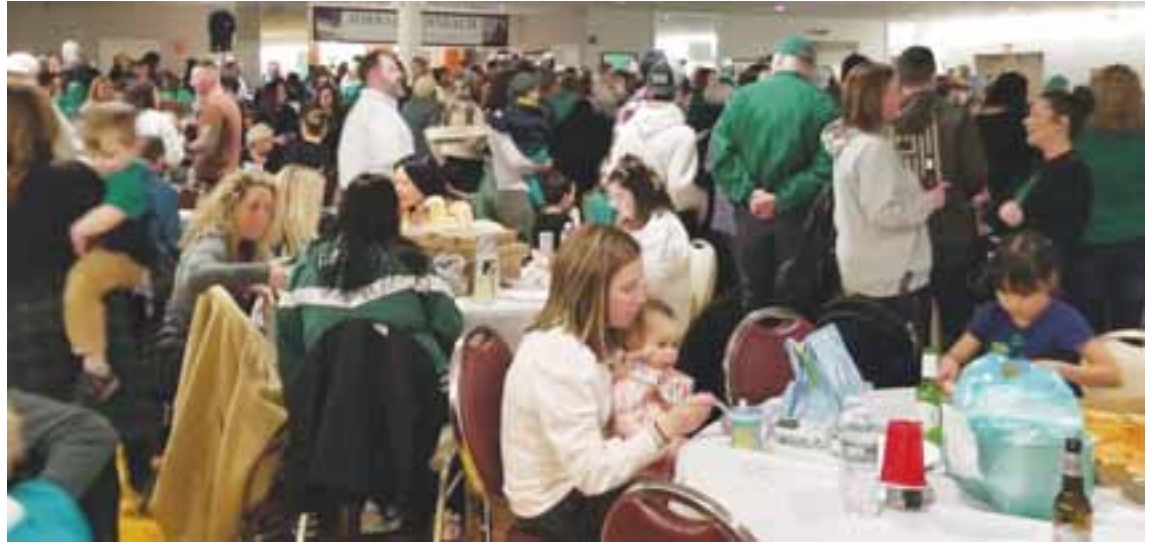
Hundreds of residents came out to celebrate St. Patrick's Day at the Irish Social Club in West Roxbury.