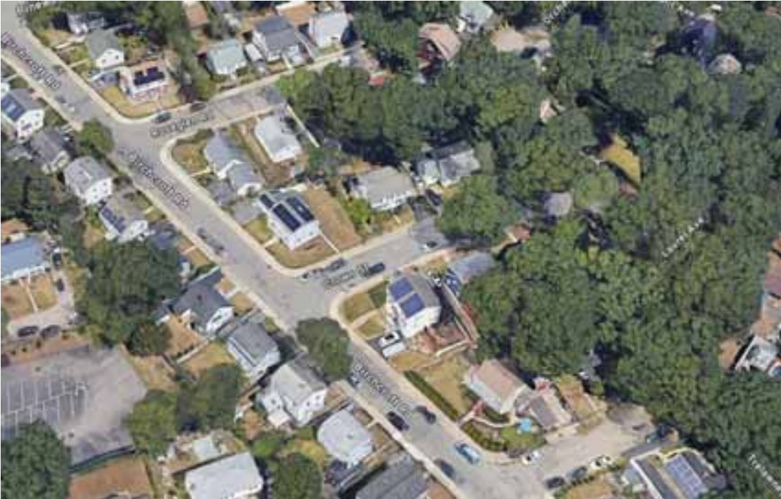
Residents are concerned about an excess of vehicles parking in their neighborhood in Hyde Park.