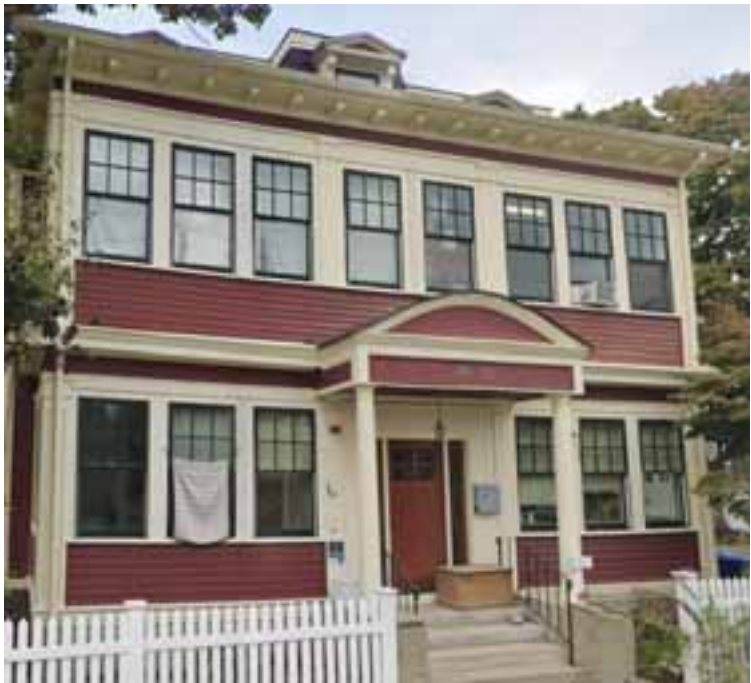
The Granada House will be renovating one of its properties in Lower Allston soon.