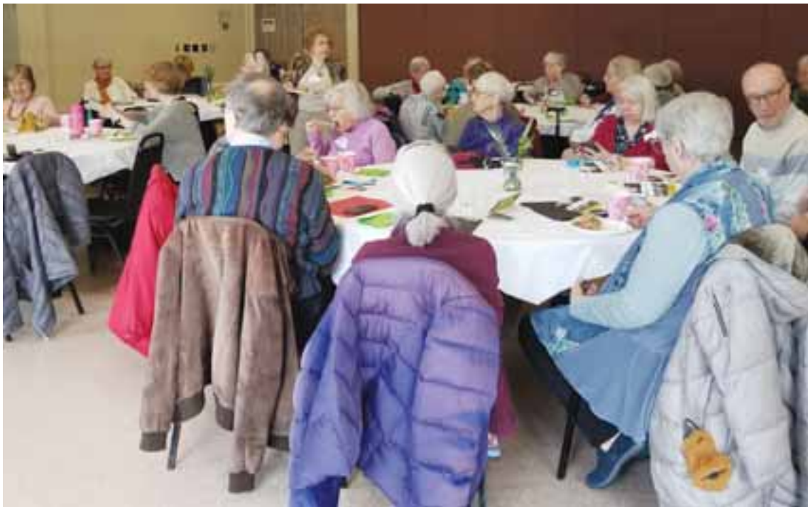
Residents gathered at the recent Ethos meeting to hear the programs offered by JP@Home.