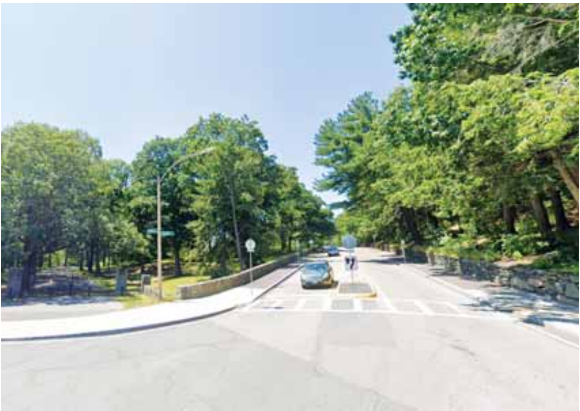
Bussey Street could see a name change in the coming months.