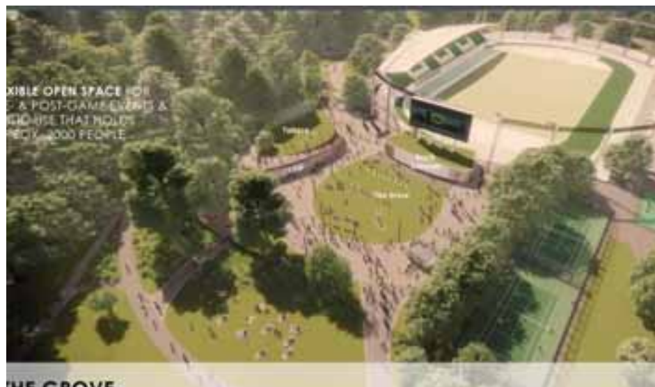
A rendering of the proposed Grove area for the project, with the stadium pictured behind.