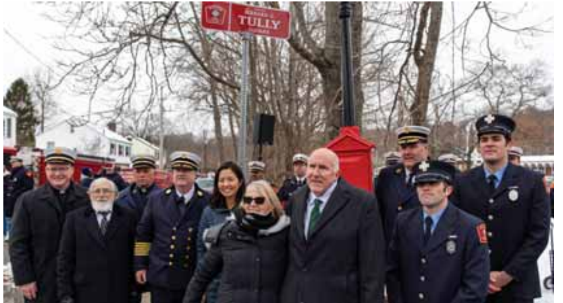
Hundreds turned out for the dedication of Tully Square in West Roxbury last week.