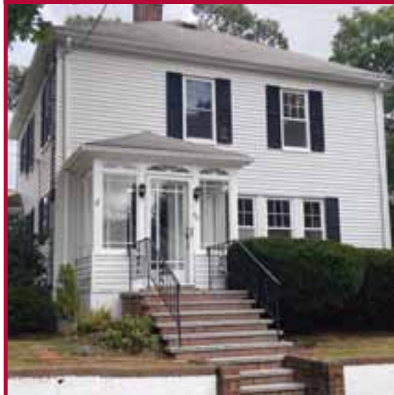
85 Newfield Street • $869,900 Brook Farm Area! Handsome 3 bed, 2 bath Colonial. Finished Lower Level. Gorgeous Yard.