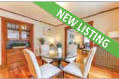
82 HEWLETT U:2 ROSLINDALE $535,000 Listed by Mary Devlin