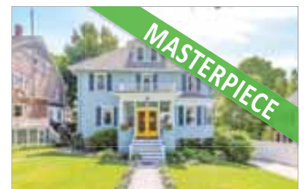
200 MOUNT VERNON STREET WEST ROXBURY $1,600,000 Listed by Lisa Sullivan