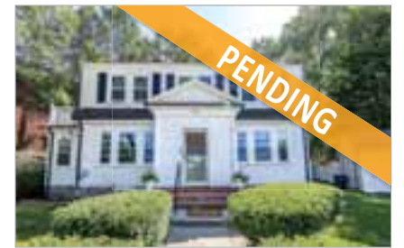
514 WELD STREET WEST ROXBURY $699,000 Listed by Linda Burnett