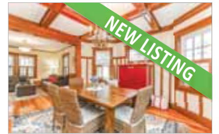
32 CHAPIN AVENUE WEST ROXBURY $639,900 Listed by Lisa Sullivan