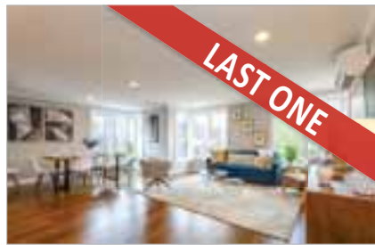
1789 CENTRE STREET U:303 WEST ROXBURY $649,000 Listed by Jenna Lemoine