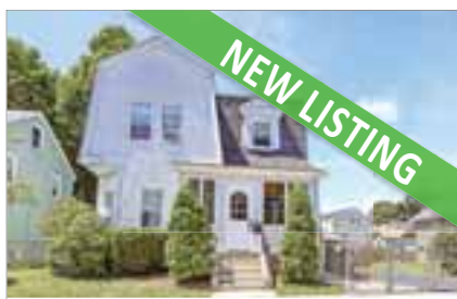
32 LASELL STREET WEST ROXBURY $739,000 Listed by Dave Greenwood