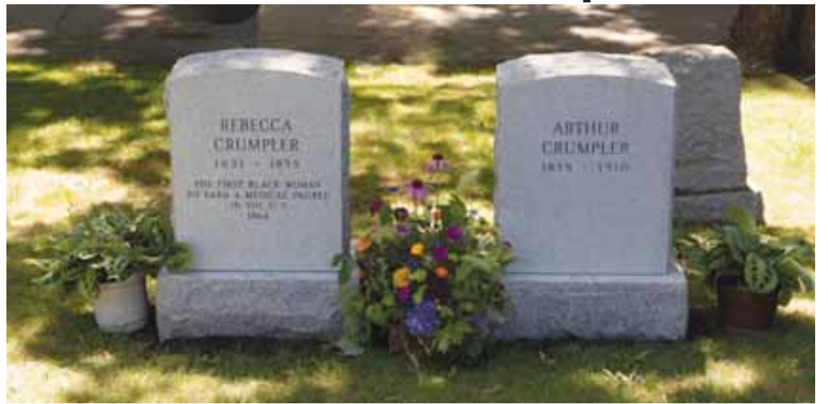
The Friends of the Hyde Park Library and the Hyde Park Historical Society gathered to honor Dr. Rebecca Lee Crumpler.