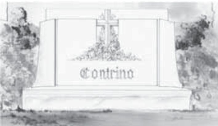
A CENTURY OF SERVICE TO THE COMMUNITY