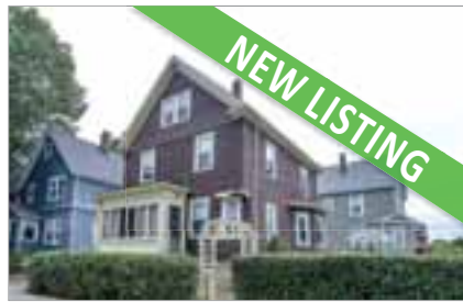
24 ROSECLIFF STREET ROSLINDALE $559,000 Listed by Dave Greenwood