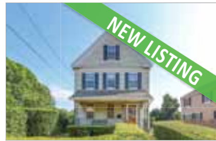
66 GARDNER STREET WEST ROXBURY $599,900 Listed by Steven Musto