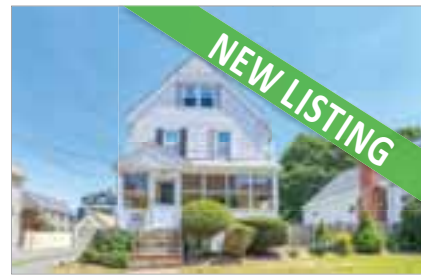
25 WESTOVER STREET WEST ROXBURY $689,000 Listed by Sue Brideau