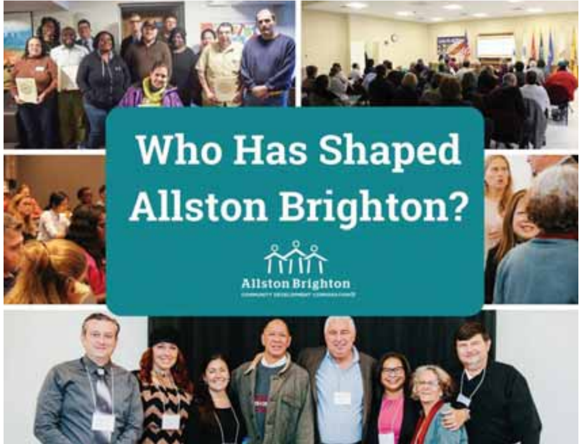
The ABCDC is asking you to nominate a resident, business or organization you believe has made an impact on the dual neighborhood.

To nominate someone you know who has made a difference in the community, go to https://www.tfaforms.com/4833489 or nominate via email at info@allstonbrightoncdc.org .