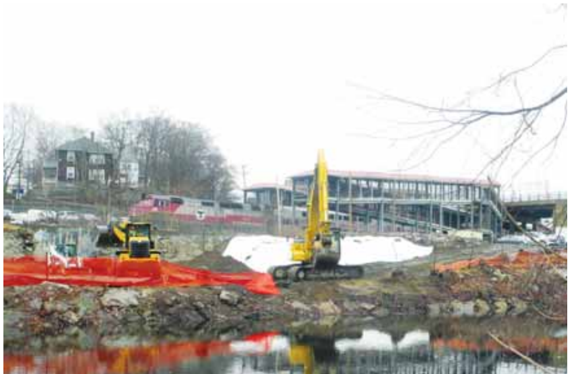
Crews are currently working on the former location of Lewis Chemical just on the banks of the mighty Neponset River in Hyde Park.