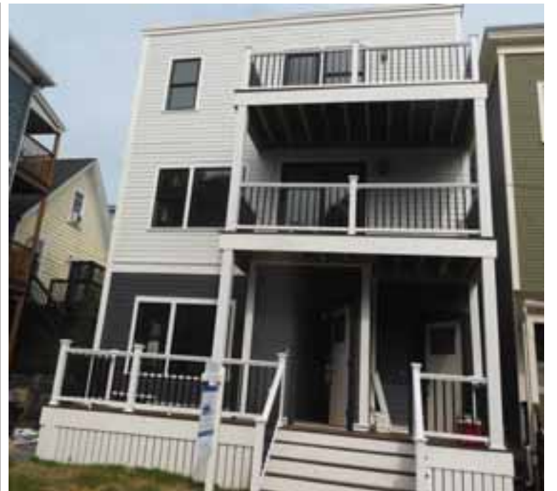
A shot of the recently rebuilt building at 15 Meehan Street in Jamaica Plain.