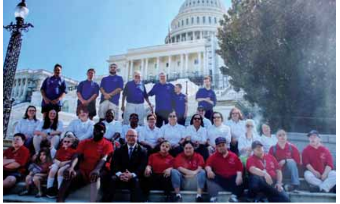
The Parkway's Jason Roberts Challenger League recently took a tour of Washington D.C. and managed to fit in a game on their way back as well.