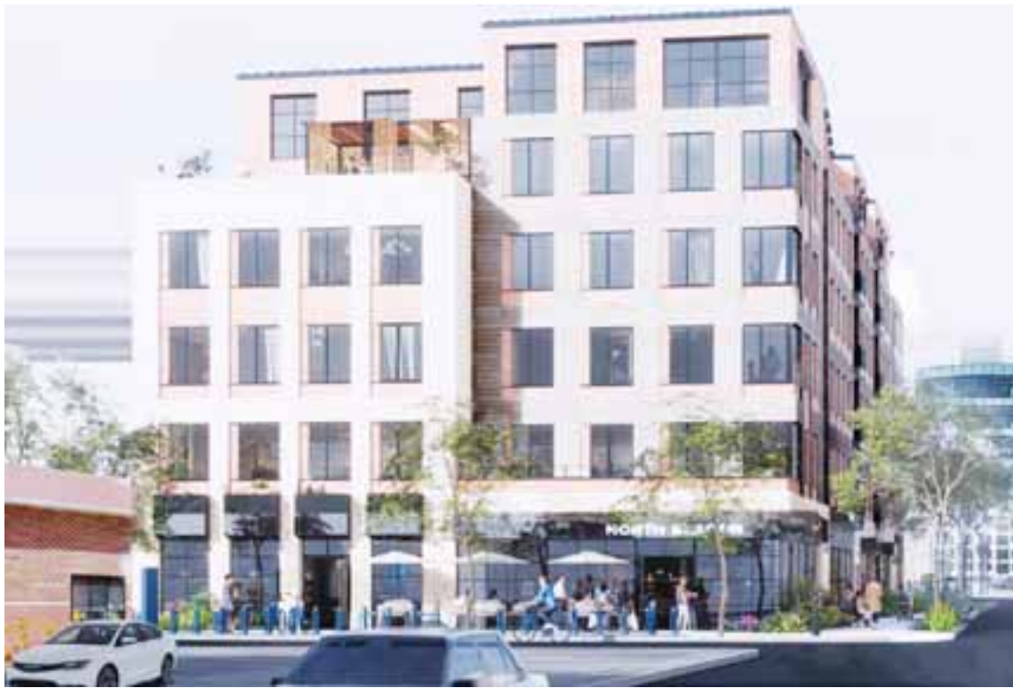
Residents had concerns regarding the proposed project at 131 North Beacon St., but most of the discussion was positive.