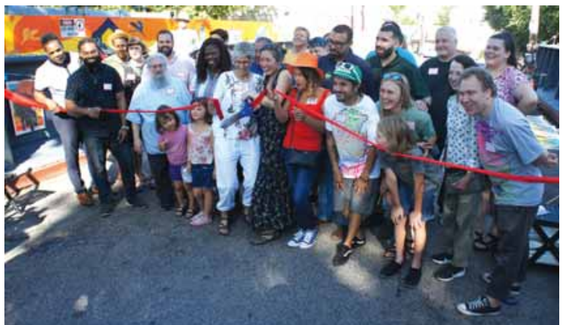
About 100 residents came out to dedicate the new murals at the Blakemore Bridge in Roslindale.