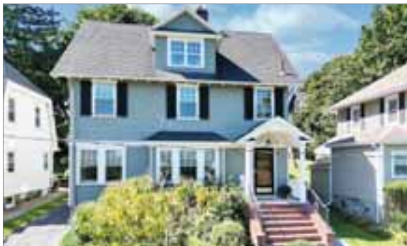
287 STRATFORD STREET WEST ROXBURY

YOUR EXPERT REAL ESTATE TEAM FOR BUYING OR SELLING IN AND AROUND THE BOSTON AREA!