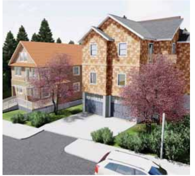
An architect’s illustration of the addition to 31 Rodman Street in Jamaica Plain.

“I’ve made every effort over the past six or seven months to