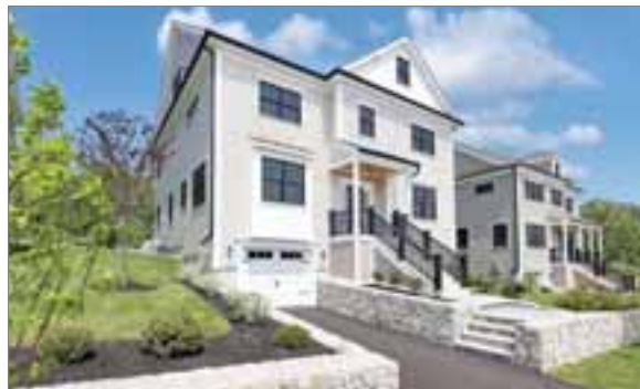
5 STARLING STREET WEST ROXBURY

SINGLE FAMILY 4 beds; 3 full baths $1,199,000 Listed by Lisa Sullivan