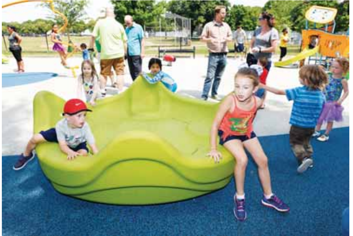
Hyde Park will have its first official Day of Play this weekend at Ross Playground.

If you're looking to contribute to the League, the annual Rotary of West Roxbury vs. the Roslindale/West Roxbury Kiwanis Club "Battle of the Titans" softball game is taking place on Wednesday, Sept. 13 at 6 p.m. at Ohrenberger Field in West Roxbury (175 West Boundary Rd.). Tickets are $25 and can be purchased by Venmo at @rosWRkiwanis (phone confirmation 7633). Tickets include a t-shirt and chef's cookout dinner, which will be sirloin cheeseburgers, gourmet hot dogs, St. Louis pork ribs, chips, sodas, cookies and brownies. Reach out to the Kiwanis at warrenfrankdesign@gmail.com for more information. Rain date is the next day at 6 p.m.