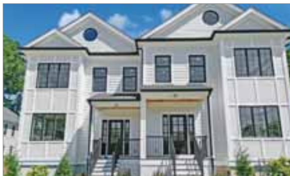
40 CASS STREET U:40 WEST ROXBURY

CONDO 2 beds; 2 full baths $625,000 Listed by Mike & Kris