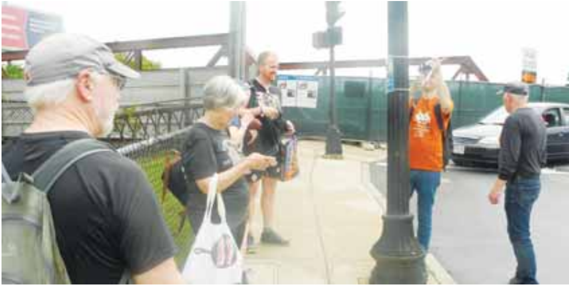
The WCT group walked around parts of a new trail putting up markers to generate interest at Gordon Avenue in Hyde Park