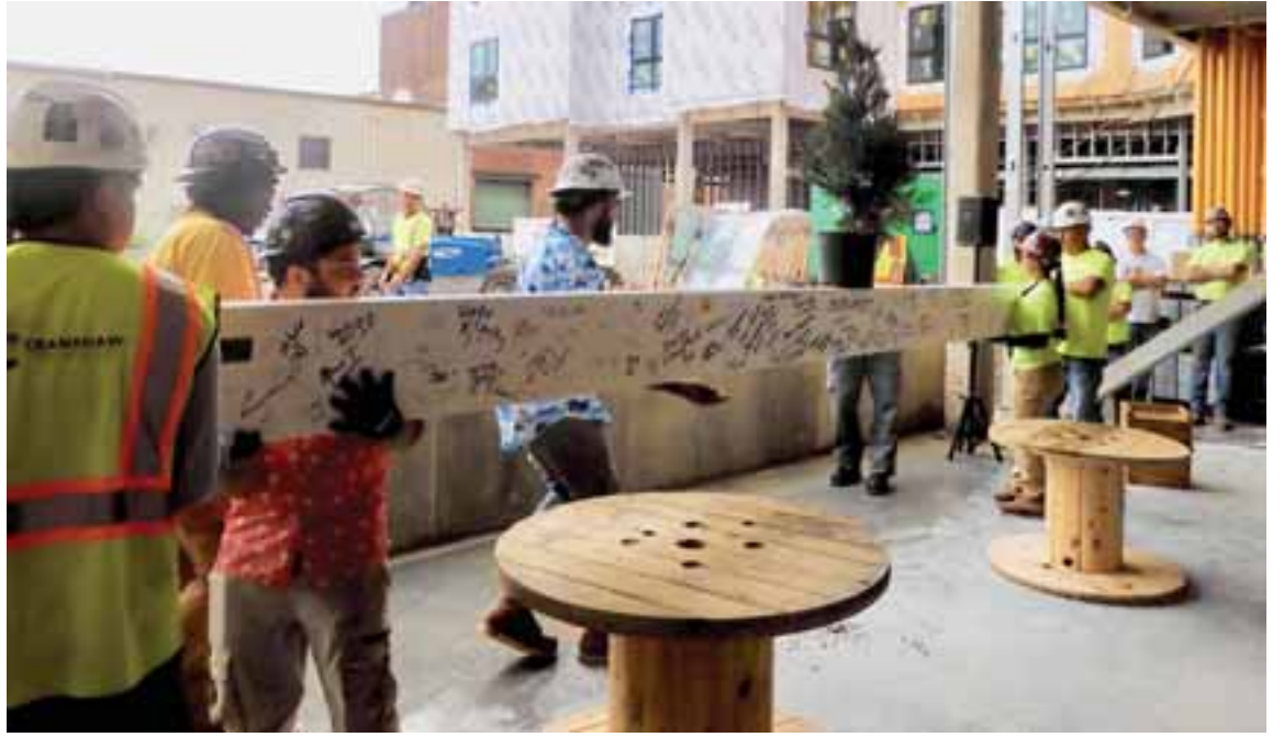
Workers carry the roof beam to the crane so it can be lifted to its final resting place.