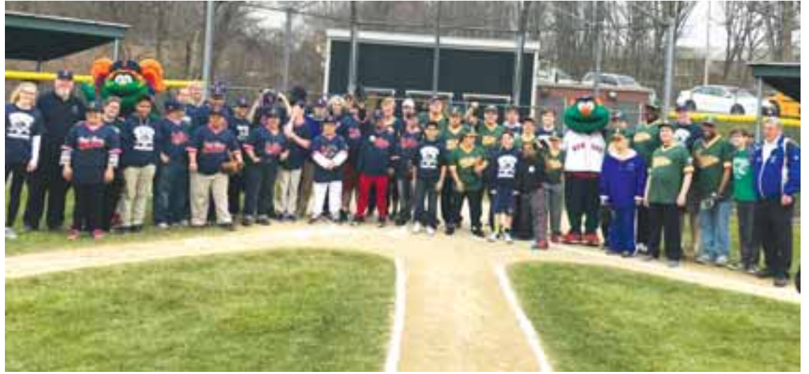
The Jason Roberts Challenger League is finally back after a pandemic hiatus. Organizers say they're looking for new players and Buddies for the summer-fall season.