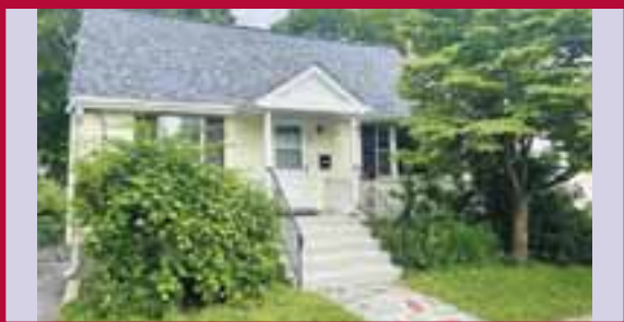
56 Newfield Street, West Roxbury • $574,900 4 Bed, 2 Full Bath Cape. New Roof, modern systems, A+ location. Call for details.