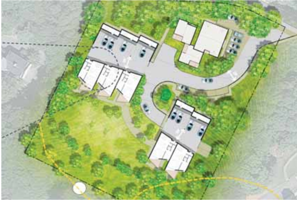
The Boston Zoning Board of Appeals approved an extension for the proposed revised project at 64 Allandale St. on the West Roxbury Jamaica Plain line.