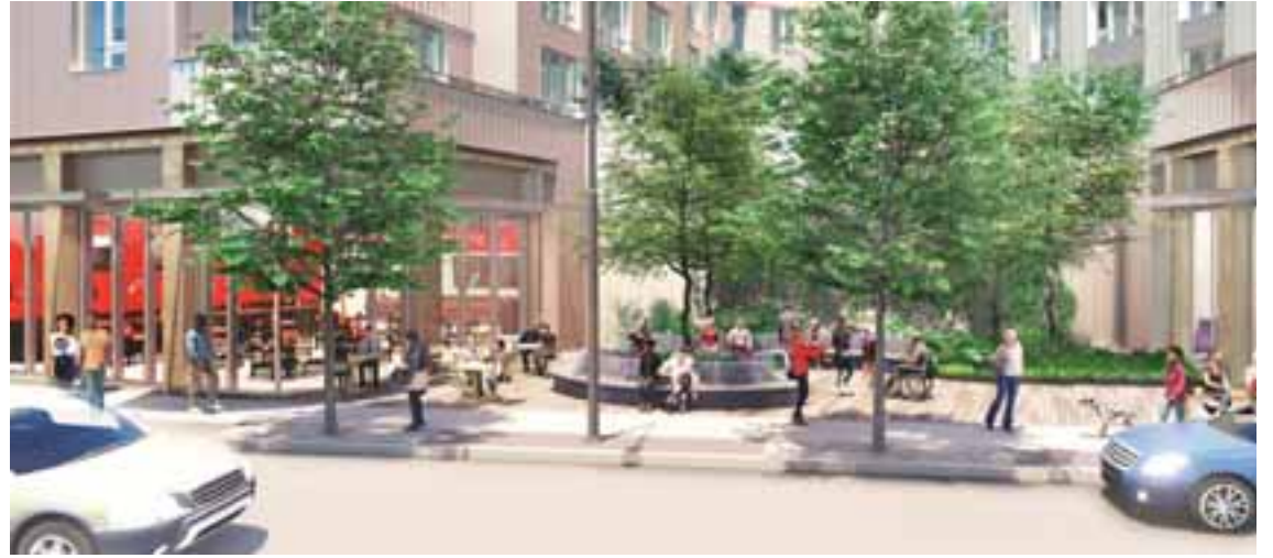
The proposal for 180 Western is looking to increase open space and greenspace on the site, but residents were wary about the specific placements of those areas.

"They're not reality, they're this illusion of, 'Let's sell this to the people and then