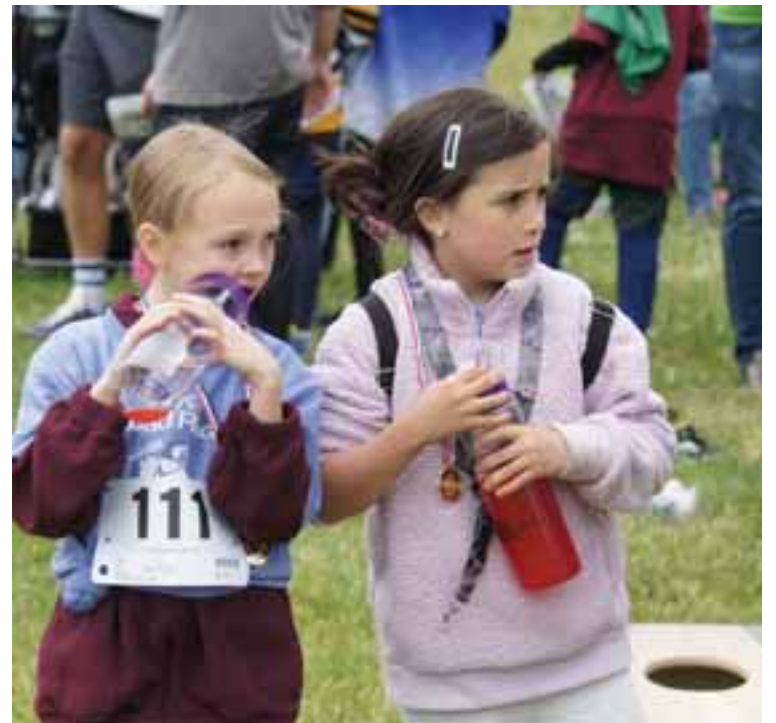
Thousands braved the rain on Sunday to support the Corrib Charitable Trust in West Roxbury.