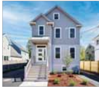
48 WYVERN STREET U:1 JAMAICA PLAIN

SINGLE FAMILY $899,000 3 beds; 1 full, 1 half baths Listed by Lisa Sullivan