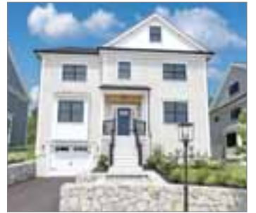
5 STARLING STREET WEST ROXBURY

SINGLE FAMILY $949,000 3 beds; 2 full, 1 half baths Listed by Kris MacDonald