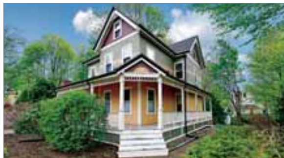
9 SPRING HILL RD HYDE PARK'S FAIRMOUN

CONDO $949,000 3 beds, 2 full, 1 half baths Listed by Kris MacDonald