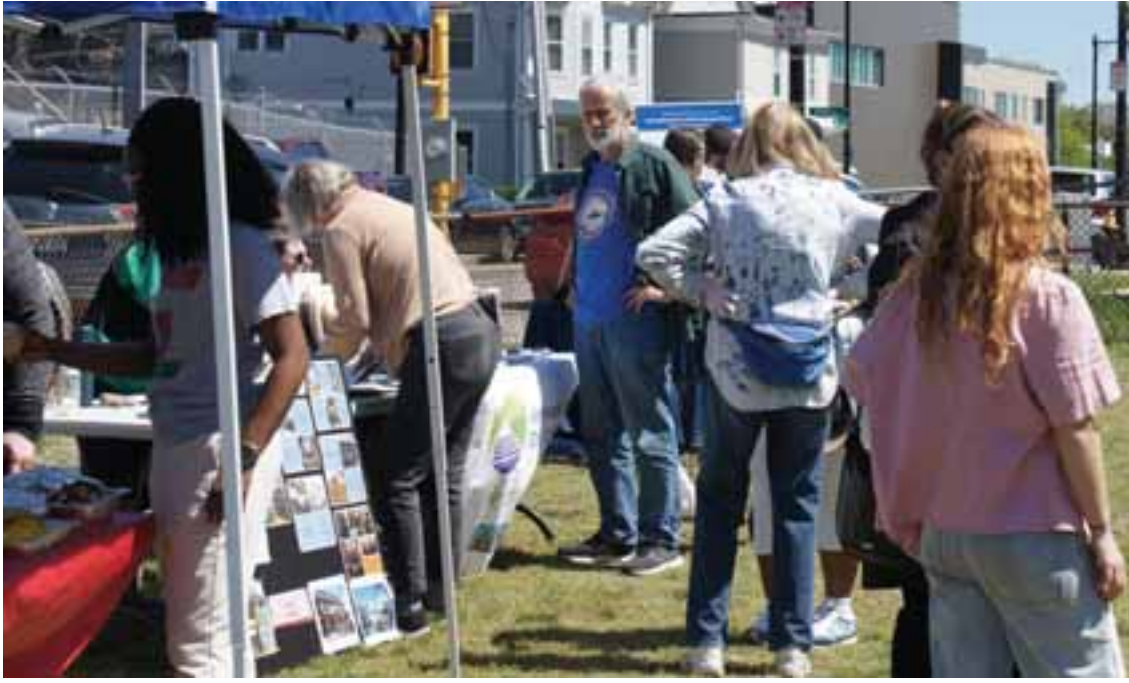
Dozens of residents, officials and even one EPA representative came out to celebrate the current and upcoming work slated for Doyle Park in Hyde Park.