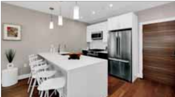
425 LAGRANGE STREET U:205 WEST ROXBURY

CONDO $650,000 2 beds, 2 full, 0 half baths Listed by Kris & Mike