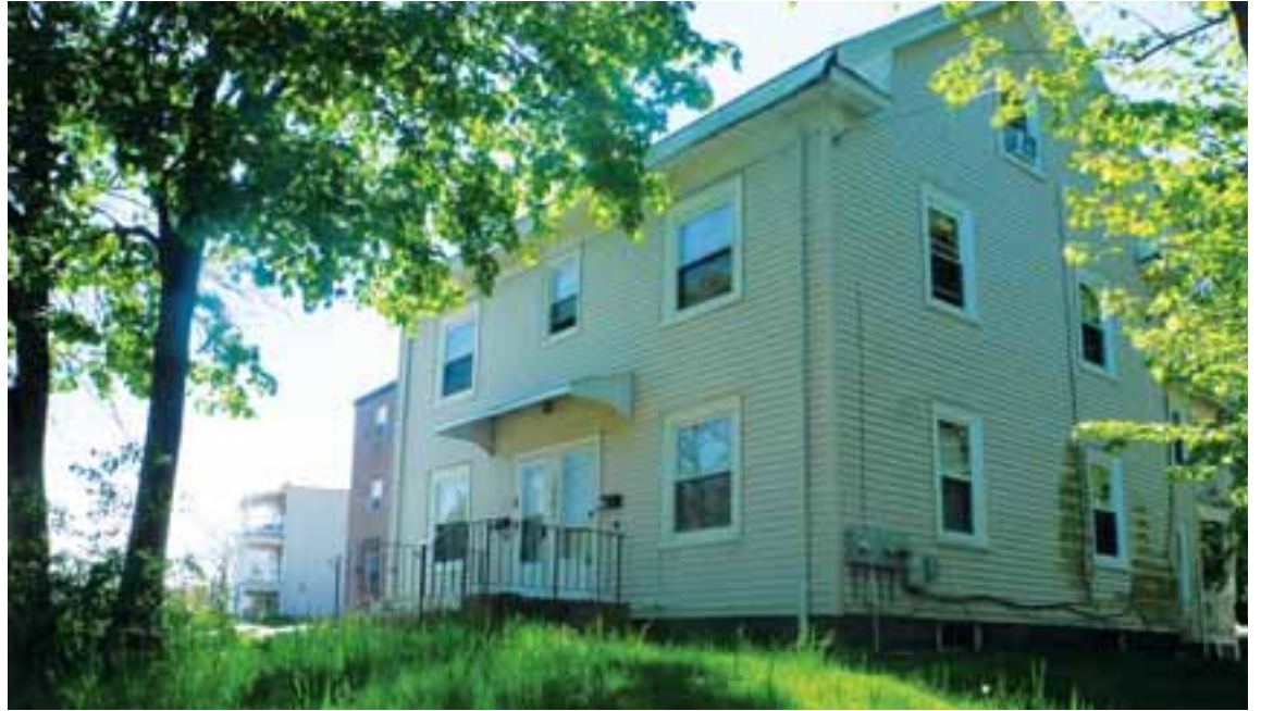
A look at the current building sitting on 1081 River St. in Hyde Park.