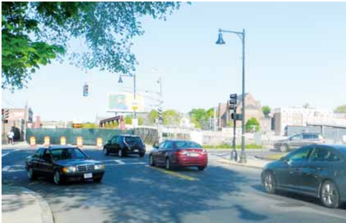
A view of the River Street Bridge from Business and River Streets.