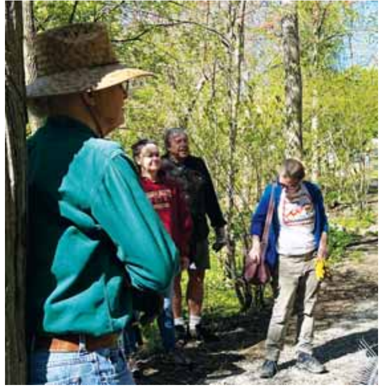
Residents came out to cleanup the wetlands and take a look at what spring has brought to the public park area.

For more information on the proposed mixed use project at 76 Ashford St., visit www.bostonplans.org/projects/development-projects/76-ashford-street .