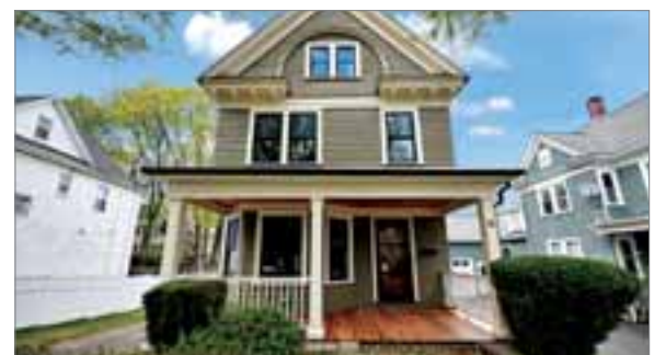
15 ALDRICH STREET ROSLINDALE

SF $950,000 5 beds, 1 full, 1 half baths Listed by Pat Tierney