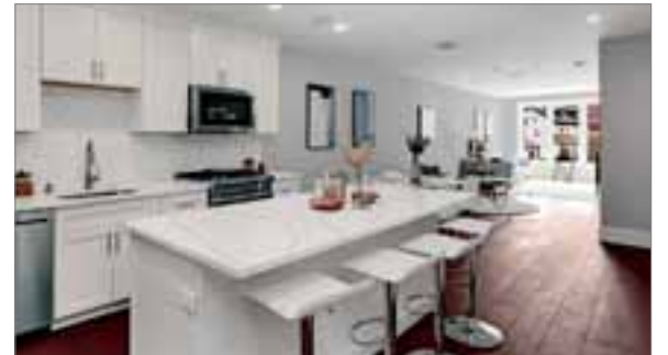
480 WEST BROADWAY U:102 SOUTH BOSTON

CONDO $705,000 2 beds, 2 full, 1 half baths Listed by Kris & Mike