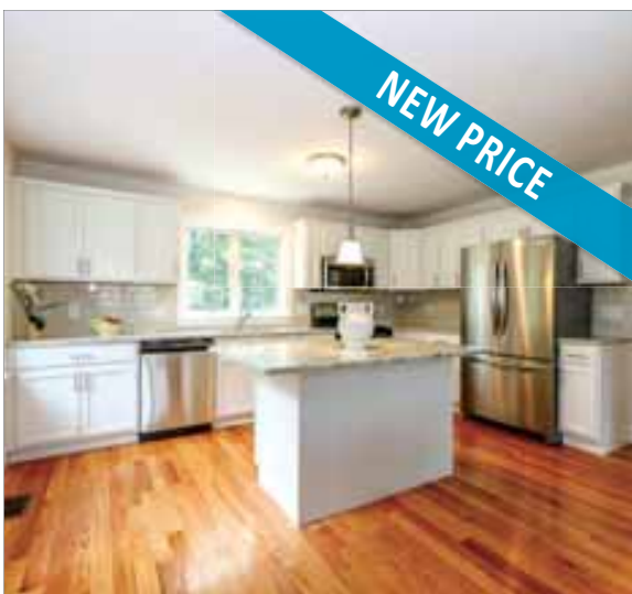
42 WOODLEY AVENUE WEST ROXBURY $739,900