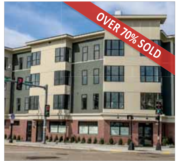
1789 CENTRE STREET WEST ROXBURY From $649,000