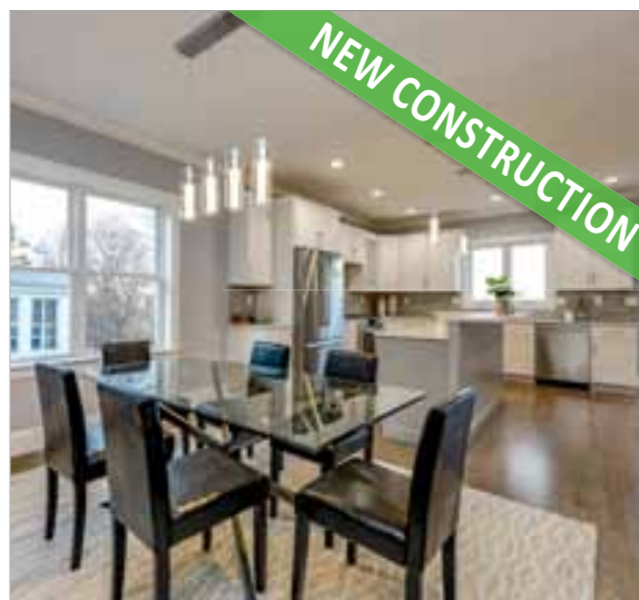
9 BRAHMS STREET ROSLINDALE $895,000