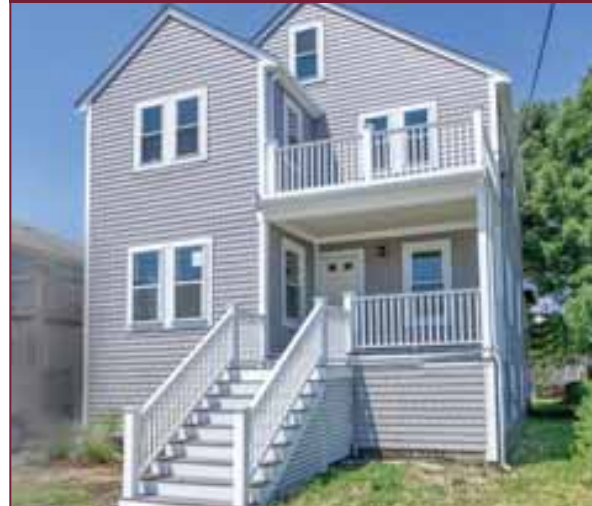
47 B STREET, HULL

Walk to the beach from this gut renovated 4 bedroom, 2 full bath home! Open floor plan, new floors, walls, roof, plumbing and electric! This property has a brand new second floor added 2019. Kitchen has granite counter top, gas cooking and plenty of cabinets walk out to deck. First floor bedroom would make a great home office. 2 brand new full baths. Convenient laundry hook up on second floor. Ample parking for 6 cars. Nice back yard. Ocean views from second floor. Easy walk to restaurants, easy drive to commuter boat! Location can not be beat! $759,900