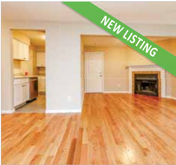
11 MARION STREET UNIT E ROSLINDALE $389,000