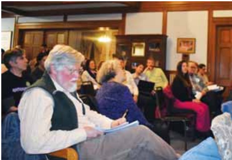
More than 130 residents came by for the first meeting of the year for the Brighton Allston Community Coalition.