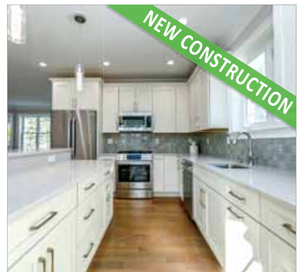
94 CASS STREET WEST ROXBURY $1,129,000