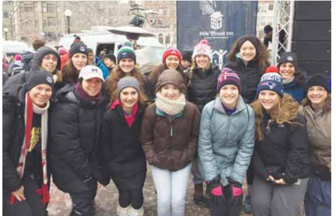
The fourth-annual Boston Winter Walk went off without a hitch at Copley Plaza on Feb. 9. Hundreds came out to walk the streets and link arms with those who experience homelessness and to listen humbly to their stories. One hundred percent of the funds raised are distributed every year organizations like Bridge Over Troubled Waters, Brookview, the Boston Healthcare for the Homeless Program and more.