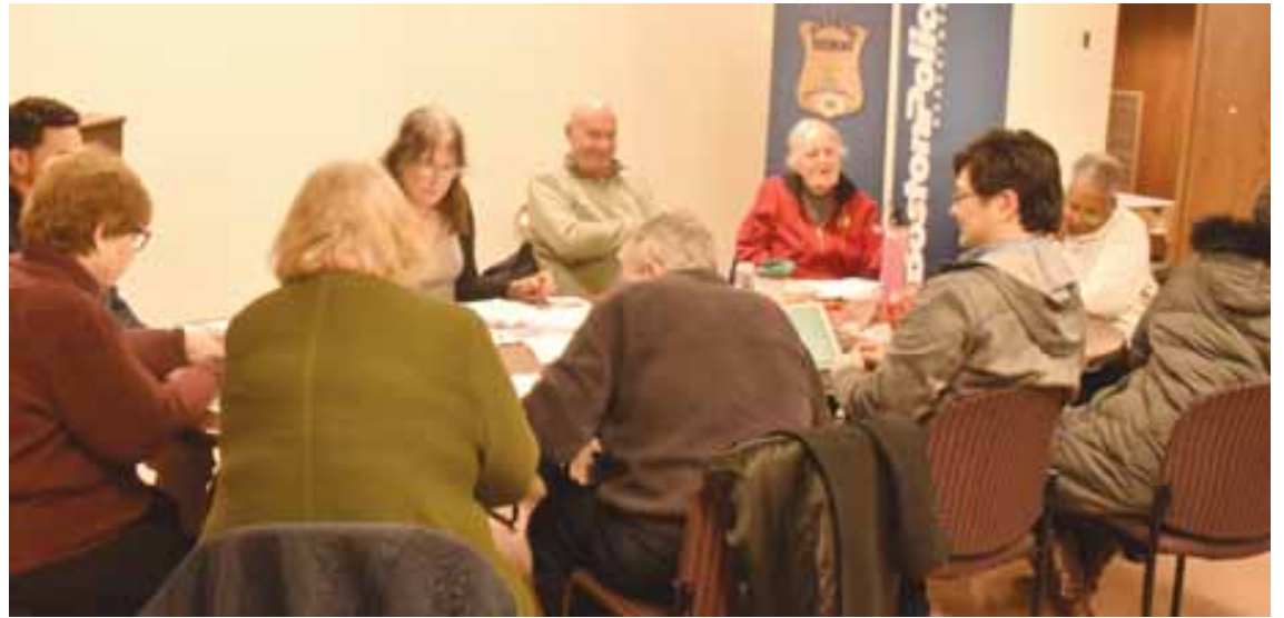
The Neponset River Greenway Council discussed several upcoming trail walks to boost residents' awareness of what the Neponset River has to offer.

"I think that some people think we've done so much in this area, that it's time to put DCR funding somewhere else," she said, stressing that more can be achieved.