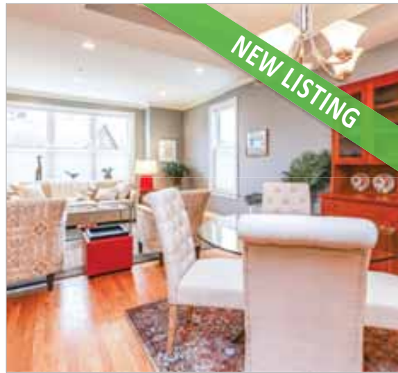
345 BELGRADE AVENUE UNIT 2 ROSLINDALE $624,900