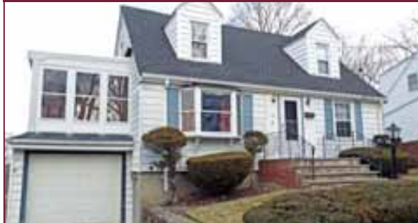
19 PEAK HILL ROAD, WEST ROXBURY

Great Neighborhood, good bones and updated systems including young roof!! 2/3 BR, 1.5 bath, Cape style home, offers garage and nice lot but needs updating. Worth the investment in this top location! $549,900