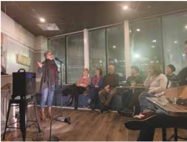
Dozens of residents came out to have a drink, eat some grub and raise funds for the Roslindale Branch of the Boston Public Library.