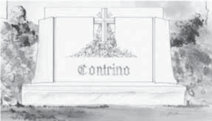
A CENTURY OF SERVICE TO THE COMMUNITY