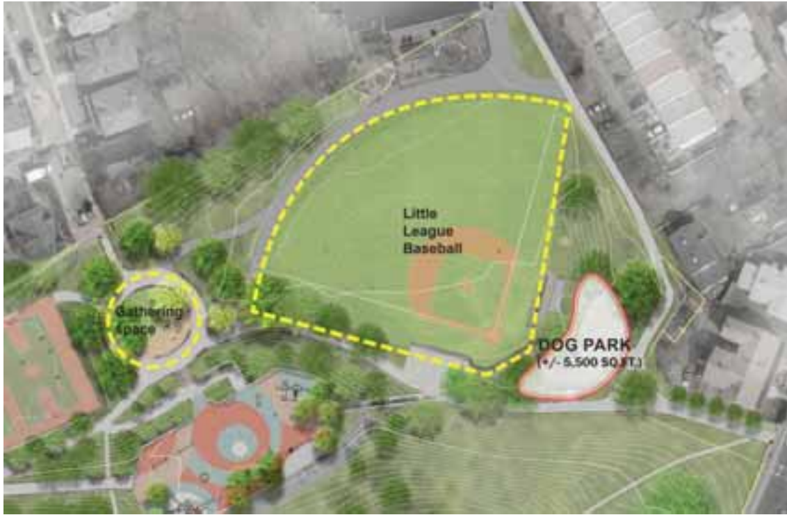
A dog park is slated for the redesign of Ringer Park, which will be the first work the park has seen in decades.