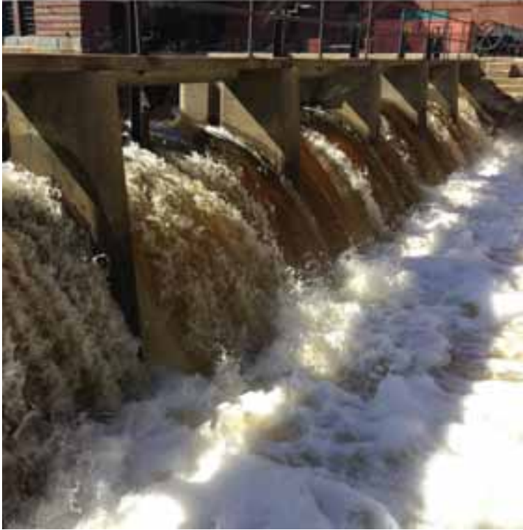
The Baker Dam on the Neponset River will be the subject of the Superfund Cleanup coming from the federal government in the coming years.