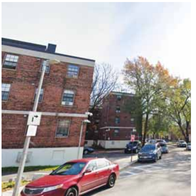
The City Council will be taking stock of the Boston Housing Authority's buildings in the coming months after a death at the McCormack complex in South Boston.