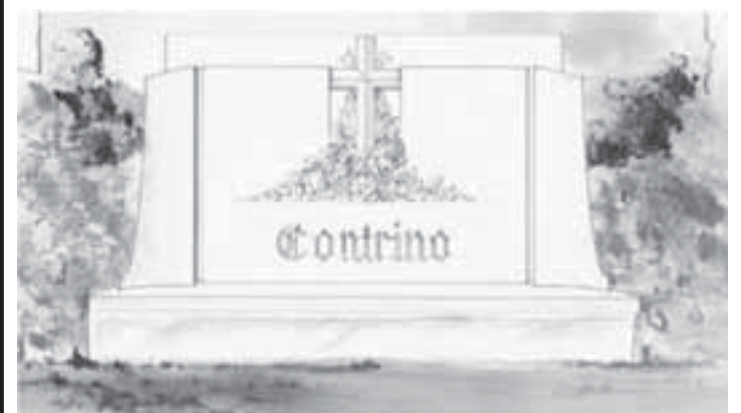
A CENTURY OF SERVICE TO THE COMMUNITY