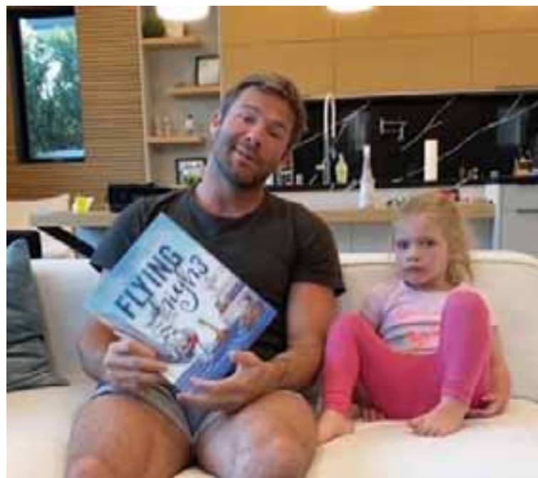
New England Patriots star Julian Edelman read Flying High for his Scholar Storytime segment on BNN, a book he also wrote.

“I mean there are kids who are, possibly, taking the SAT’s in a couple of weeks and they’re getting help live on BNN for those tests,” he said.