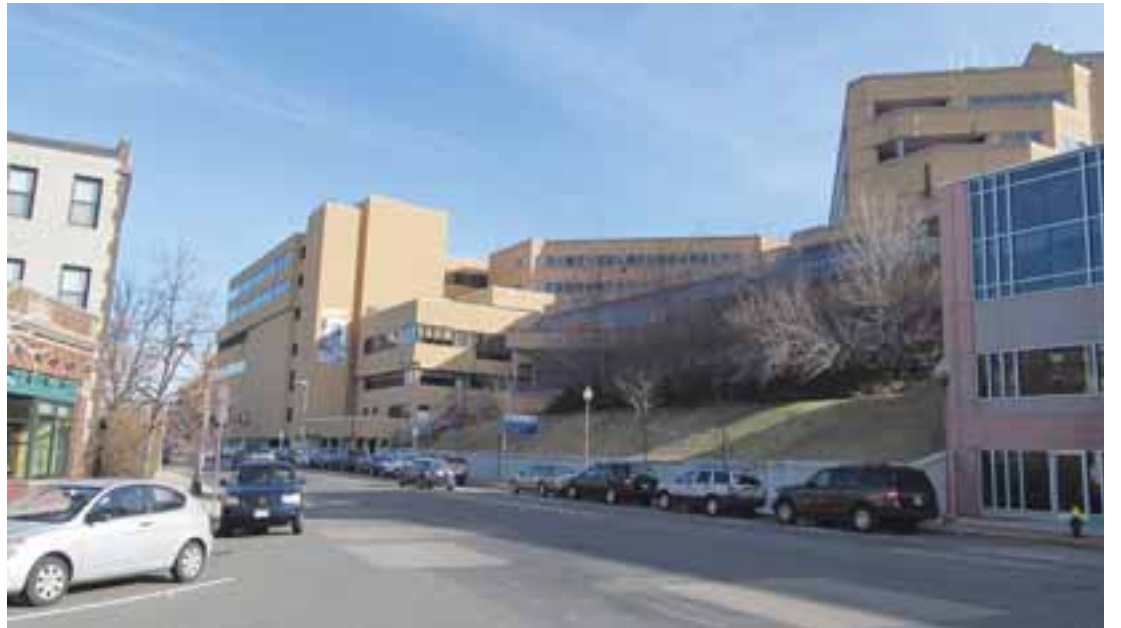
Any Steward worker who joined their local union will be safe at St. Elizabeth's from losing their 401(k) matched contributions.