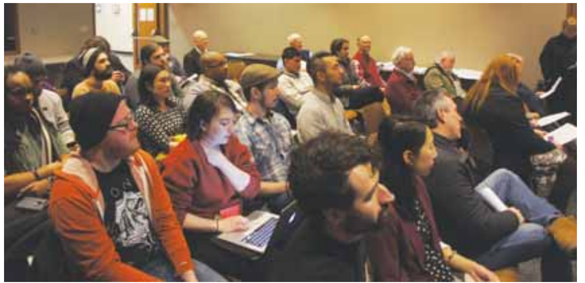
About 40 residents came out to the Allston Civic Association to hear about improvements and changes coming to the neighborhood.

Also discussed during the meeting was the installation of a new 100-square foot retail doughnut shop at 100 Holton St., as well as a 5,200 square-foot baking operation. The proposal came from Blackbird Doughnuts,