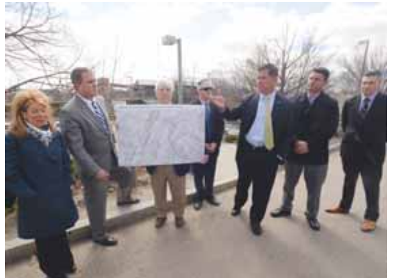
Two years ago Boston Mayor Marty Walsh announced improvements to the Father Hart Bridge, work on which will start this year.