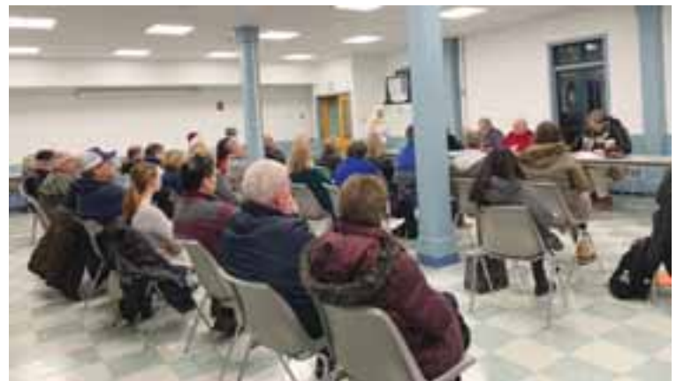
Dozens of neighbors came out to oppose several WRNC items put forth to the council.