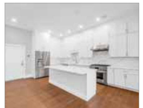
480 WEST BROADWAY U:403 SOUTH BOSTON

SINGLE FAMILY 4 beds; 2 full, 1 half baths Listed by Rosemar Realty Group $1,650,000