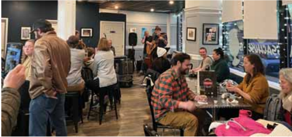
Dozens of residents came out to support this year's Roslindale Porch Fest, coming up in the fall.