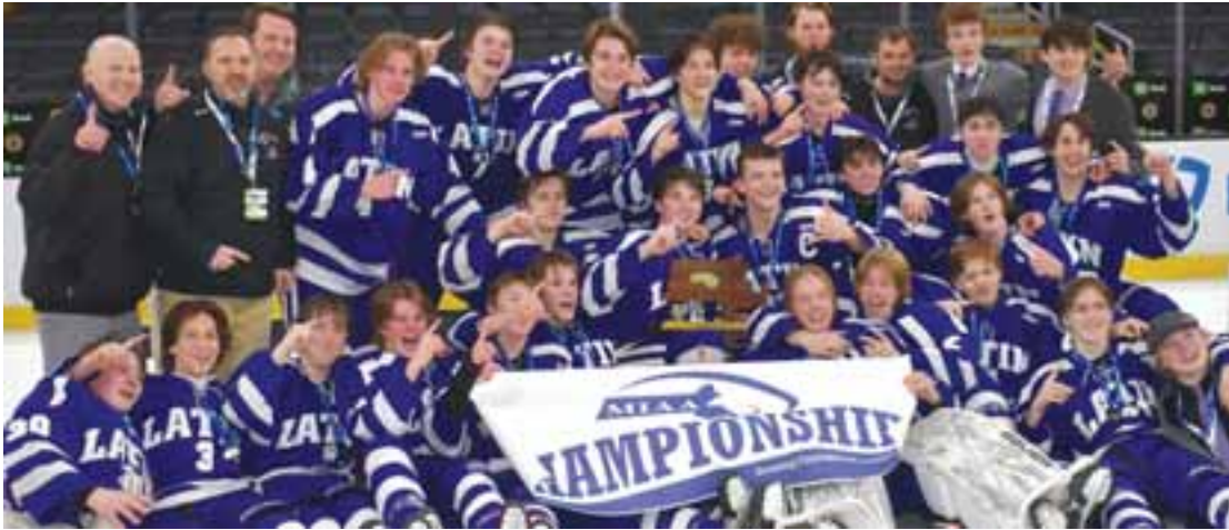
The Boston Latin Boys hockey team celebrates their Division 2 state title championship on Sunday, March 17 in Boston after beating Tewksbury 4-2 and ending the season at 17-8.