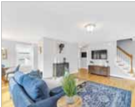
11 WEBSTER STREET U:1 HYDE PARK

YOUR EXPERT REAL ESTATE TEAM FOR BUYING OR SELLING IN AND AROUND THE BOSTON AREA!