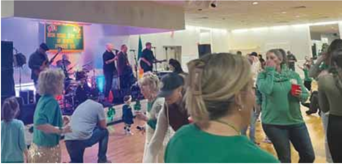
The Irish Social Club in West Roxbury hosted a lively St. Patrick's Day celebration this past weekend.