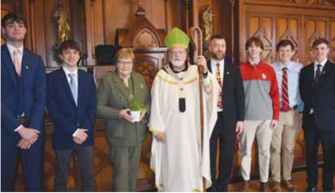
Students from Catholic Memorial High School join for a photo with Cardinal Sean O'Malley on St. Patrick's Day at the Cathedral. An annual tradition, the boys took part in the Mass by reading the Prayers of the Faithful in English and Gaelic.