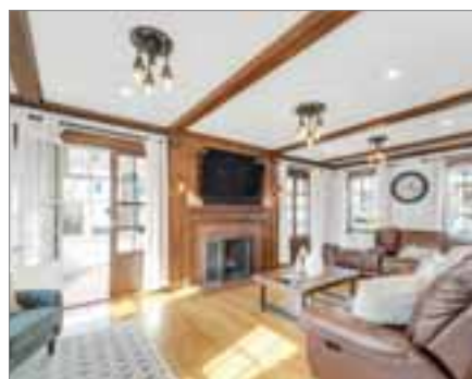
184 BELLEVUE STREET WEST ROXBURY

CONDO 2 beds; 2 full, 1 half baths Listed by Mike & Kris $1,100,000