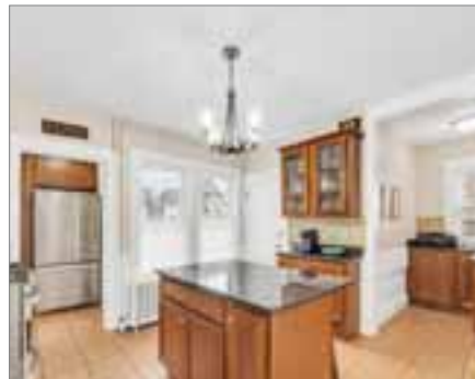
31 PRIMROSE STREET U:1 ROSLINDALE

CONDO 3 beds; 2 full, 1 half baths Listed by Pat Tierney $579,900