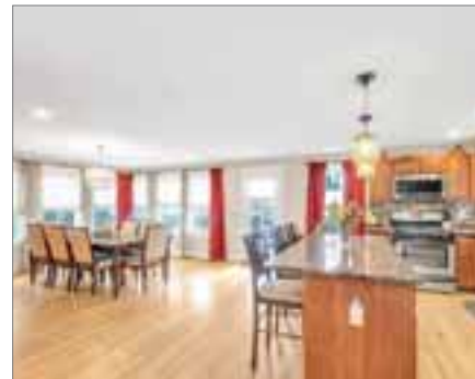
48 ROSEBERY ROAD U:48 HYDE PARK

CONDO 2 beds; 1 full bath Listed by Kris MacDonald $599,000