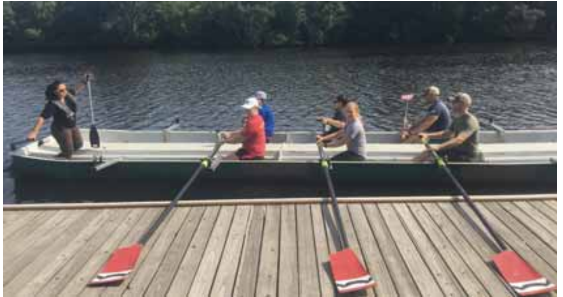
Hope for the Warriors conducts a rowing clinic to reinvigorate veteran's camaraderie and strengthen their relationship with the community. They held a rowing event in Brighton over the weekend to this end.