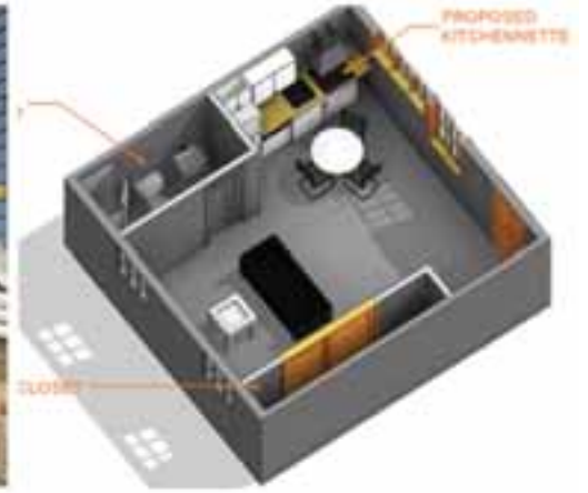
The garage behind 294 South Street with a schematic of the proposed living spaces.