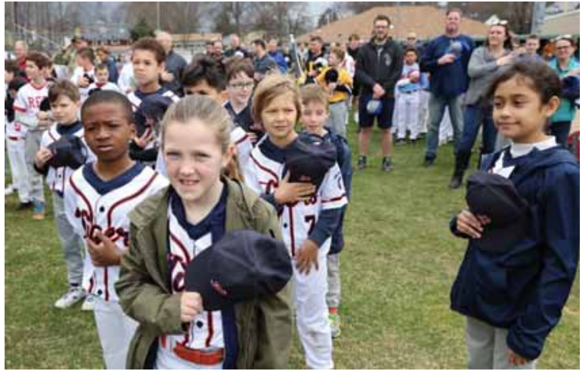
The Parkway Little League Opening Day Parade is coming back in full force this year and organizers are using it as a bullhorn to ask the community for help in funding field repairs.