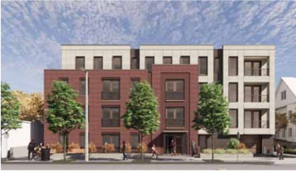
The Zoning Board of Appeals approved a rarity in Allston, homeownership units, at its meeting last week.