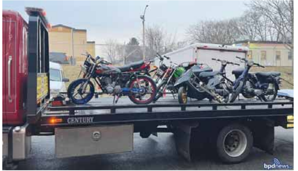
Several vehicles, fentanyl, other drugs and weapons were recovered and four people were arrested in the bust.

The BPD reported executing a search warrant at the self storage garage at 44 Lochdale Rd. in Roslindale. The warrant was carried out by the District E-5 Drug Control Unit (West Roxbury/Roslindale), the District D-4 Drug Control Unit (South