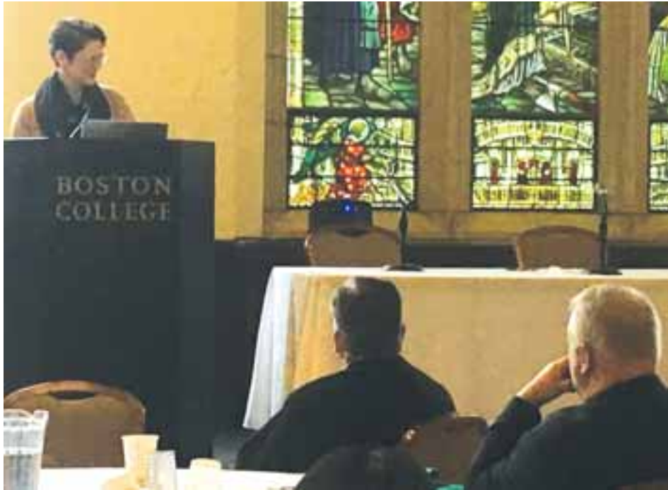
Catholic leadership from all over the country came to Boston College over the weekend to discuss the future of the church.