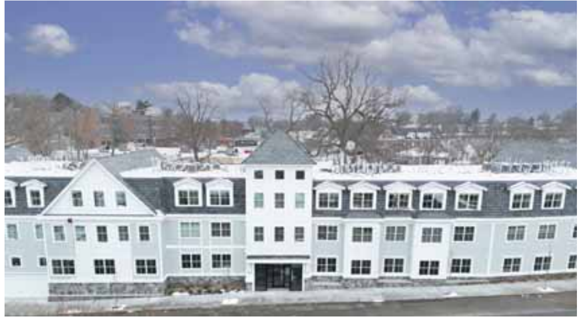
The new building at 425 LaGrange St. is finally finished and ready for residents to come by and see what's on offer.