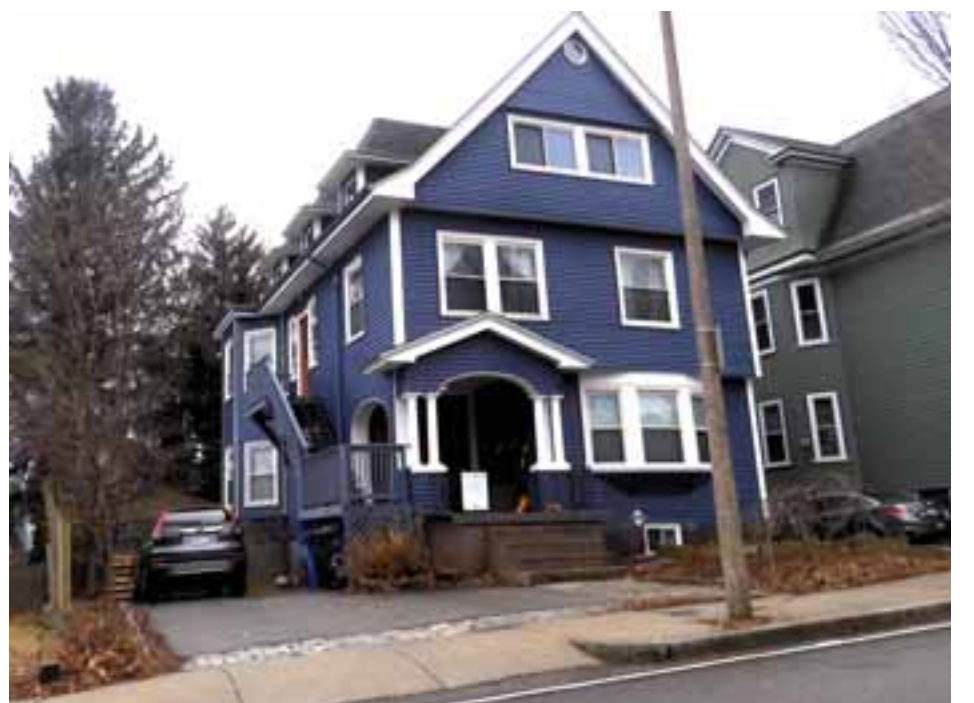
The owner of this house is looking to create a new unit out of the garage behind the main structure at 294 South St. in Jamaica Plain.