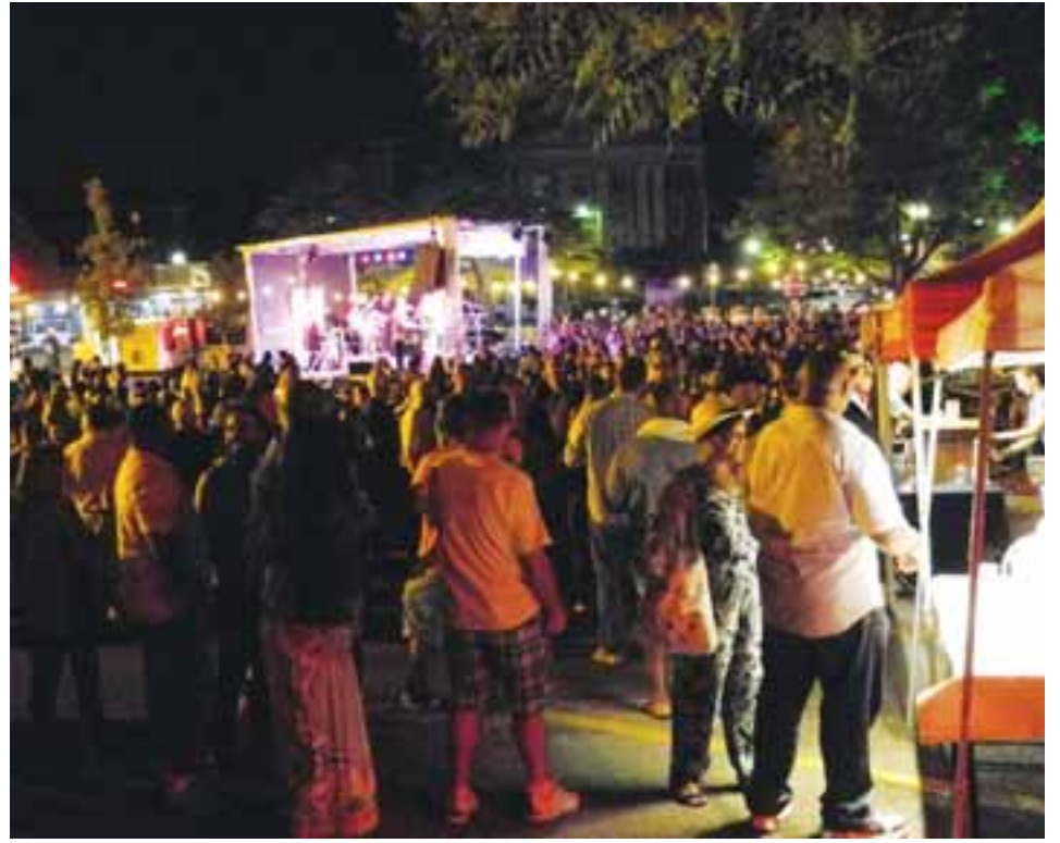
The Hyde Park Board of Trade met recently and discussed the upcoming Celebrate Hyde Park Festival, which is an offshoot of the 2018 150th birthday celebration of the neighborhood.