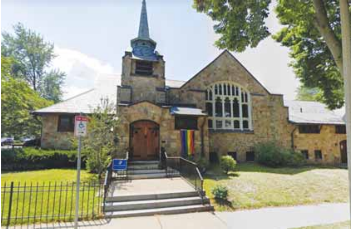
Food pantries in Boston, like the Rose's Bounty in West Roxbury, are seeing a large uptick in demand going into the fall and winter months.