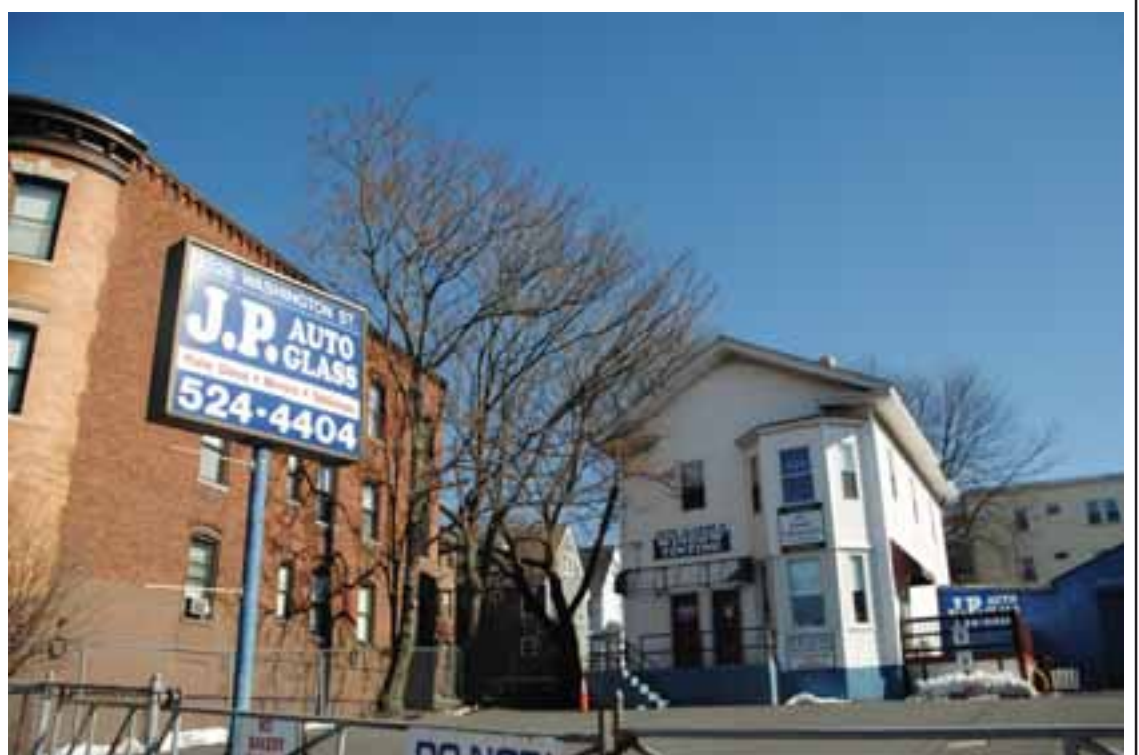
The site of Jamaica Plain Glass that Primary plans to build on.