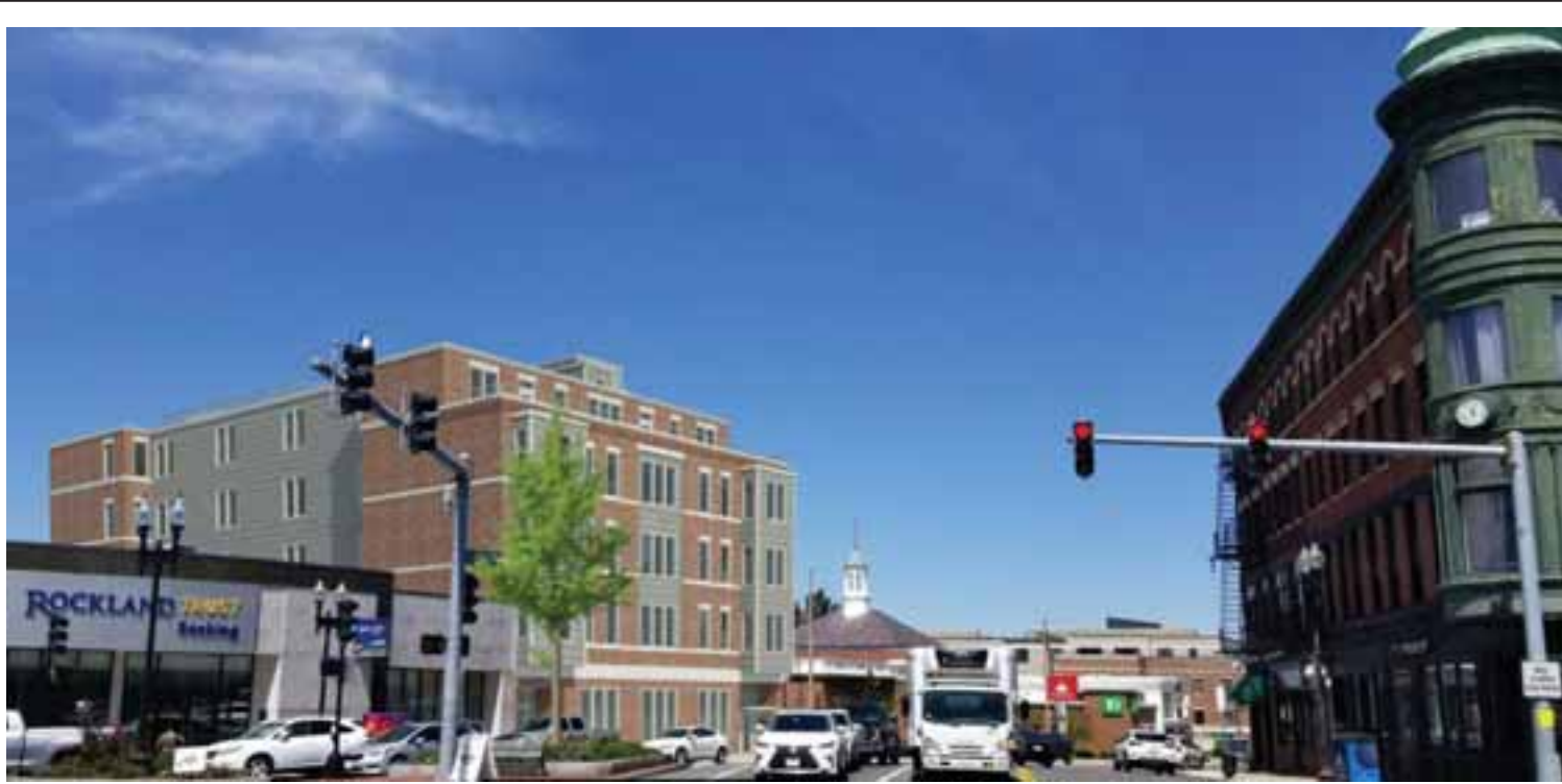
The Zoning Board of Appeals approved a chicken coop in West Roxbury and this larger structure on Market Street in Brighton.