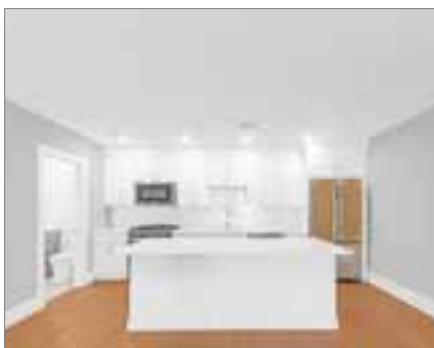
480 WEST BROADWAY U:105 SOUTH BOSTON

SINGLE FAMILY 4 beds; 2 full, 1 half baths Listed by Michael Hunt $1,099,000