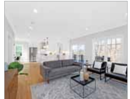
1811 RIVER STREET HYDE PARK

CONDO 3 beds; 2 full, 1 half baths Listed by Pat Tierney $699,999