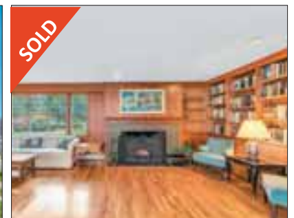
1025 High St, Dedham