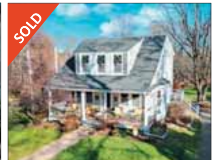
232 Messinger St, Canton