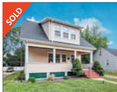
262 Whiting Ave, Dedham