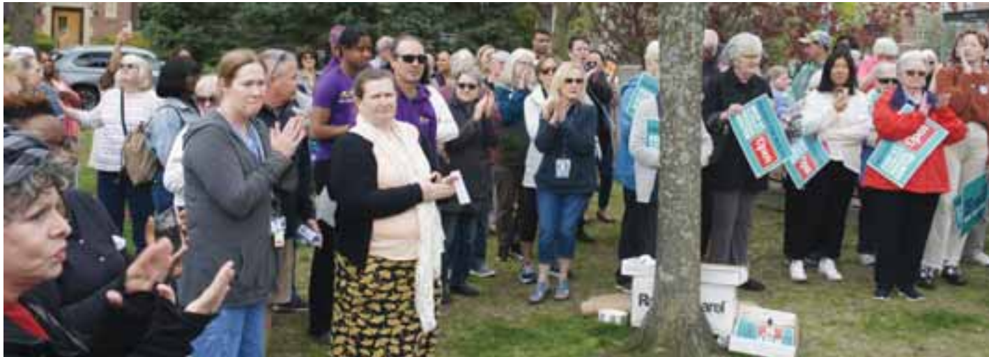
About 80 residents, nurses, and politicians came out to support the staff at St. Elizabeth's Hospital.