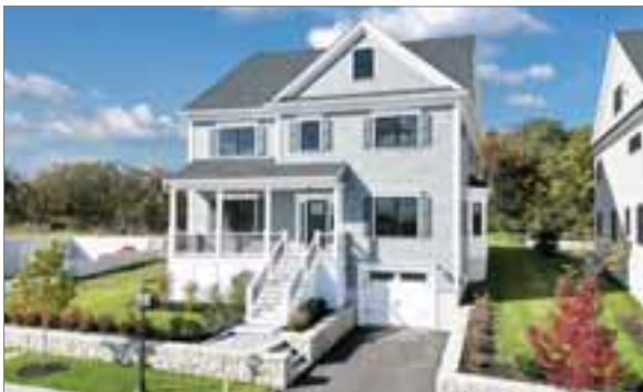
7 STARLING STREET WEST ROXBURY

CONDO $799,000 2 beds; 1 full, 1 half baths Listed by Mike & Kris