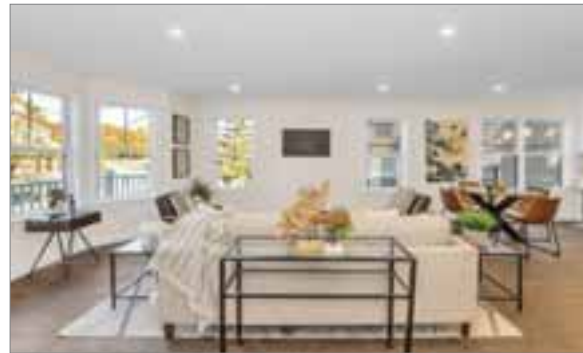
514 POPLAR STREET U:1 ROSLINDALE

CONDO $695,000 2 beds; 2 full baths Listed by Insight Realty Group