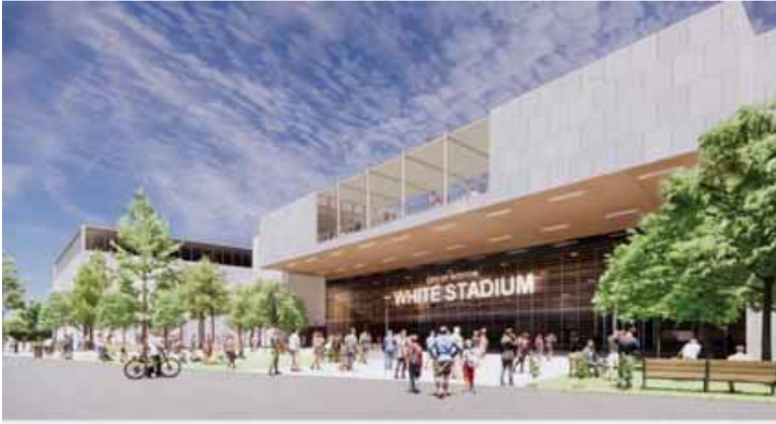
An architect's elevation of proposed BSP gym building on the east grandstand.