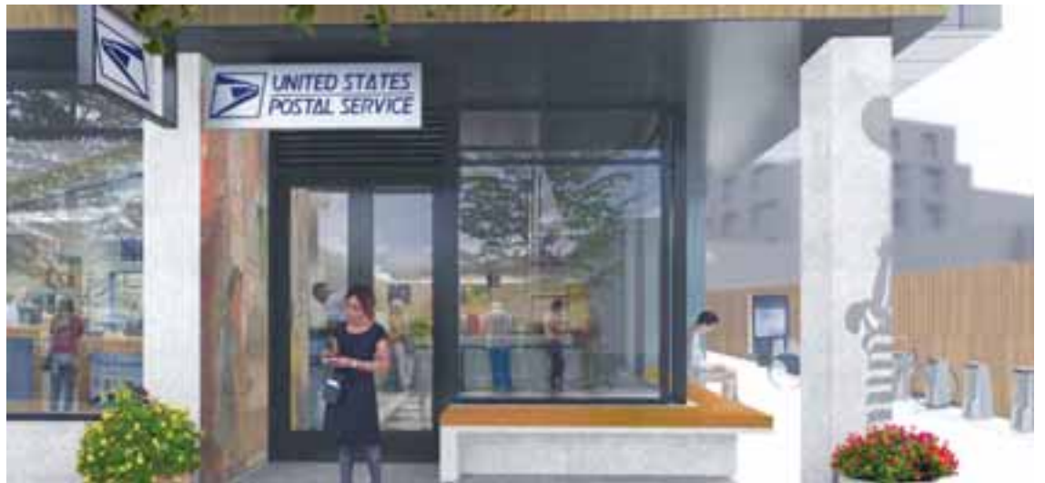
The new facade of the proposed post office in Allston has been welcomed by residents during the BPDA approval process.