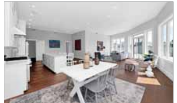
480 WEST BROADWAY U:402 SOUTH BOSTON

SINGLE FAMILY $1,749,000 3 beds; 3 full, 1 half baths Listed by Michael Keane