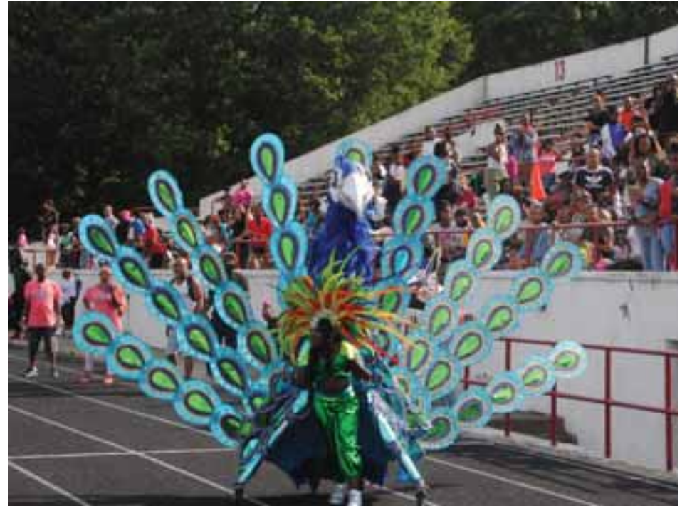
A view of the Kiddies Carnival, which has played in White Stadium every August since 1984.