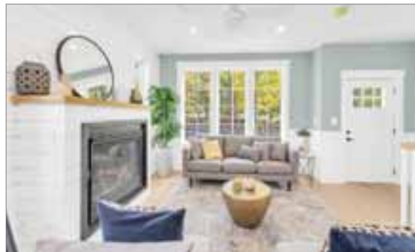
97 CALL STREET JAMAICA PLAIN

SINGLE FAMILY $1,650,000 4 beds; 2 full, 1 half baths Listed by Rosemar Realty Group