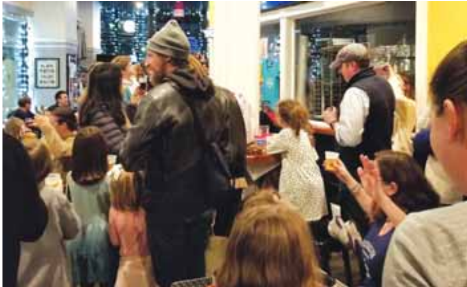
About 50 residents packed into the Distraction Brewing Company for Roslindale's early kick-off to 2024.