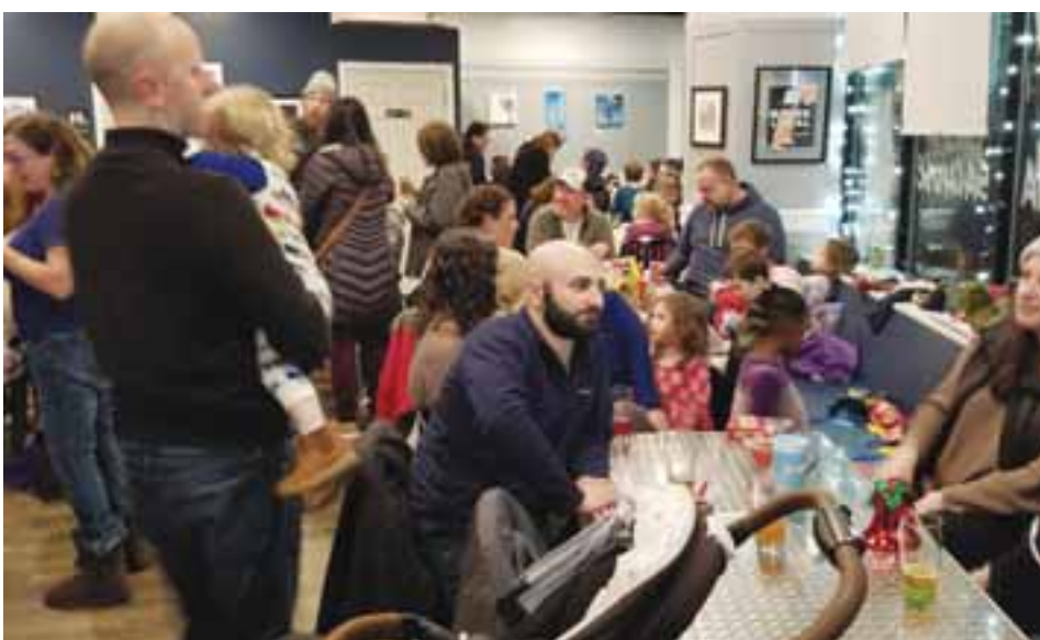
The brewery provided plenty of activities to "distract" patrons during the event.