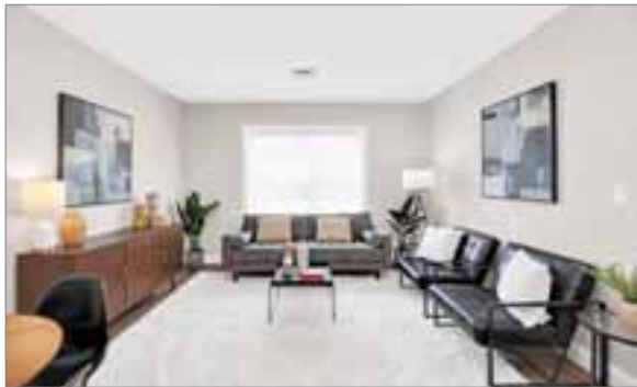
425 LAGRANGE STREET U:305 WEST ROXBURY

YOUR EXPERT REAL ESTATE TEAM FOR BUYING OR SELLING IN AND AROUND THE BOSTON AREA!