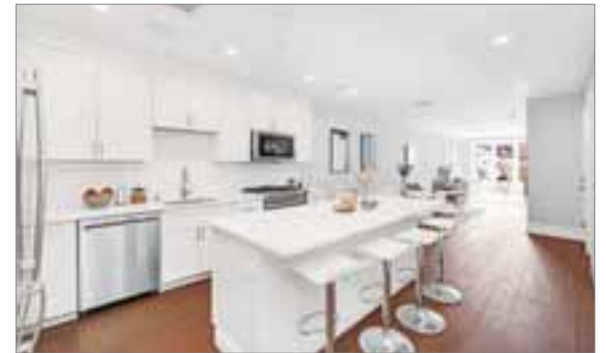
480 WEST BROADWAY U:202 SOUTH BOSTON

CONDO $749,000 3 beds; 2 full baths Listed by Steven Musto