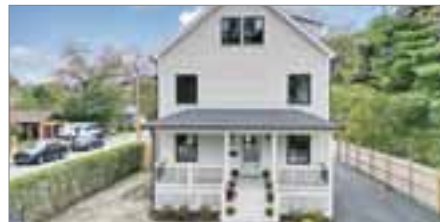
275 PARK STREET WEST ROXBURY — Single Family 5 beds; 3 full, 2 half baths | $1,549,000 Listed by Steven Musto