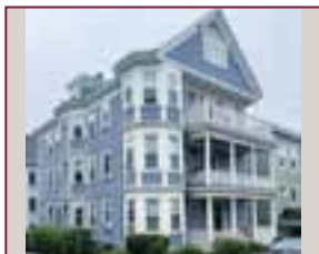
43 Parker Hill Ave. Mission Hill SOLD!