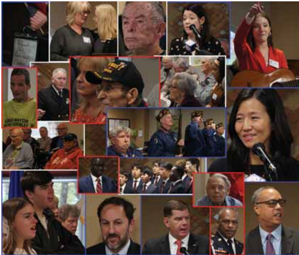
About 100 residents came out for the 13th annual Veterans Day Celebration at the German Center in West Roxbury.