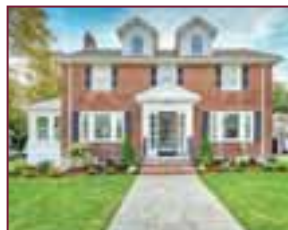
205 Bellevue St. West Roxbury UNDER AGREEMENT