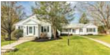
1025 HIGH STREET DEDHAM, MA — Single Family 4 beds; 2 full, 1 half baths | $1,099,900 Listed by The Ultan and Caitlyn Team

YOUR EXPERT REAL ESTATE TEAM FOR BUYING OR SELLING IN AND AROUND THE BOSTON AREA!