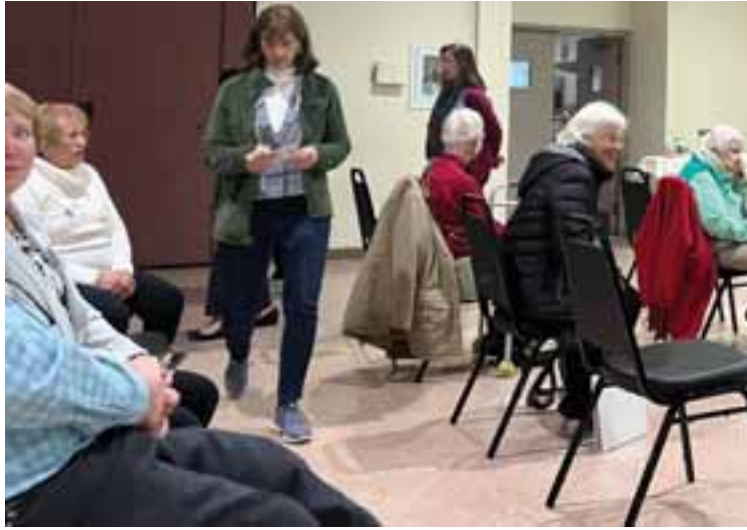
Residents heard about efforts to make Franklin Park a little more green.

“There are a lot of challenges here, and it’s a bit of a