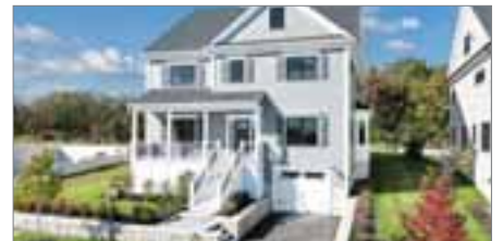
7 STARLING STREET WEST ROXBURY — Single Family 4 beds; 2 full, 1 half baths | $1,650,000 Listed by Rosemar Realty Group