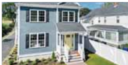
107R READVILLE ST, U:107R HYDE PARK'S READVILLE — Condo 4 beds; 2 full, 1 half baths | $799,000 Listed by Kris MacDonald