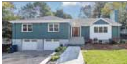
22 VFW PARKWAY WEST ROXBURY — Single Family 5 beds; 3 full baths | $1,495,000 Listed by Michael McGuire