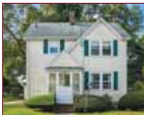
41 Bogandale Rd. West Roxbury UNDER AGREEMENT