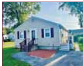
83 Hooper Rd. Dedham SOLD!