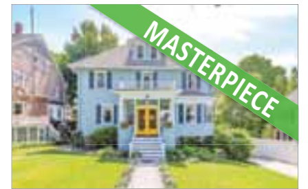
200 MOUNT VERNON STREET WEST ROXBURY $1,600,000 Listed by Lisa Sullivan