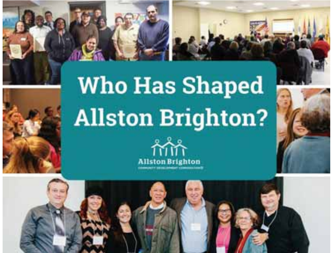
The ABCDC is asking you to nominate a resident, business or organization you believe has made an impact on the dual neighborhood.

To nominate someone you know who has made a difference in the community, go to https://www.tfaforms.com/4833489 or nominate via email at info@allstonbrightoncdc.org .