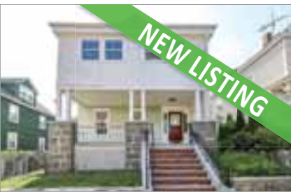
35 PHILBRICK STREET ROSLINDALE $739,000 Listed by Dave Greenwood