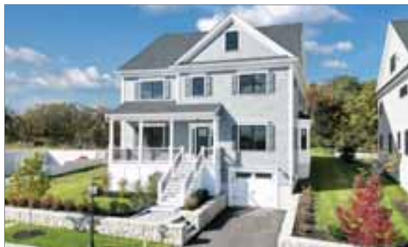
7 STARLING STREET WEST ROXBURY

5 beds; 3 full, 2 half baths Listed by Steven Musto