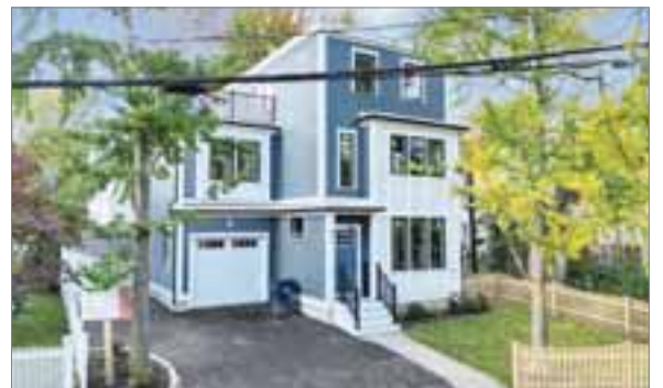
97 CALL STREET JAMAICA PLAIN

4 beds; 2 full, 1 half baths Listed by Rosemar Realty Group