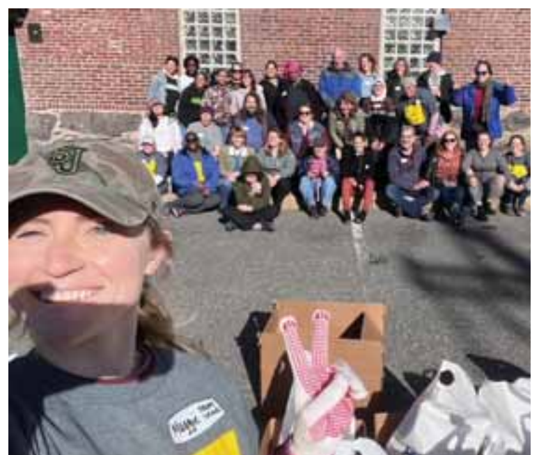
Dozens of volunteers boxed up and delivered 180 boxes of food to the JP neighborhood recently.