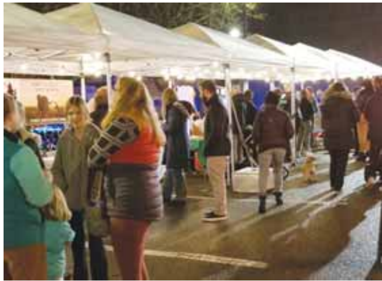
Dozens of residents braved the rain last week and went to the annual WR Holiday Market.