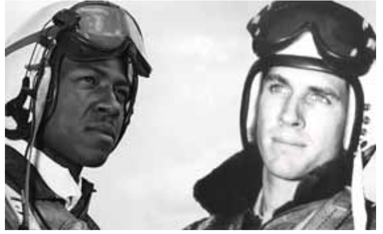
Korean War veterans Jesse Brown, left, and Thomas Hudner, right.

Hudner's wingman on December 4 was Jesse Brown. Both in their twenties, the two could not have been more different. The former was a New Englander who as a graduate of prep school had been invited to Harvard University. Brown, the son of a Mississippi sharecropper, broke the Navy's racial barrier for pilots, just months after President Truman had ordered