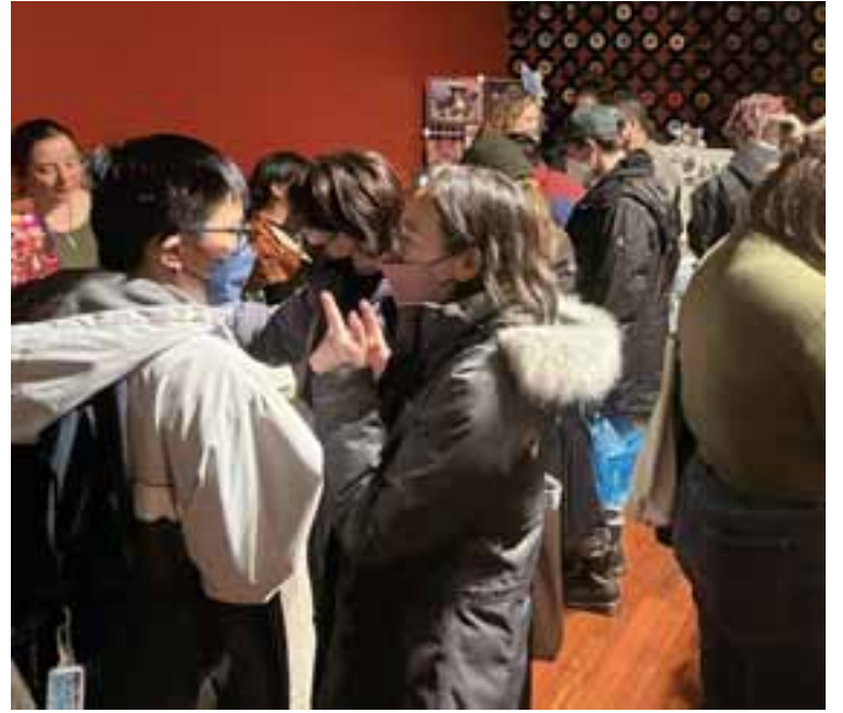
The Queer Neighborhood Council recently held its first artist market in Allston on Sunday.

For more information about the RFC and their upcoming free food distributions, visit www.facebook.com/rosifoodcollective .