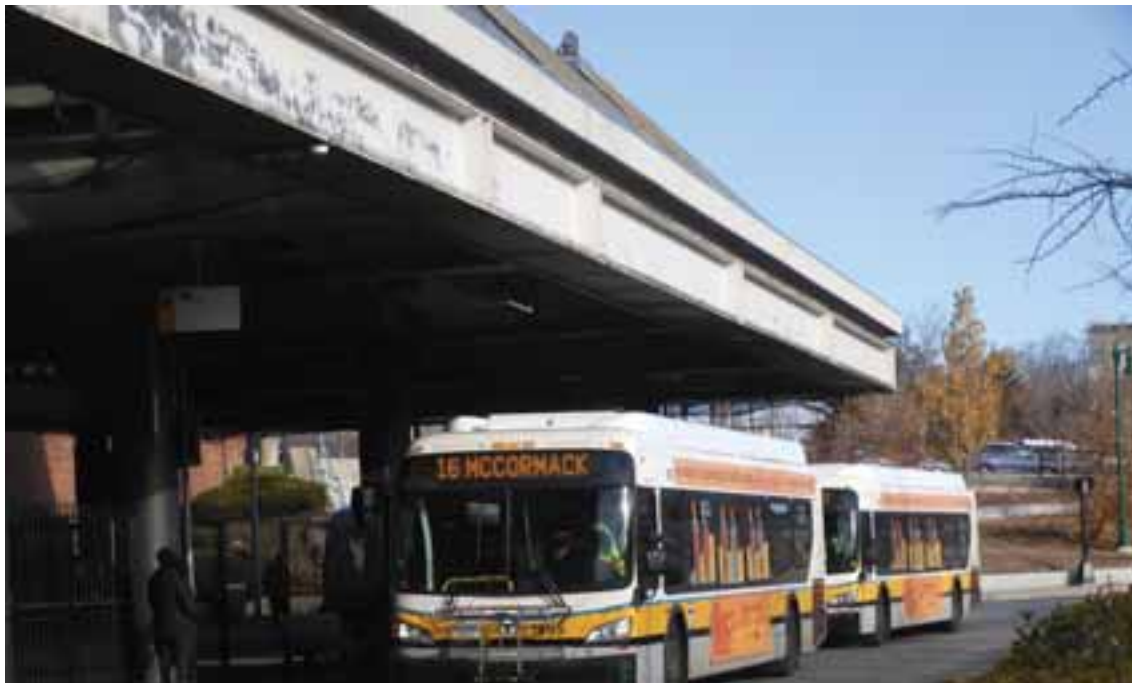
Passengers boarding Bus 16 on their way across town to Andrew Square in South Boston.