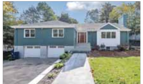
22 VFW PARKWAY WEST ROXBURY

4 beds; 2 full, 1 half baths Listed by Ultan & Caitlyn