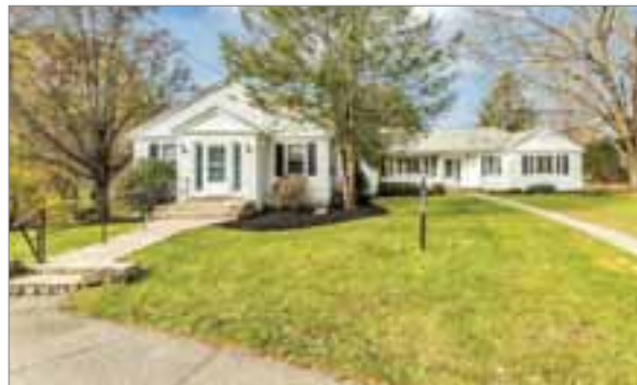
1025 HIGH STREET DEDHAM

2 beds; 2 full baths Listed by Kris & Mike