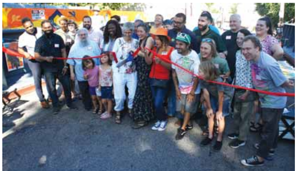
About 100 residents came out to dedicate the new murals at the Blakemore Bridge in Roslindale.