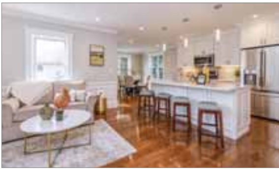
189 BEECH STREET ROSLINDALE $995,000