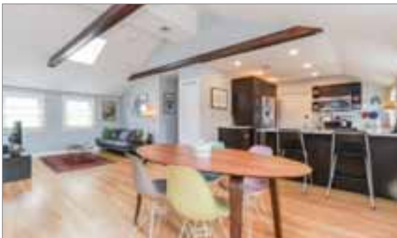
4420 WASHINGTON ST #3 ROSLINDALE $389,000