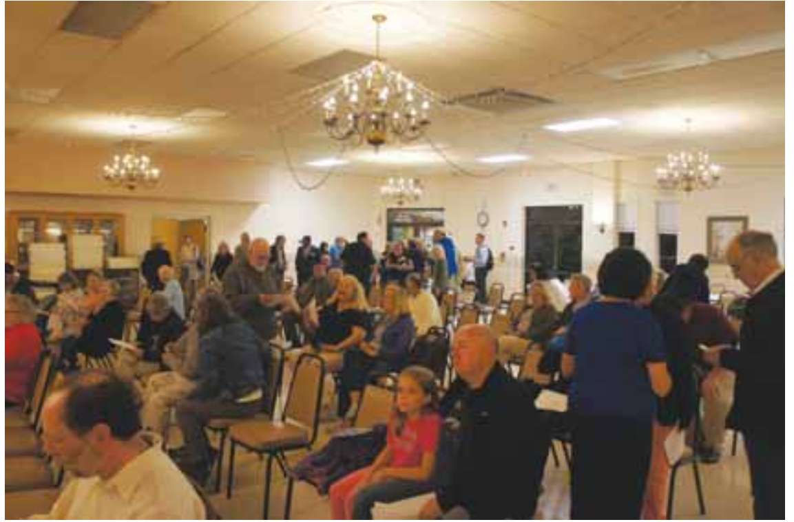
Residents were eager to hear what candidates had to say, especially on the proposed Centre Street Road Diet.

“If the school wants to be there and it’s pushing forward on this, then I think we should say ‘hey, have the charter school but have it on a set of mutually-agreed-to values,” he said, asking that if the school goes in, have Roxbury Prep put its Charter up for collateral to ensure cooperation with residents. “I think if we raise the stakes it makes everyone a better actor.”