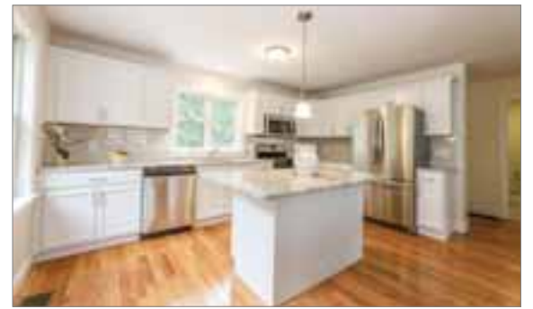
46 WOODLEY AVE WEST ROXBURY $749,900