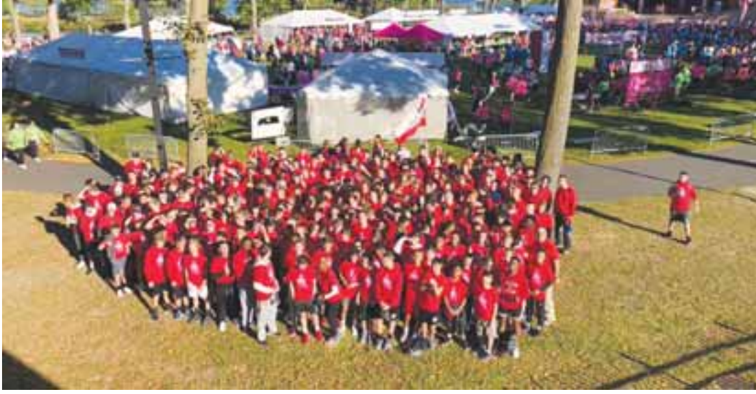
Thousands of residents came out on Sunday for the annual Making Strides Against Breast Cancer Walk/Run fundraiser. This year, thousands came together to kick off their own annual fundraisers for breast cancer research and treatment. For more info, go to https://bit.ly/2ogZROF