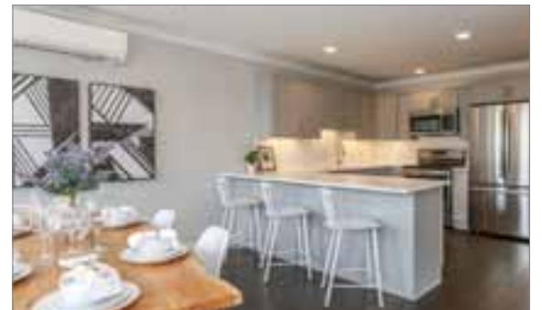
1789 CENTRE STREET WEST ROXBURY FROM $649,000