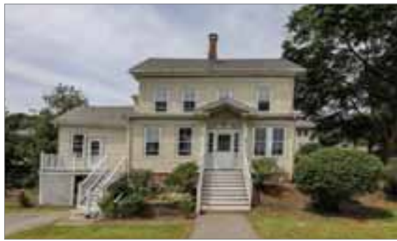
3 EMELIA TERRACE WEST ROXBURY $599,000