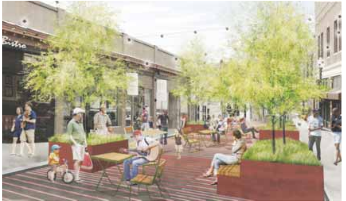
Rendering of the proposed Birch Street Plaza.