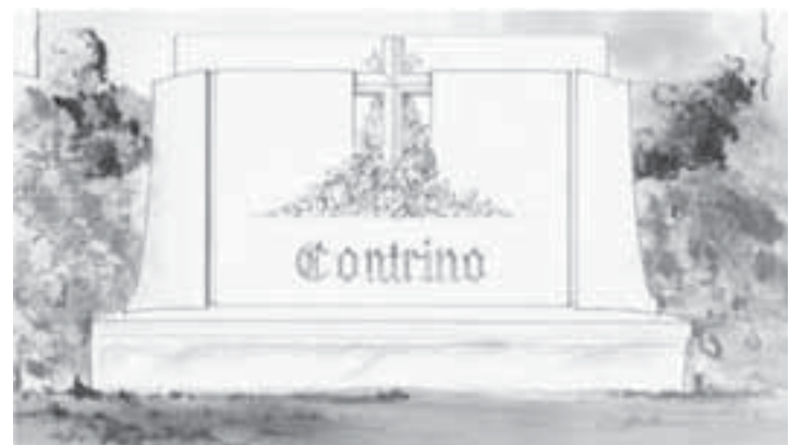
A CENTURY OF SERVICE TO THE COMMUNITY