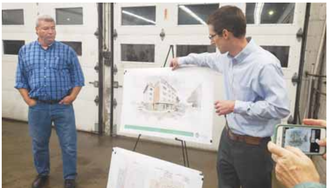
The 32 units would have 19 parking spaces and no open space, along with several variances.