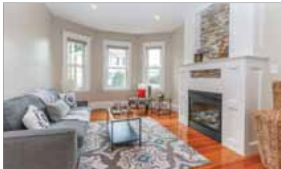
20 MONTVALE ST #2 ROSLINDALE $429,000