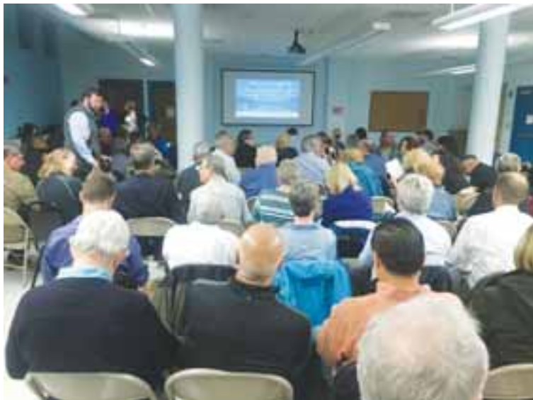
Residents were most concerned that the plan would take parking spaces away from Roslindale Square.