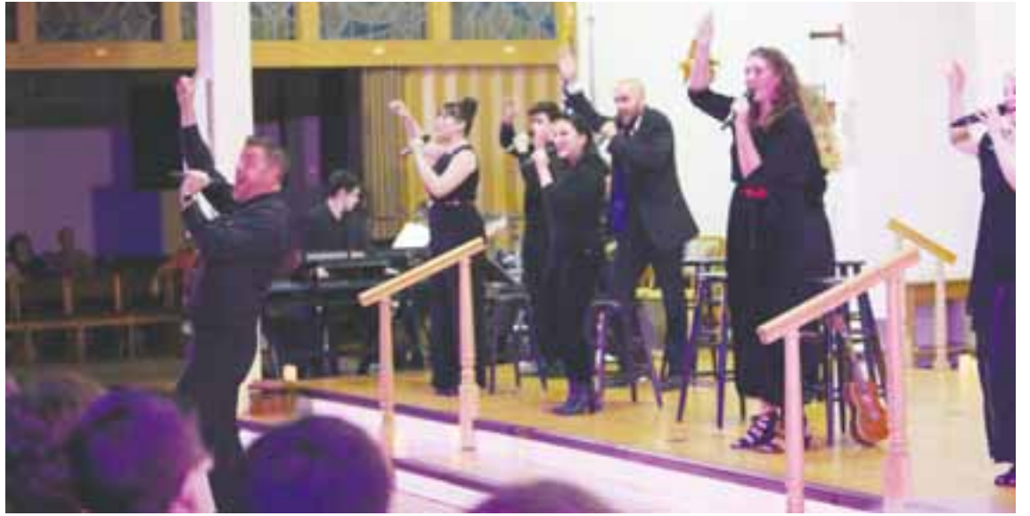
Riverside Theater Works hosted a revival of the classic 1971 musical Godspell for the 100th anniversary of the St. Anne's Parish.