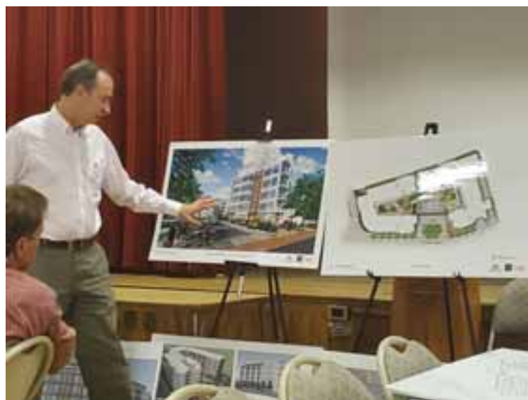
Residents at the IAG meeting last week said they liked the changes, but still had problems with the overall massing of the project.