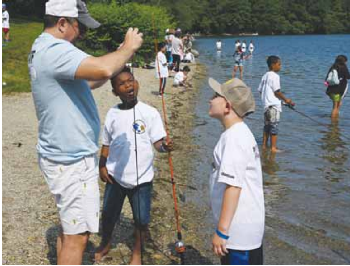
The Jamaica Pond was awash with anglers last weekend as the annual derby got underway. Hundreds vied for the elusive Golden Trout.