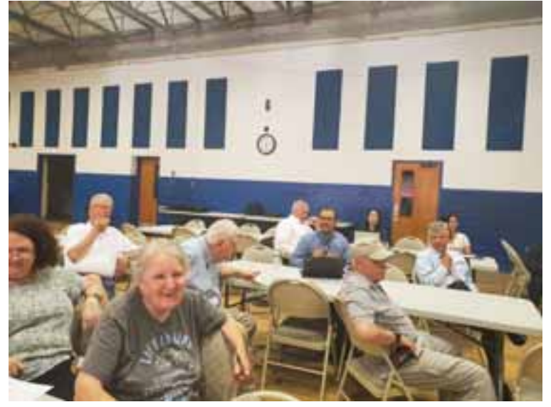
Residents debated the densification of Hyde Park and whether it would improve the neighborhood or be a detriment.

Within the buildings are a courtyard at the entrance and a lower courtyard for a pool and resident amenities. Doherty said the wall will be taken down and replaced at a better position to create an up-to-standard sidewalk for persons with disabilities and comply with the city’s Complete Streets program. Doherty also said portions of the WPA Wall that will not fit into the reconstruction will be used in that