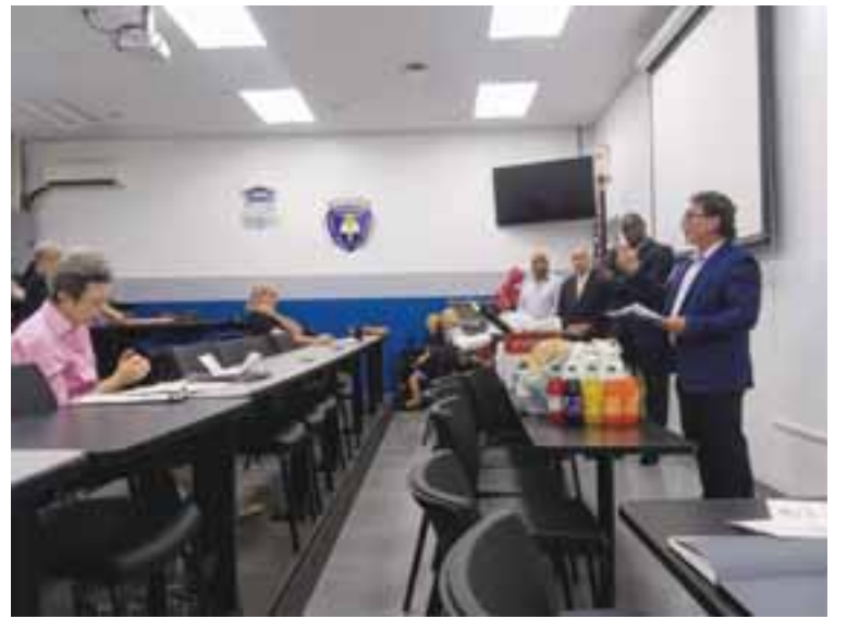
Harvest representatives went over the proposed plan for the dispensary at the FHNA last week.

Employees will have a background check. However, people with minor offenses including possession of marijuana are encouraged to apply