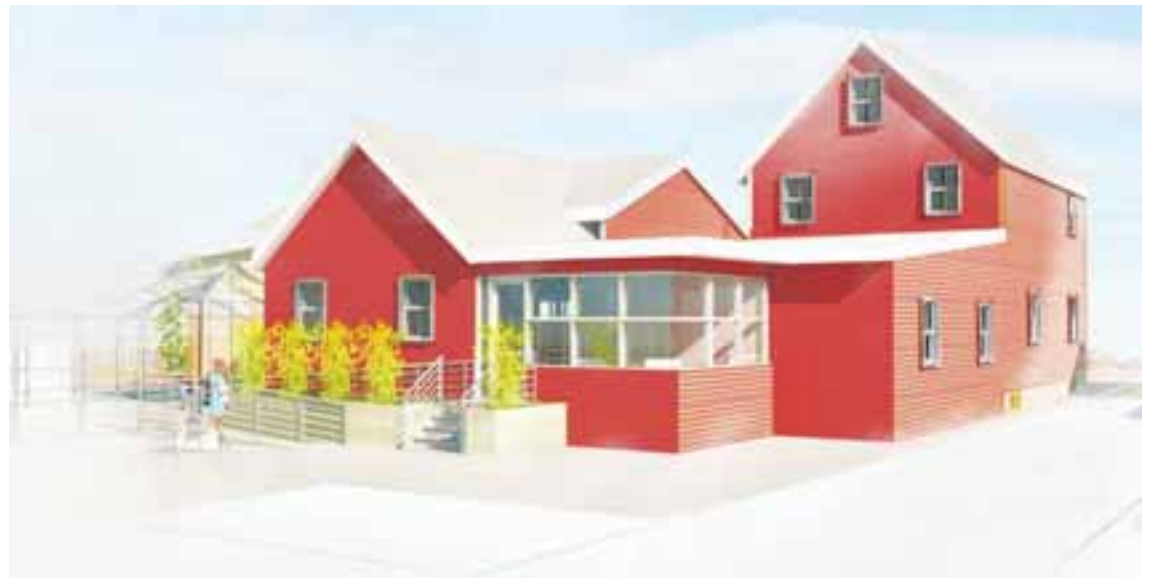
The dispensary replacing the current florist shop would have a small greenhouse for training prospective growers on how to do it right.