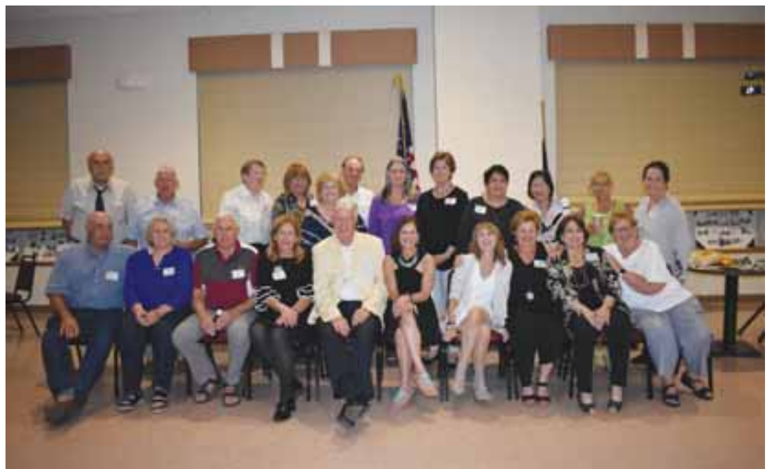
Members of the Roslindale High School Class of 1969 get together for a 50th reunion picture on Saturday, June 22 at the WR Elks Club and had a great time remembering their days at dear old 'Rossi'.