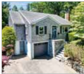
15 NORMAN STREET MILTON

YOUR EXPERT REAL ESTATE TEAM FOR BUYING OR SELLING IN AND AROUND THE BOSTON AREA!