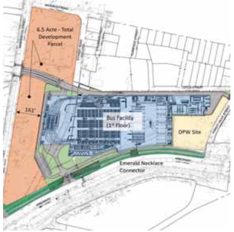
The plan of the proposed Arborway bus garage showing DPW yard and 6.5-acre development parcel.