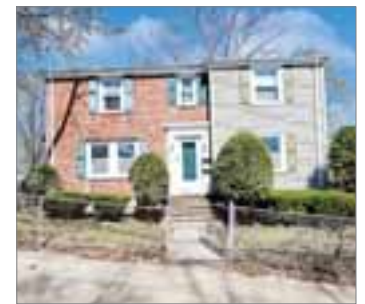
7 GREW HILL ROAD ROSLINDALE

CONDO $825,000 1 bed; 1 full, 1 half baths Listed by Kris & Mike