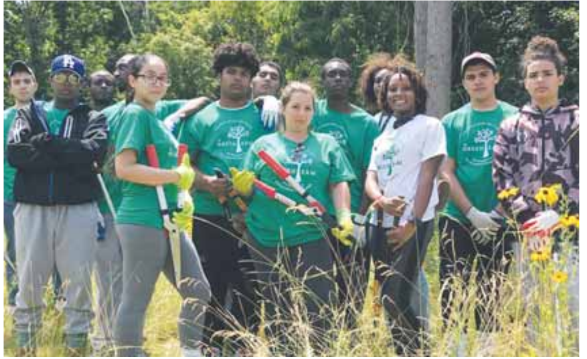
The SWBCDC Green Team gets kids involved in their local neighborhood with litter pickups and beautification projects, and many times that had been the spark that has led to lifelong community involvement.

"It taught me how important community organizing is in bringing about change, because as a crew member on the Green Team in high school we did a lot of door knocking throughout Hyde Park, kind of like informal canvassing, talking to neighbors and finding out what they wanted