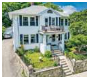
11 CLIFTONDALE ST. U:2 ROSLINDALE

CONDO $449,000 2 beds; 1 full bath Listed by Michael Hunt