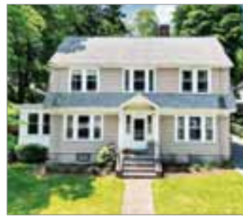
130 COREY STREET WEST ROXBURY

SINGLE FAMILY $879,900 4 beds; 2 full baths Listed by Ultan & Caitlyn