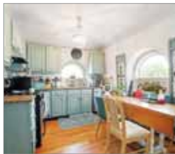
95 WARREN AVE U:3 HYDE PARK

SINGLE FAMILY $1,650,000 4 beds; 2 full, 1 half baths Listed by Kris MacDonald