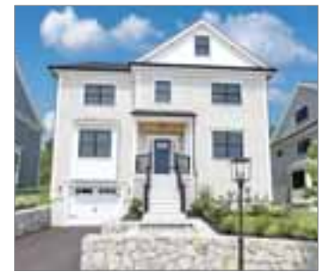
5 STARLING STREET WEST ROXBURY

SINGLE FAMILY $949,000 3 beds; 2 full, 1 half baths Listed by Kris MacDonald