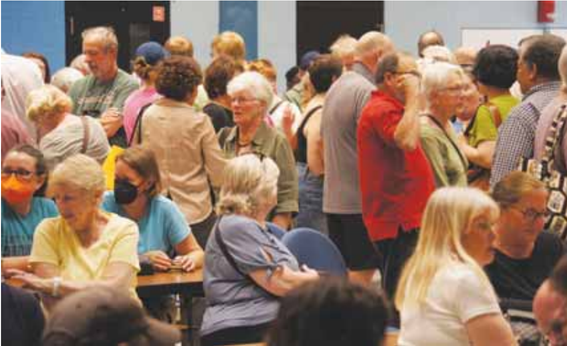
Hundreds came out to the Ohrenberger on Wednesday to hear from the city on its plan to reduce lanes on Centre Street and add other safety features.