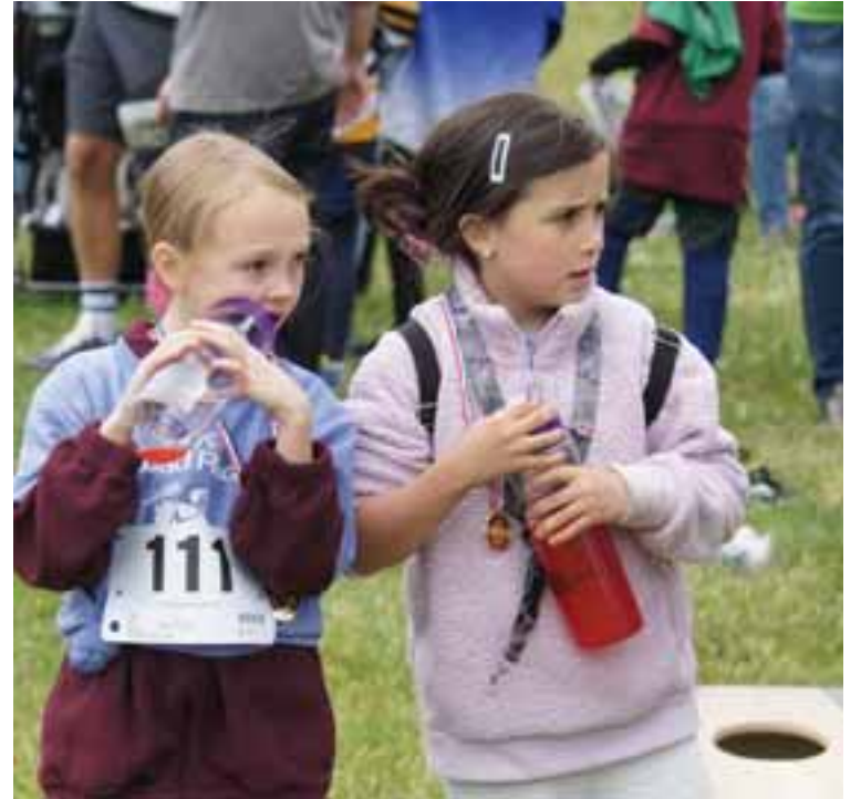
Thousands braved the rain on Sunday to support the Corrib Charitable Trust in West Roxbury.