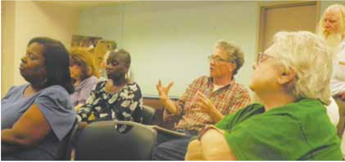
Residents heard the plan for 1081 River St. at the HPNA recently and were not happy to see the zoning relief it might need.