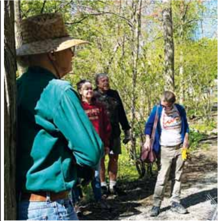
Residents came out to cleanup the wetlands and take a look at what spring has brought to the public park area.

For more information on the proposed mixed use project at 76 Ashford St., visit www.bostonplans.org/projects/development-projects/76-ashford-street .