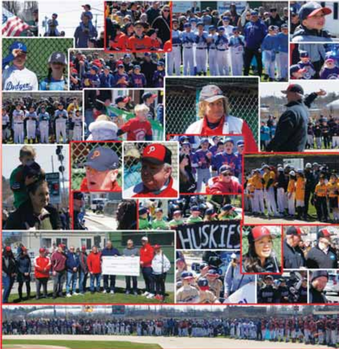
Thousands came out to open the season for the Parkway Little League and raise funds for the rehabilitation of Bunker Field off Baker Street.