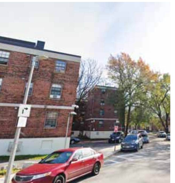
The City Council will be taking stock of the Boston Housing Authority's buildings in the coming months after a death at the McCormack complex in South Boston.