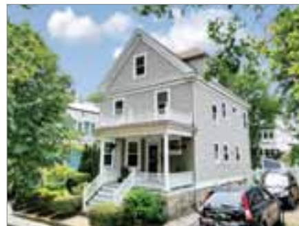
22 MENDUM STREET ROSLINDALE

SINGLE FAMILY 4 beds; 2 full baths $879,900 Listed by Ultan and Caitlyn