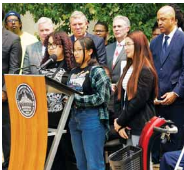
About 80 residents, teachers, officials and alumni came out to the site of the O'Bryant School for the announcement of its move.