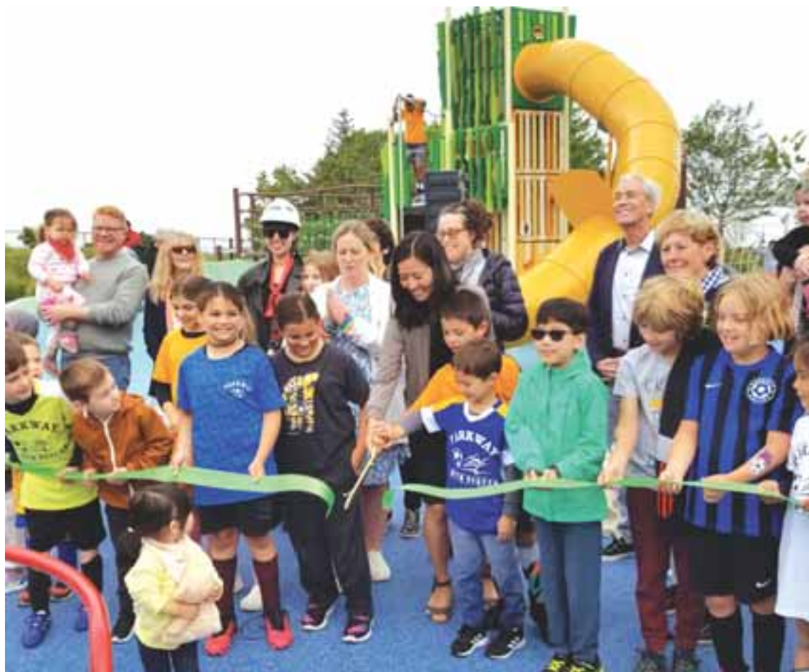
Dozens of residents came out to celebrate the official opening of the Alice Hennessey Playground in West Roxbury last Saturday.