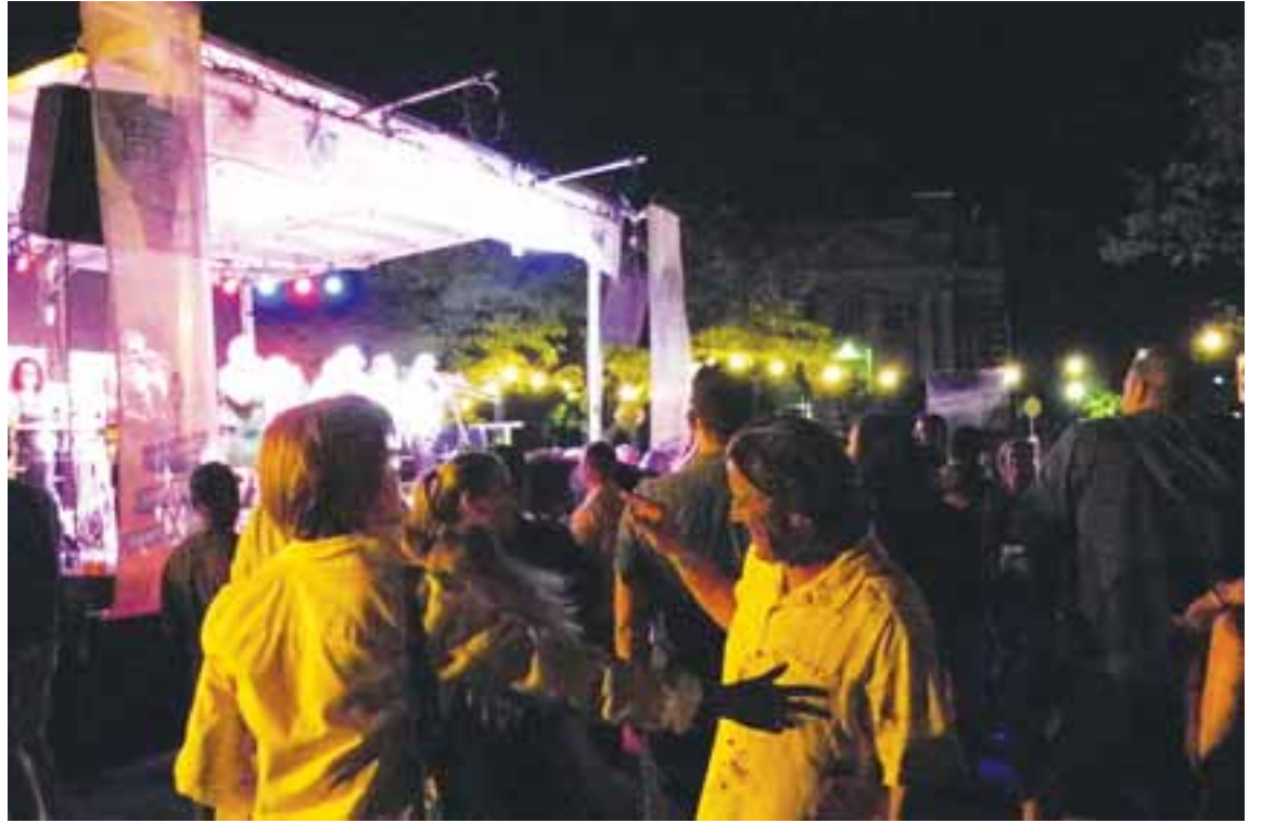
Residents will be recreating the Hyde Park Street Festival from the 150th anniversary of Hyde Park, and organizers say they want to make it an annual event.

2030 Centre Street, West Roxbury, MA 617-469-4177 • WWW.CORRIBPUB.COM