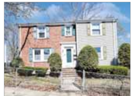
7 GREW HILL ROAD ROSLINDALE

CONDO 3 beds; 2 full, 1 half baths $925,000 Listed by Kris MacDonald