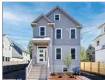
48 WYVERN STREET U:1 ROSLINDALE

CONDO 1 bed; 1 full, 1 half baths $825,000 Listed by Mike & Kris