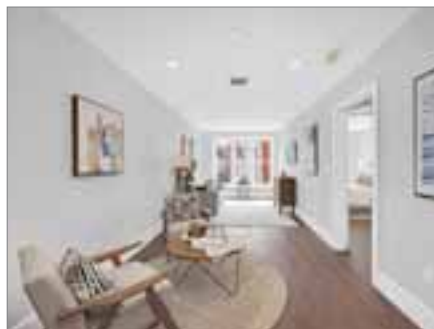
480 WEST BROADWAY U:102 SOUTH BOSTON

CONDO 2 beds; 2 full baths $625,000 Listed by Mike & Kris