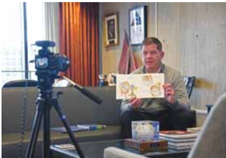
Boston Mayor Marty Walsh read for the storytime segment as well.