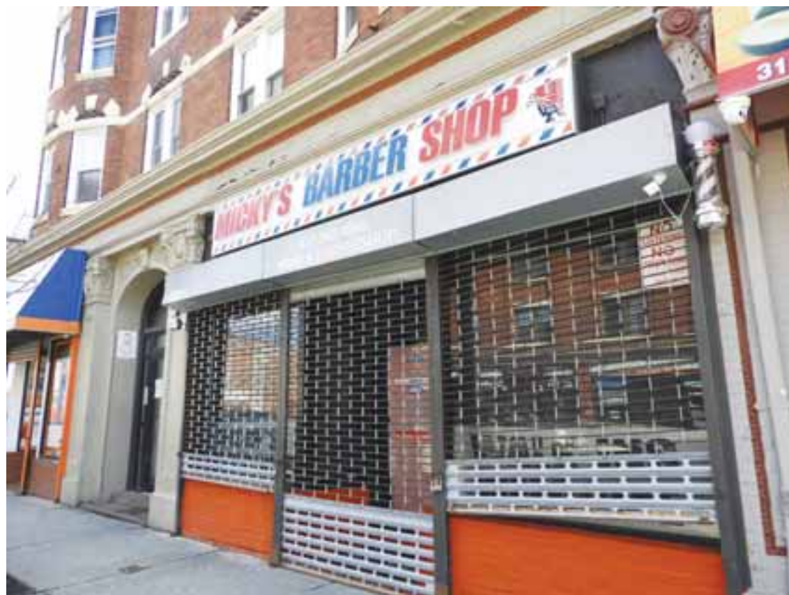
The usually busy Micky's Barbershop is closed on Saturday afternoon, like many businesses along Egleston Square.

Among the hardest hit are the four barbershops, three beauty salons and two nail shops that