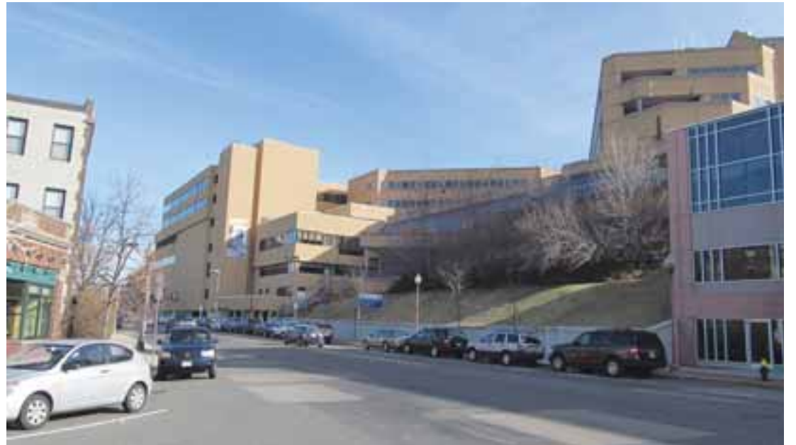
Any Steward worker who joined their local union will be safe at St. Elizabeth's from losing their 401(k) matched contributions.