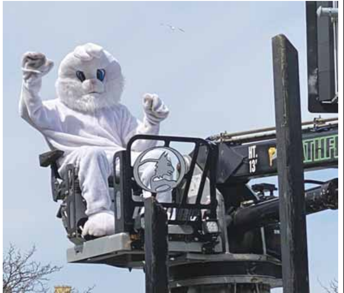
The Boston Fire Department and the Boston Police Department joined Pathfinder Tree Service on Sunday to bring the Easter Bunny down Broadway in South Boston. The event was part of a socially distant Easter Celebration for the city and the neighborhood.