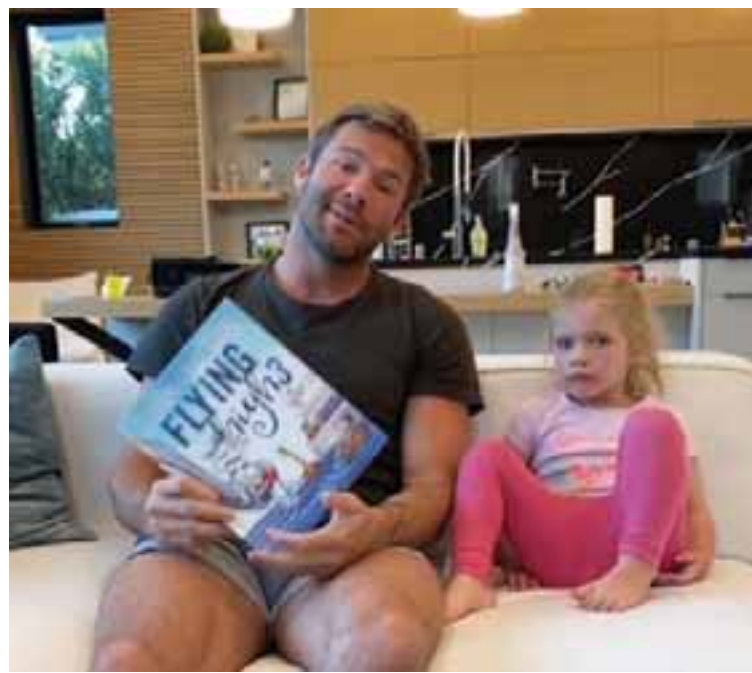
New England Patriots star Julian Edelman read Flying High for his Scholar Storytime segment on BNN, a book he also wrote.

“I mean there are kids who are, possibly, taking the SAT’s in a couple of weeks and they’re getting help live on BNN for those tests,” he said.