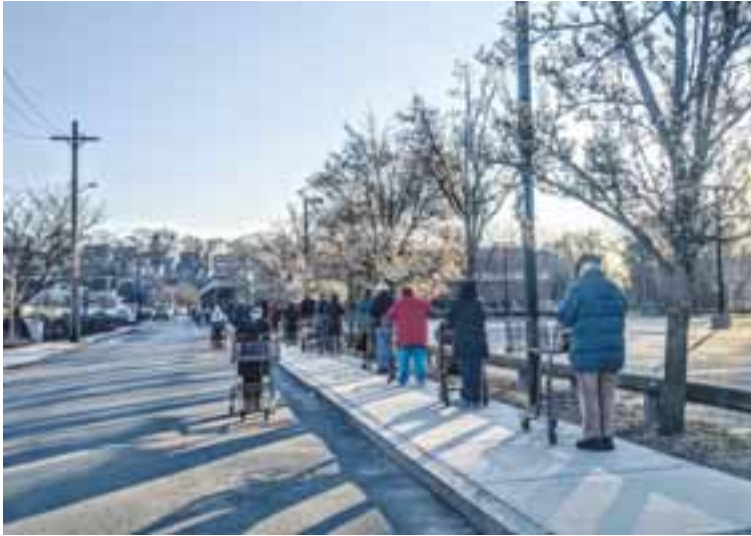
Residents of West Roxbury have to line up almost to the United States Post Office to properly social distance themselves and shop for groceries.