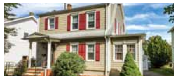
107 GREATON ROAD WEST ROXBURY $749,900 Listed by Sue Brideau