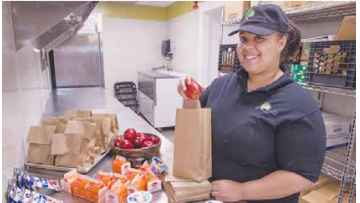
The Essence of Thyme will be prepping more meals for schools and local organizations at their now larger location on Hyde Park Avenue.