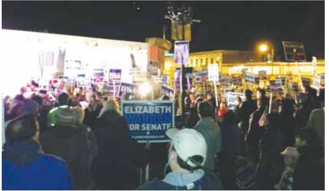
In 2012, the Truman Rally was attended by hundreds of residents from all over the city at the Hastings Street Parking Lot in West Roxbury.