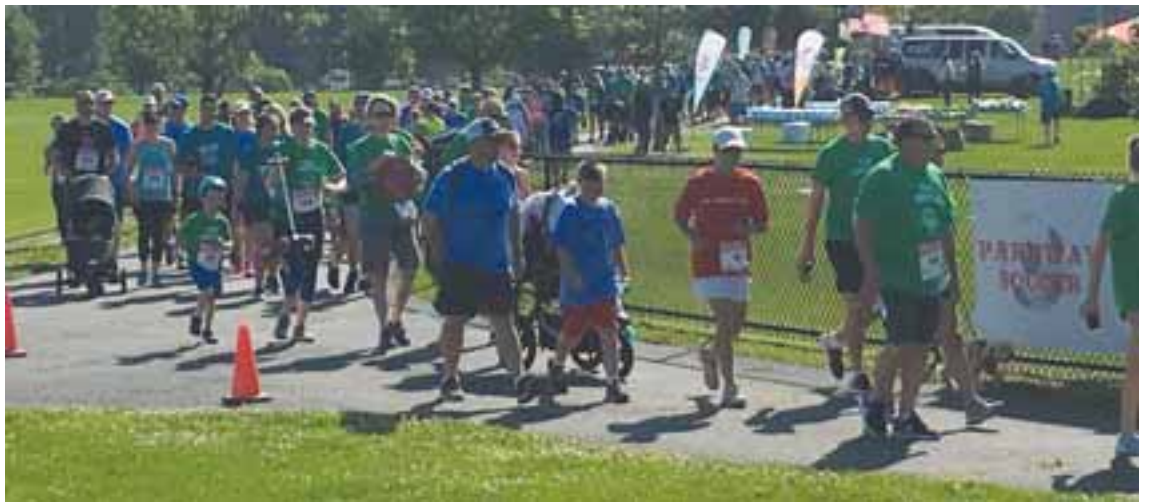
Hundreds came out for the race in West Roxbury. Luckily the weather was cooperative.