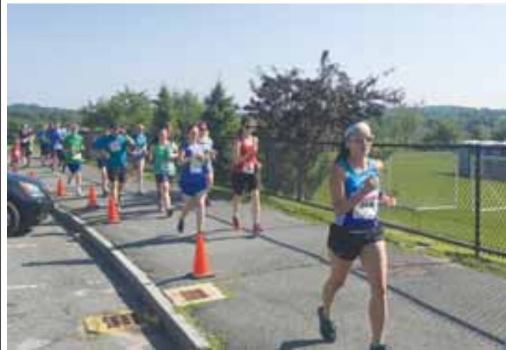
The race was held to raise money for medical programs at the Franciscan Hospital in Brighton.