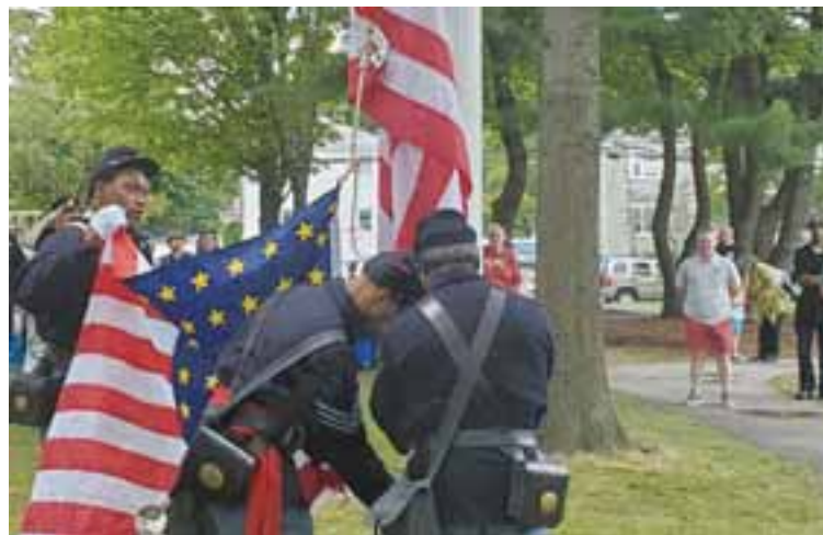
Members of the 54th added the Civil War-era flag on Saturday as part of a rededication to the park and to honor those who trained there.