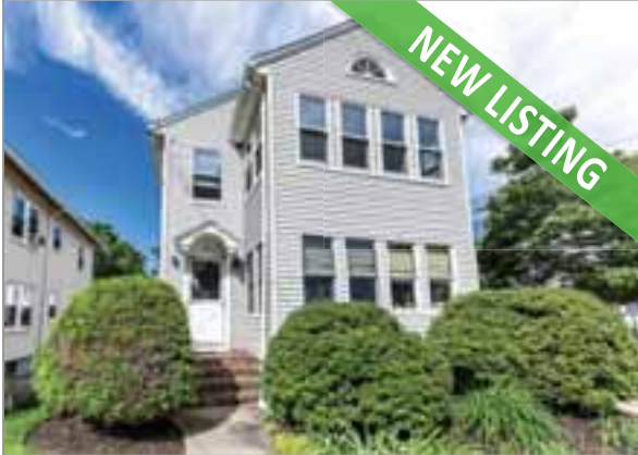
64 WELLSMERE ROAD ROSLINDALE $449,000