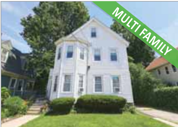
87 HEWLETT STREET ROSLINDALE $849,000