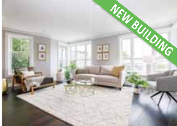
1789 CENTRE STREET WEST ROXBURY FROM $699,000