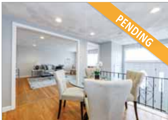
62 LODGEHILL ROAD HYDE PARK $469,000