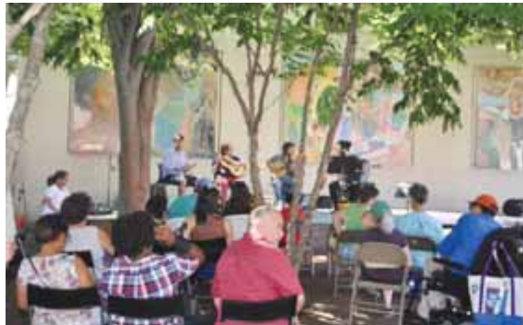
Porch Fest Concert at the Peace Garden in July 2018