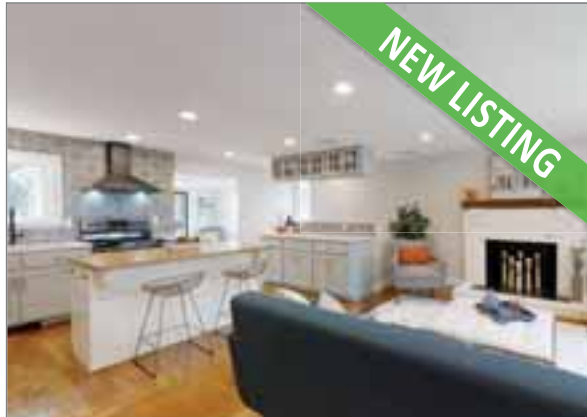
107 LAURIE AVENUE WEST ROXBURY $659,000