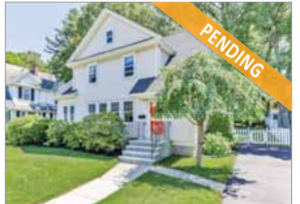
30 GLENBURNIE ROAD WEST ROXBURY $749,000