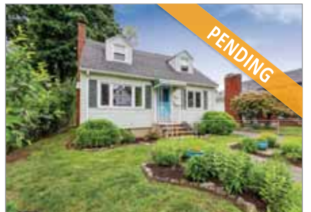
14 CLEVELAND STREET 2 HYDE PARK $449,000