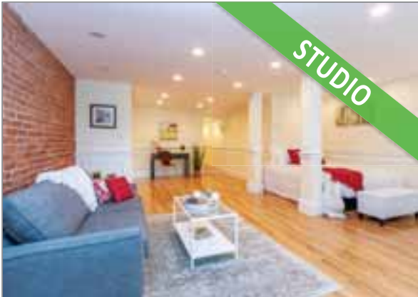
382 RIVERWAY MISSION HILL $389,000