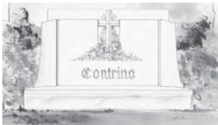
A CENTURY OF SERVICE TO THE COMMUNITY