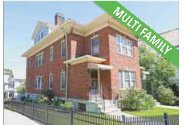
90-92 WALTER STREET ROSLINDALE $849,000