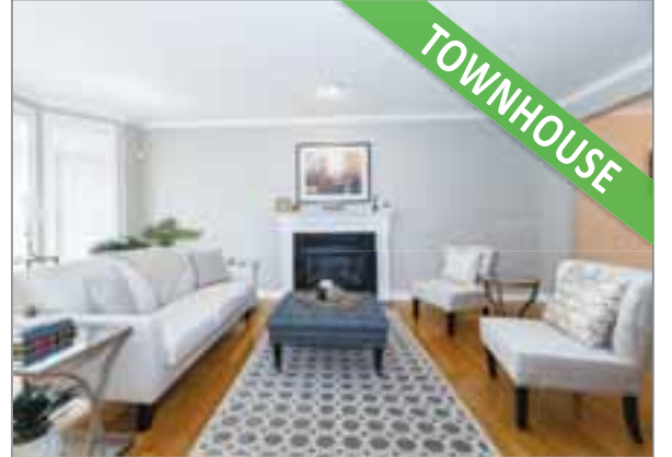
947 LAGRANGE STREET WEST ROXBURY $749,900