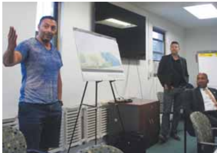
Residents said they were concerned about how the work would affect the Canterbury Brook.