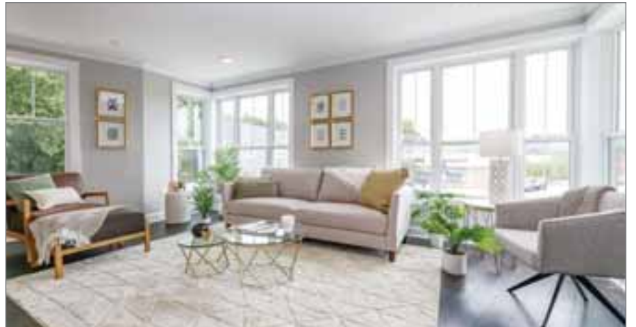
1789 CENTRE STREET, WEST ROXBURY