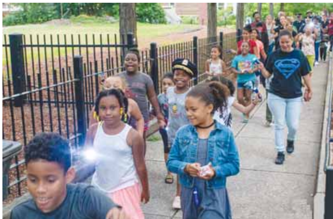
On Thursday, July 18, officers from District E-13 in Jamaica Plain, the Bureau of Community Engagement, and the Command Staff joined Jamaica Plain residents for a Flashlight Walk near the Mildred C. Hailey Apartments. The walk wrapped up at Jackson Square Park, where participants visited the Score4More barbecue and enjoyed food, music, and dancing. Boston Police Department officers said they had a great time meeting and connecting with so many concerned and compassionate community members. To attend a future Flashlight Walk, please call the BPD at (617) 343-4345 or send an email to: meetinginfo@pd.boston.gov .