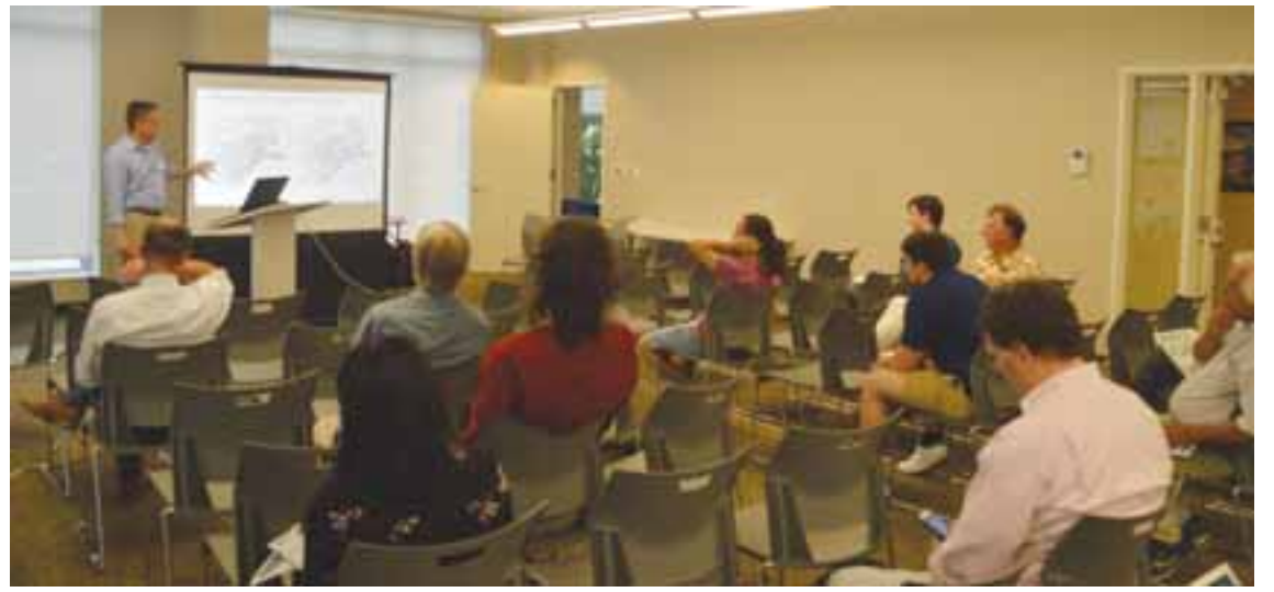
Residents said one of their major concerns was illegal cut-through traffic on one-way streets, as well as pedestrian and bicycle safety concerns.

“So basically people made comments about motor vehicle issues, they made comments about the price of transportation, pedestrians, and then what we did was combine all of those heat maps and began to see where they came together,” Read said. “And then you can see the intersections: The intersection of Harvard and Comm’ Ave, the intersection of Cambridge Street and Harvard Street, and certain areas, not surprisingly light up. And the public comments we