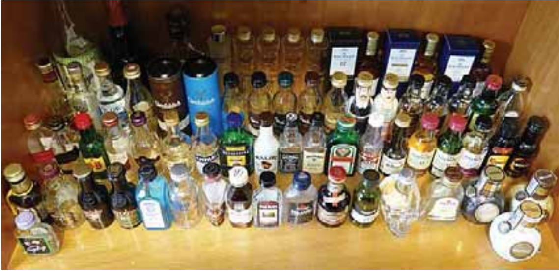
The council is looking at how it cut down on single serving alcohol bottle litter in the city.