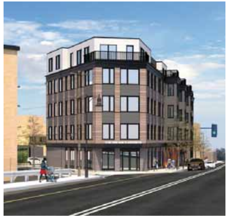
The current doctor's office is planned for apartments above, and developers now propose to take over the adjacent mechanic shop.