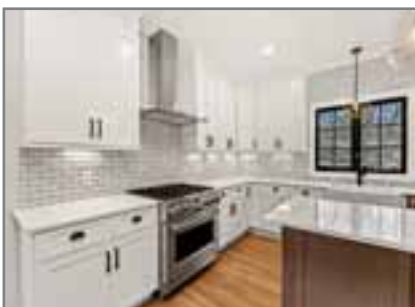
3 STARLING ST, WEST ROXBURY

Single Family 4 beds, 2 full, 1 half baths $1,545,000 Listed by Steven Musto