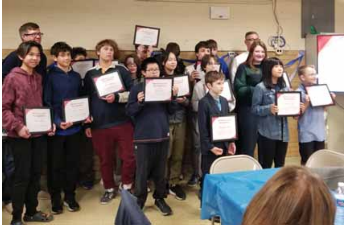
The Joyce Kilmer celebrated students recently, including these kids who scored a 530 or higher in either the English or math section of the test.