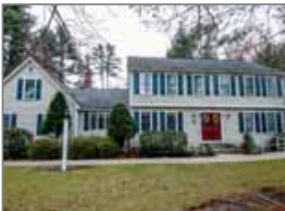
124 BOARDMAN, NORFOLK

YOUR EXPERT REAL ESTATE TEAM FOR BUYING OR SELLING IN AND AROUND THE BOSTON AREA!