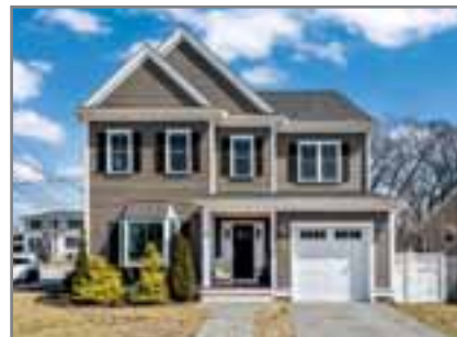
2 NORTHDAL TERRACE, W. ROXBURY

Single Family 4 beds, 2 full, 1 half baths $1,229,000 Listed by Steven Musto