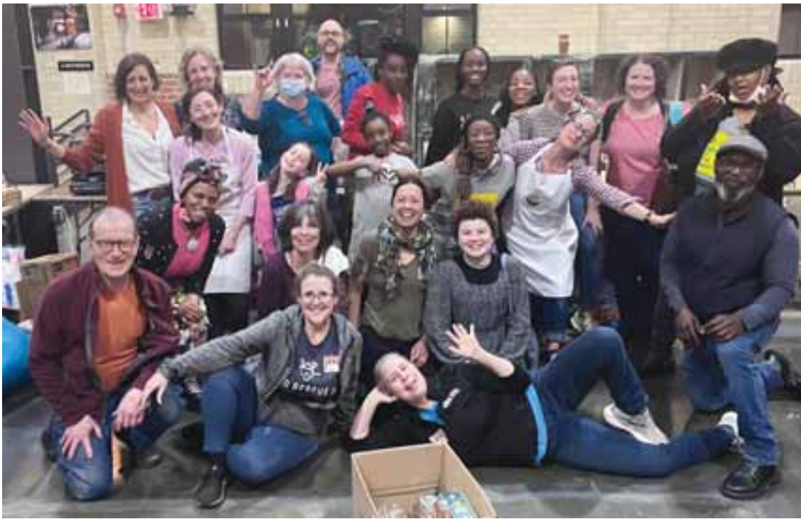
Hundreds of residents came out to support the Empty Bowls Fundraiser at the Roslindale Substation.