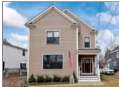
29 PAINE STREET, ROSLINDALE

Single Family 4 beds, 3 full, 1 half baths $879,000 Listed by Helen Gaughran