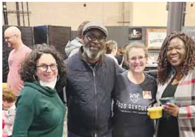
The fundraiser is designed to raise funds for food for those in need.

Proceeds from the event support the Neighborhood Food Action Collaborative (NFAC) of Roslindale and Hyde Park: Food Access Volunteers of Roslindale (FAVOR), the Roslindale Food Collective