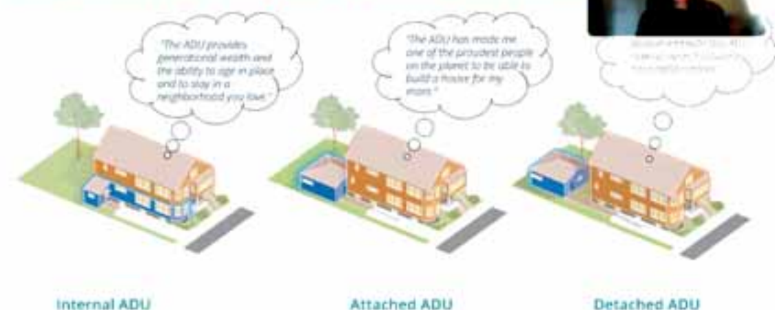
The city outlined the different types of ADUs, also known as "in-law apartments" that the new regulations could allow.