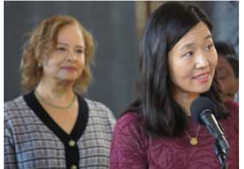
Boston Mayor Michelle Wu announced the funding from varied sources at the Roslindale Substation on Thursday.