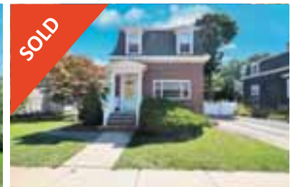
1036 River St, Hyde Park