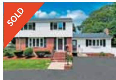
10 Warren Park, Hyde Park