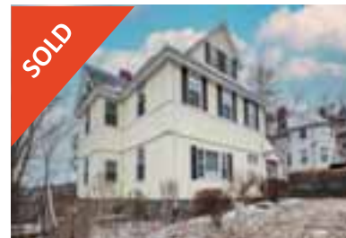
38 Beacon St, Hyde Park