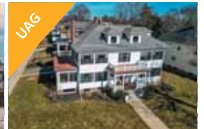
184 Bellevue St, West Roxbury