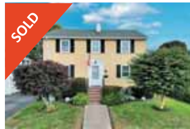
21 Danny Rd, Hyde Park