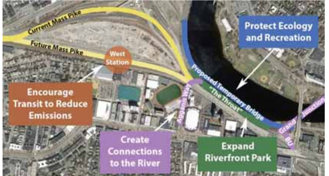
The ACA discussed the plan for the railyard, pictured here just north of the planned site for West Station.