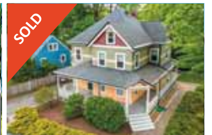
9 Spring Hill Rd, Hyde Park