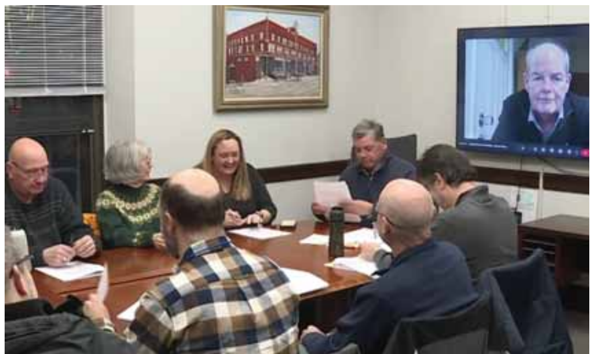
The Capital Outlay Committee also looked at projects already approved in the pipeline.