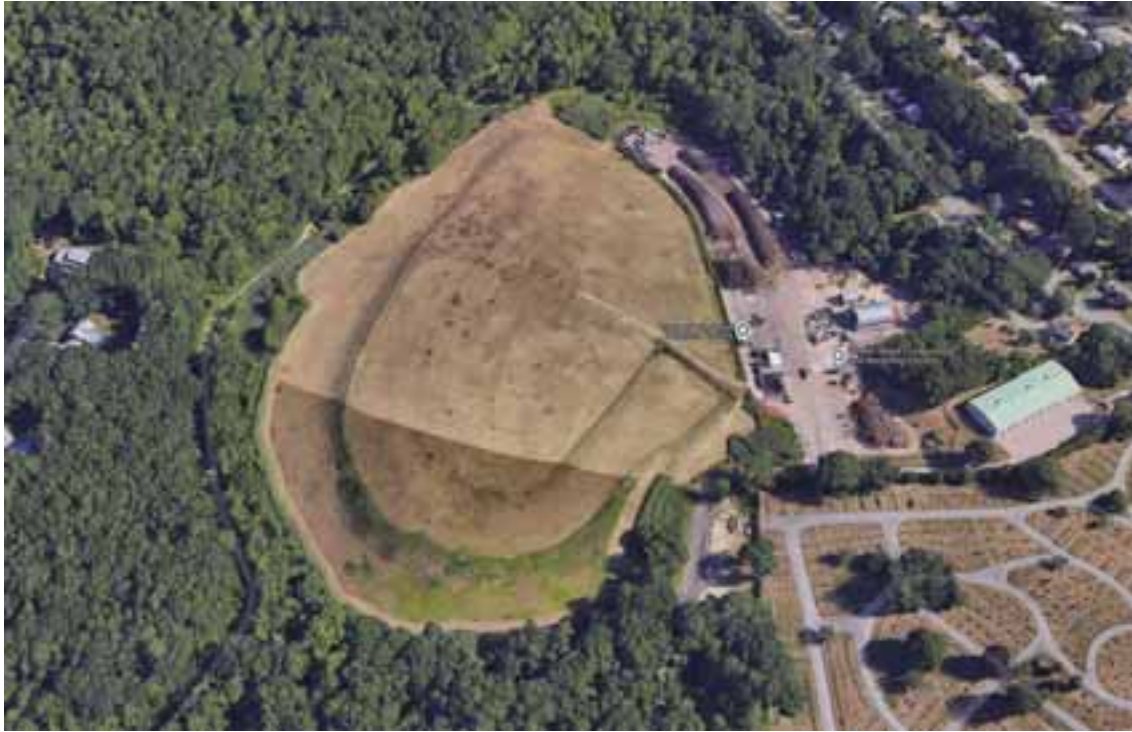
The proponent for the solar facility at the capped landfill adjacent to Highland Cemetery said the project is currently, "in peril."