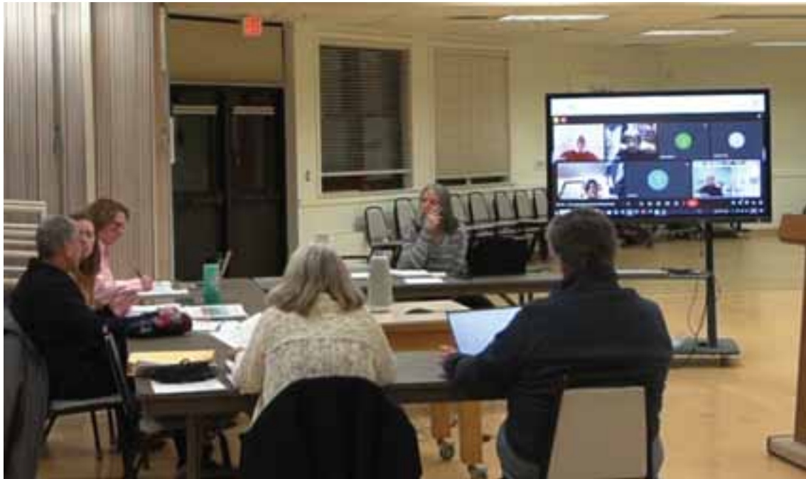
The Community Preservation Committee met recently and voted to recommend all submitted projects.