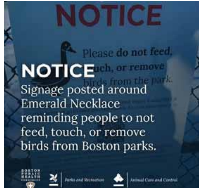
The Board of Health recently discussed concerns around Bird Flu in the state.