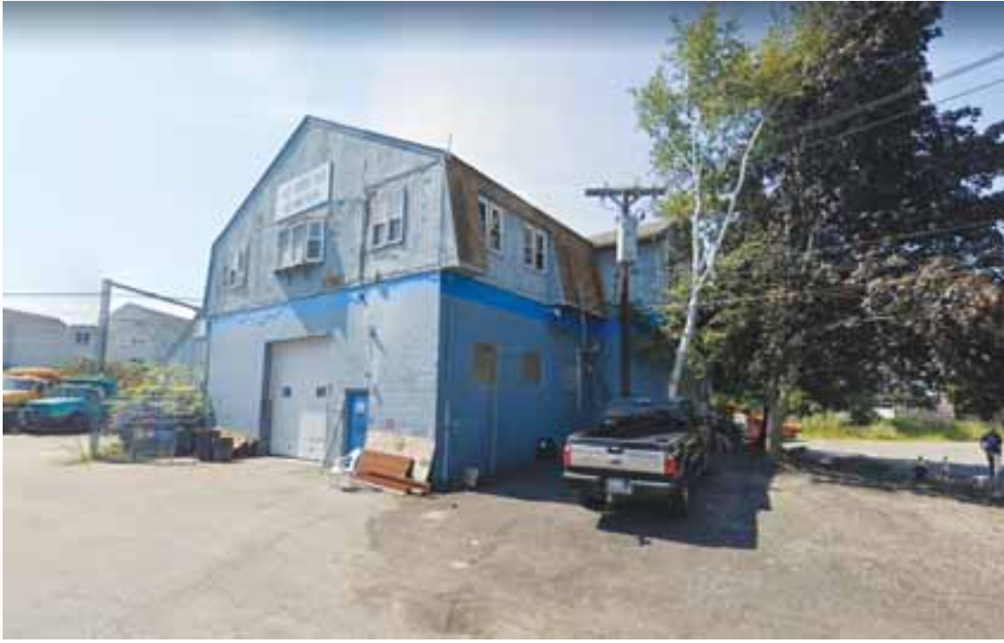
The HPNA discussed a proposal for new housing at this former taxi site near the Hyde Park Commuter Rail Station.