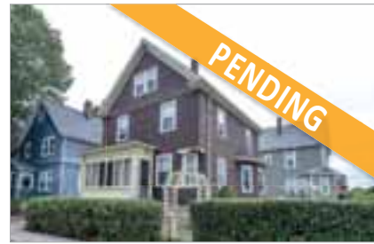
24 ROSECLIFF STREET ROSLINDALE $559,000 Listed by Dave Greenwood