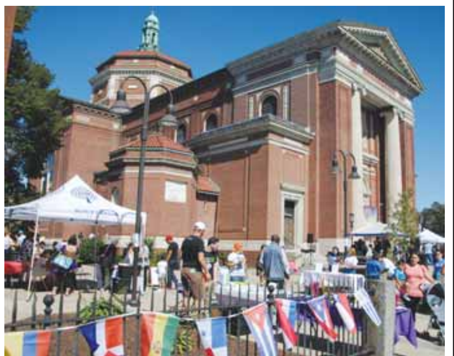
Blessed Sacrament Church during the 2019 Jamaica Plain Worlds' Fair.