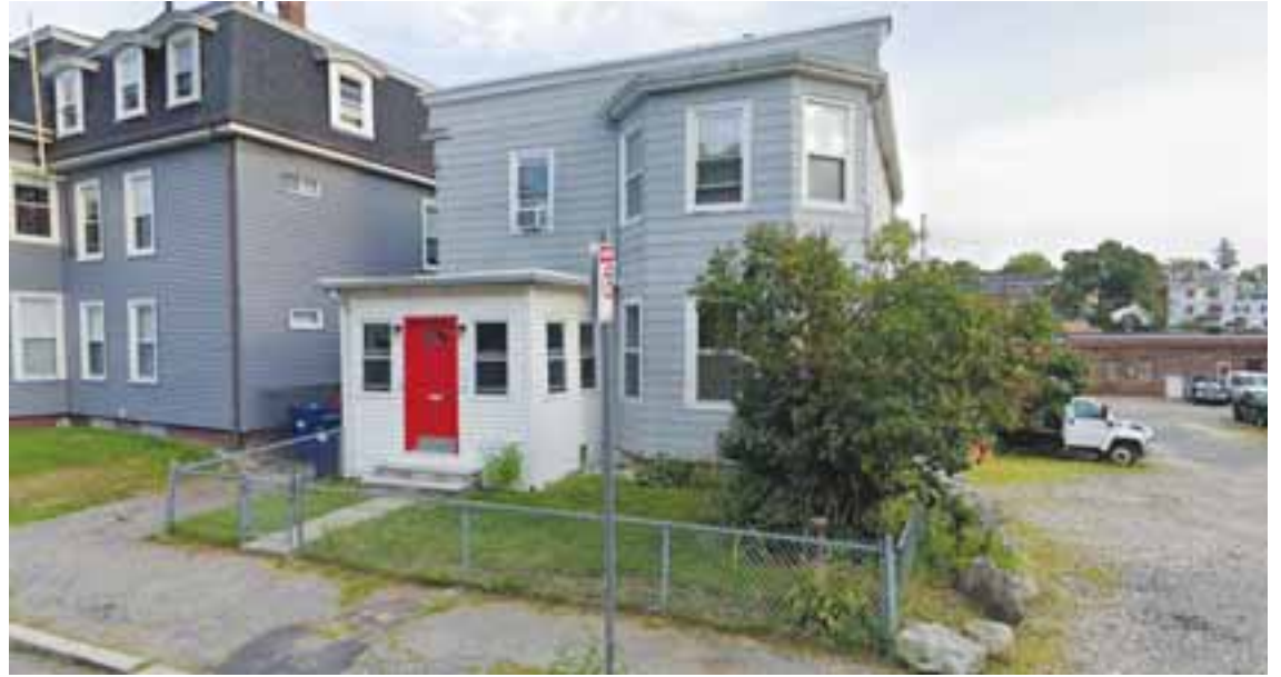
This spot at 24 Winthrop St. is also up for redevelopment.

“You want to bring 45 people in without parking because they can survive on Shaw’s or Walgreen’s?” interjected Singer during the presentation. “That’s not going to happen. They are going to bring