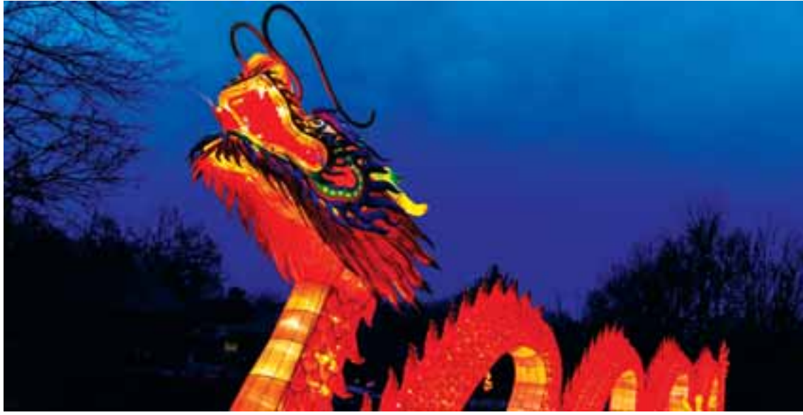
Though a dragon technically isn't a part of a biodiverse ecosystem, organizers said they want to use the light show to highlight the need for biodiversity conservation.