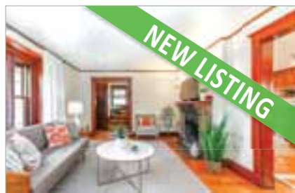
541 LAGRANGE STREET WEST ROXBURY $679,000 Listed by Lisa Sullivan