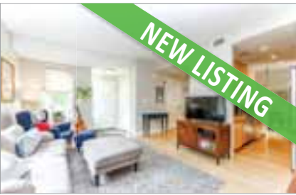
2 WEST MAIN STREET U:2 DORCHESTER $429,000 Listed by Kim & Kris