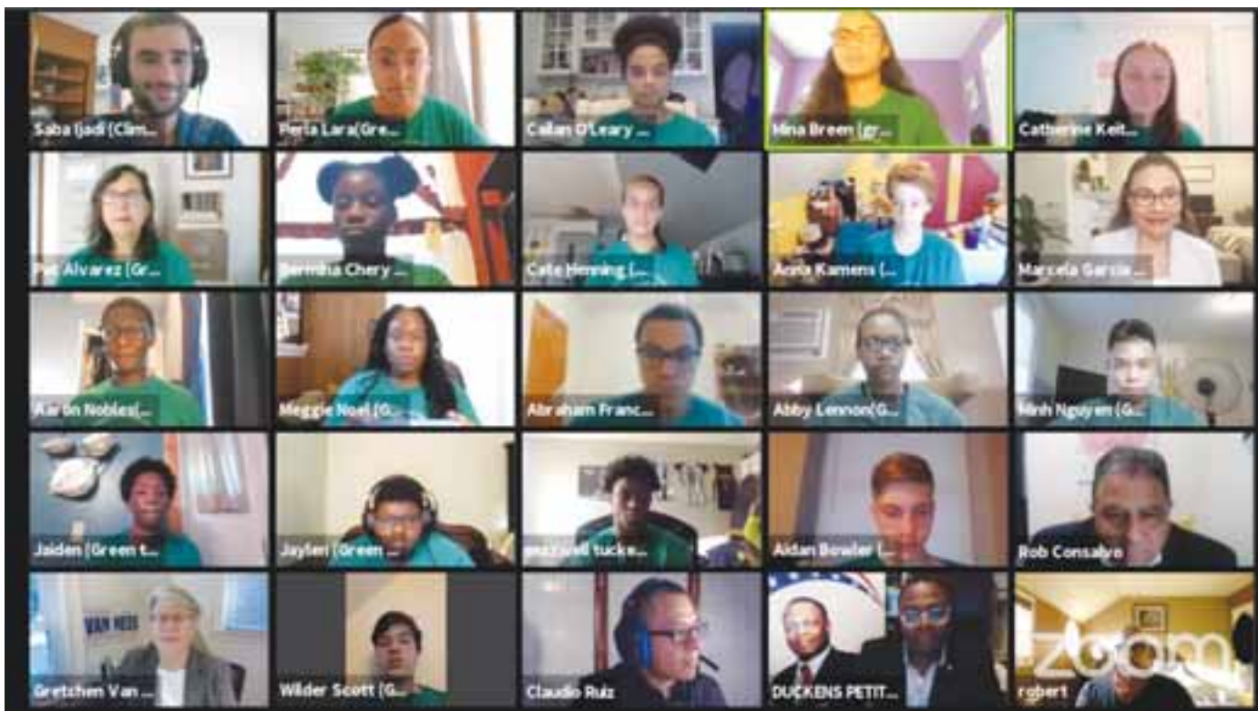
Dozens of residents and members of the Southwest Boston CDC came out virtually to here from candidates for the 14th Suffolk District last Thursday.