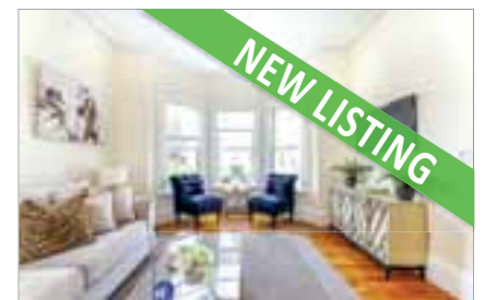
1 WARREN SQUARE JAMAICA PLAIN $1,690,000 Listed by Trudy McGuire