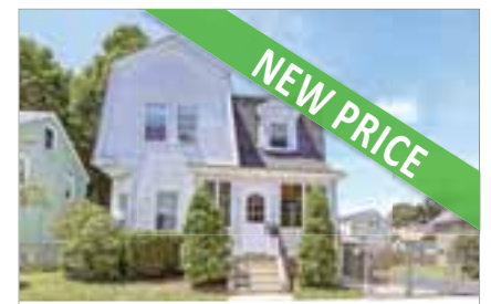
32 LASELL STREET WEST ROXBURY $739,000 Listed by Dave Greenwood