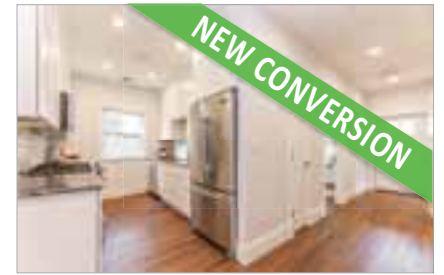
104 BROOKLEY ROAD U:1 JAMAICA PLAIN $599,000 Listed by Mike M & Sue