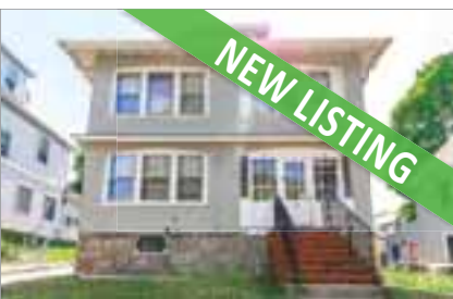
19 REXHAME STREET ROSLINDALE $789,500 Listed by Rob Grady