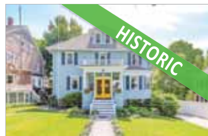
200 MOUNT VERNON STREET WEST ROXBURY $1,450,000 Listed by Lisa Sullivan