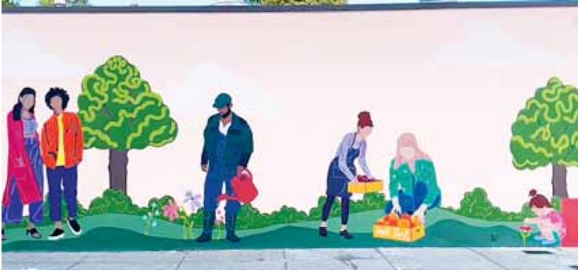
The completed mural at Viko's Pizza on River Street in Hyde Park.