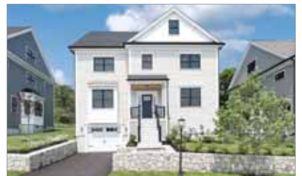
5 STARLING STREET WEST ROXBURY

3 beds; 3 full, 1 half baths Listed by Mary Forde