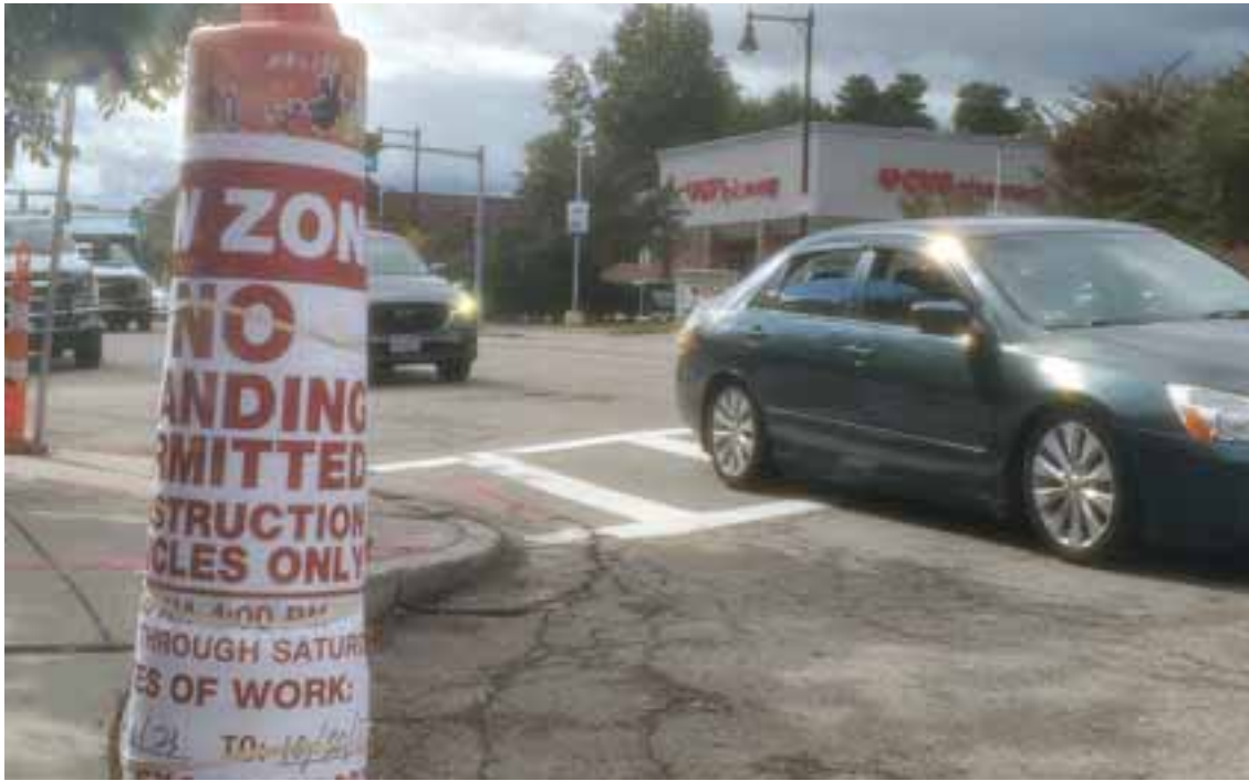
Road work has started on Centre Street in West Roxbury for the safety redesign and lane reduction of the street.