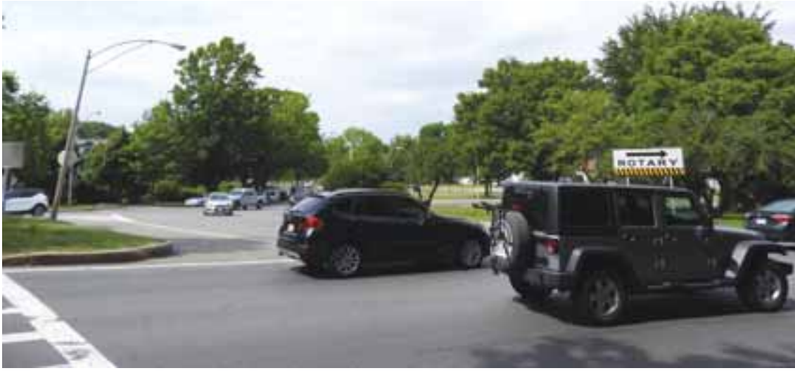
The Murray Circle rotary which DCR wants replaced with a signalized square.