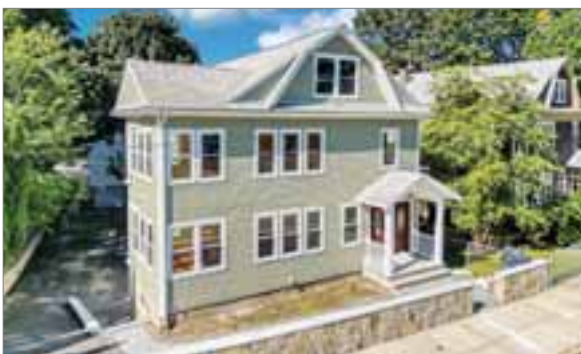
11 HERBERTSON ROAD JAMAICA PLAIN