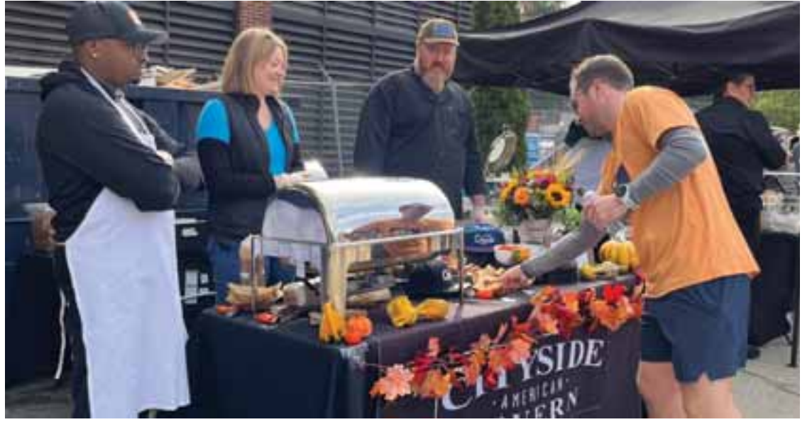
The runners were treated to a lot of food and not an inconsiderable amount of beer after the race.

This article is intended for information purposes only and does not represent legal or financial guidance. It presents the opinions and interpretations of the AMAC Foundation's staff, trained and accredited by the National Social Security Association (NSSA). NSSA and the AMAC Foundation and its staff are not affiliated with or endorsed by the Social Security Administration or any other governmental entity. To submit a question, visit our website ( amacfoundation.org/programs/social-security-advisory ) or email us at ssadvisor@amacfoundation.org .