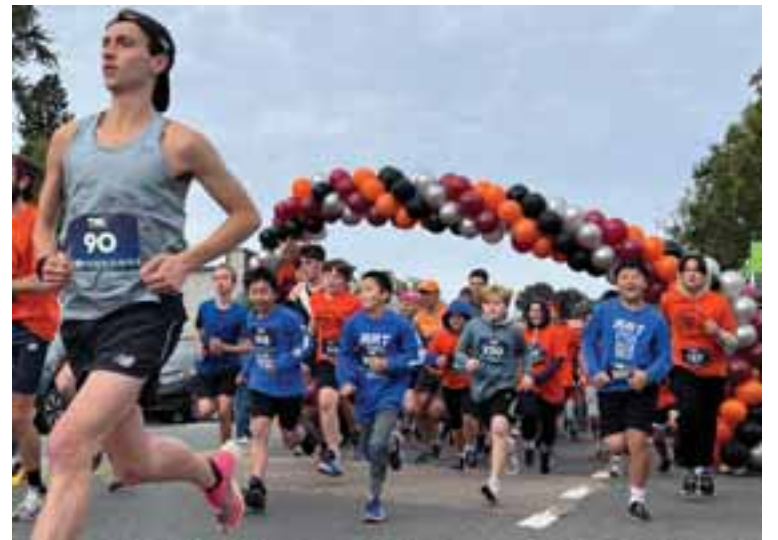
Hundreds kicked off this year's OAKtoberfest in Oak Square, Brighton.

For more information on the plan, go to https://tinyurl.com/3wee8udx