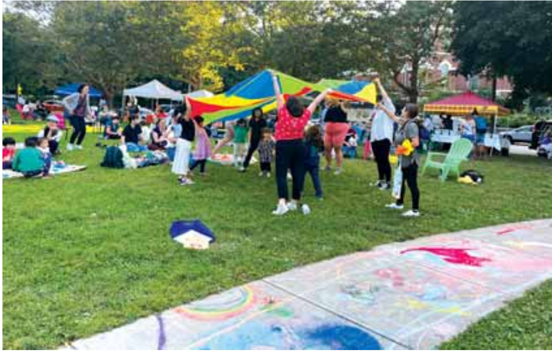
The Brighton Farmers Market is coming into the home stretch of its season this fall.