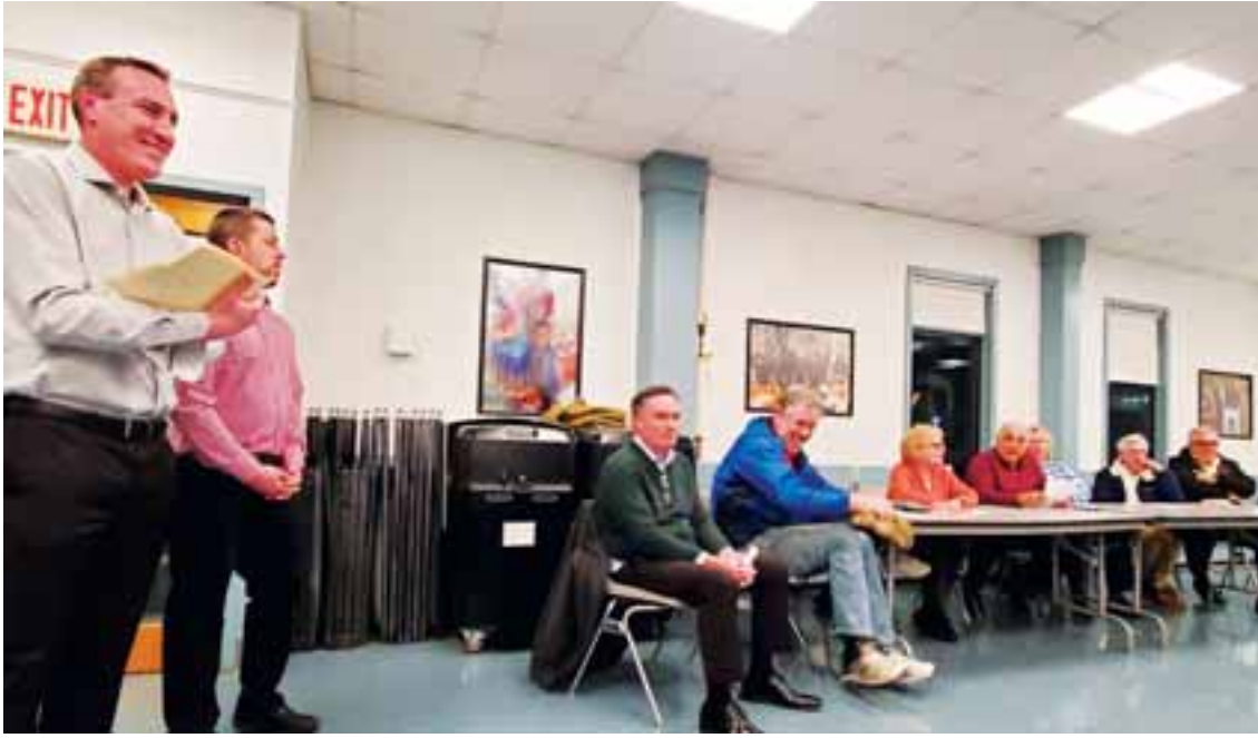
Representatives from the Boston Ale House sought and obtained a recommendation from the West Roxbury Neighborhood Council for an entertainment license.