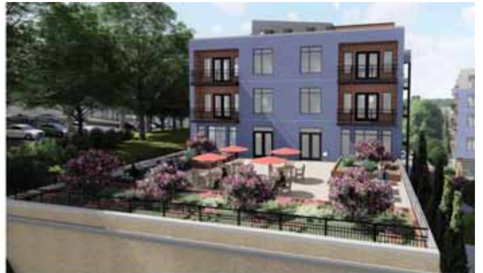
A rendering of Building B with roof deck plaza over the garage at the rear of the site. Forest Vale Apts. on the far left.