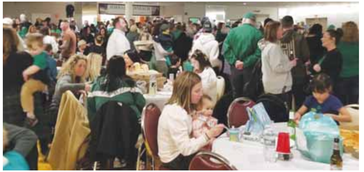
Hundreds of residents came out to celebrate St. Patrick's Day at the Irish Social Club in West Roxbury.