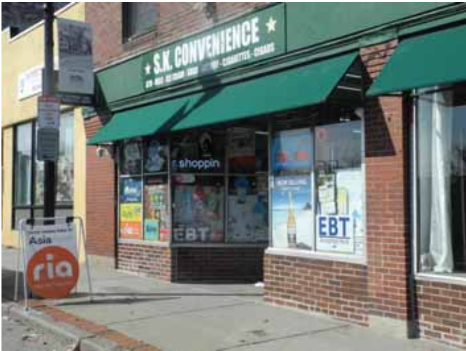
The Boston Police Department related stories of a robbery here in Hyde Park at SK Convenience on River Street.