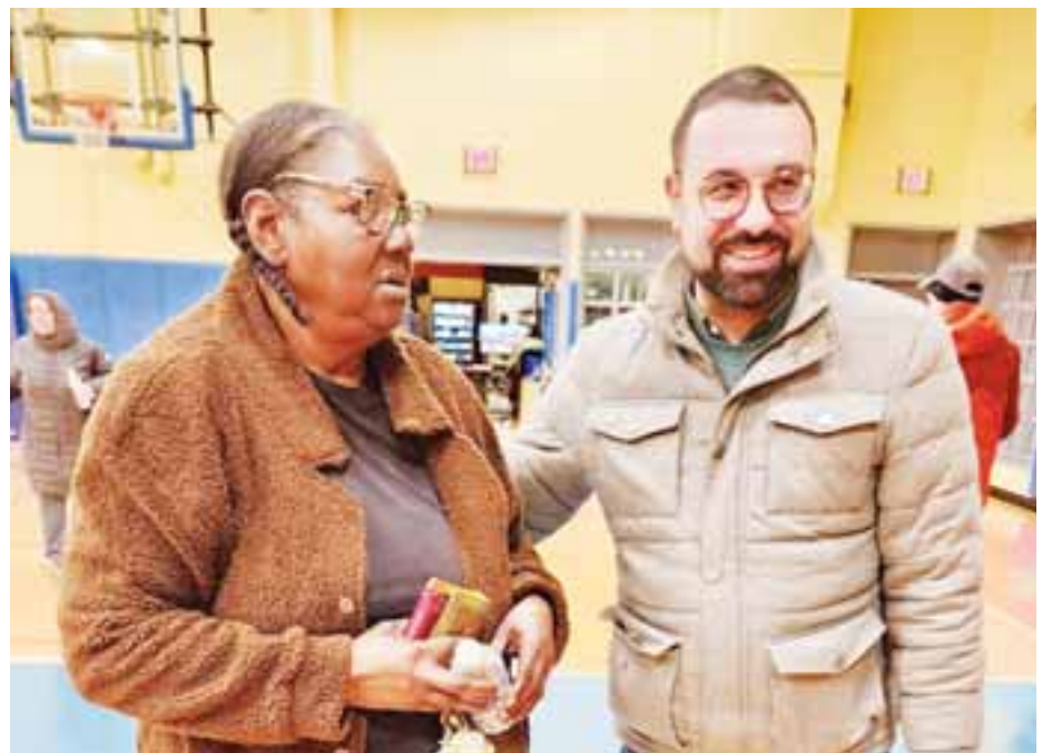
Residents recently met with District 5 City Councilor Ricardo Arroyo and other officials at the Archdale Community Center for a meeting regarding recent crime upticks in the area.