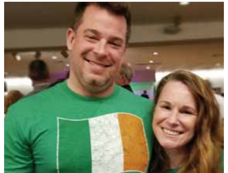
Residents wore green on their clothes and, presumably, in their bellies during the night.