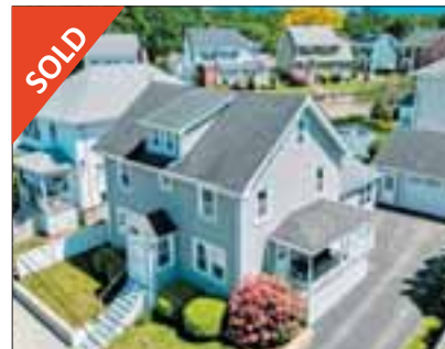
8 Alaric St, West Roxbury