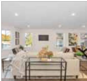
514 POPLAR STREET, U:1 ROSLINDALE CONDO / $749,000 3 beds; 2 full baths Listed by Steven Musto