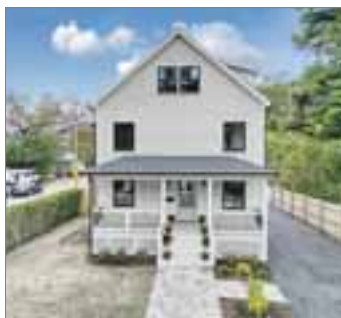
275 PARK STREET WEST ROXBURY SINGLE FAMILY / $1,529,000 5 beds; 3 full, 2 half baths Listed by Steven Musto