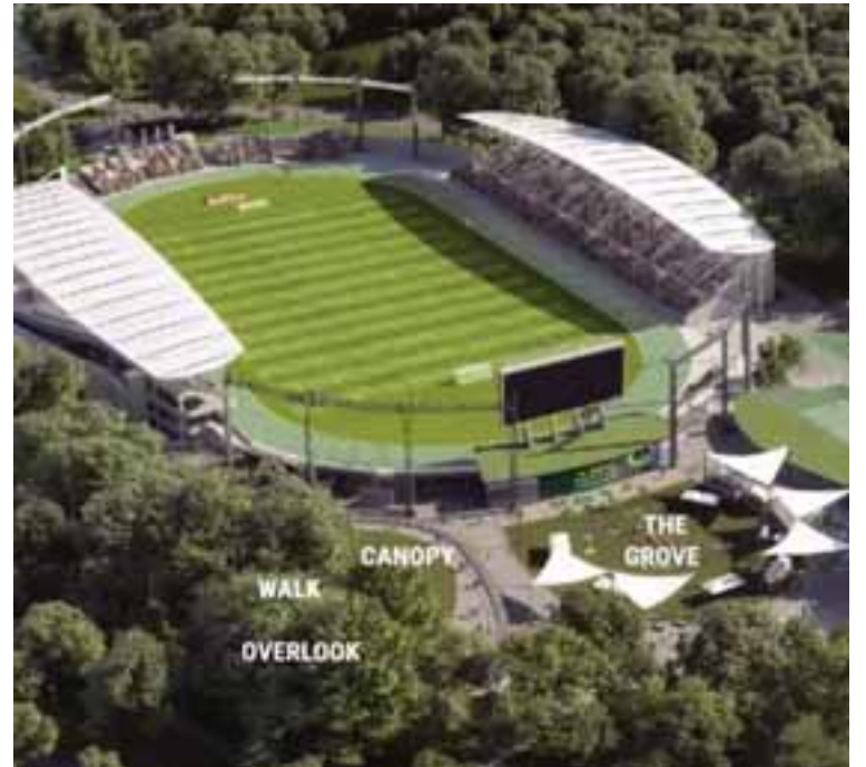
An aerial view of Stantec and Moody Architects’ schematic of the proposed new White Stadium.