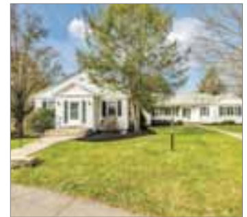
1025 HIGH STREET DEDHAM SINGLE FAMILY / $1,099,900 4 beds; 2 full, 1 half baths Listed by The Ultan & Caitlyn Team