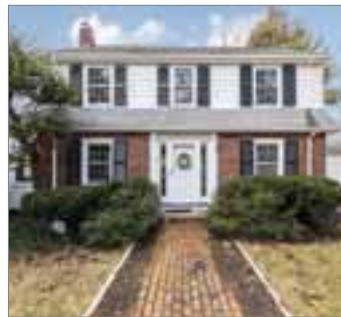
39 LINNET STREET WEST ROXBURY SINGLE FAMILY / $750,000 3 beds; 1 full, 1 half baths Listed by Mary Forde