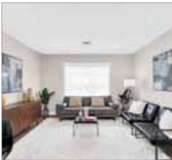
425 LAGRANGE ST., U:305 WEST ROXBURY CONDO / $695,000 2 beds; 2 full baths Listed by Kris & Mike

YOUR EXPERT REAL ESTATE TEAM FOR BUYING OR SELLING IN AND AROUND THE BOSTON AREA!