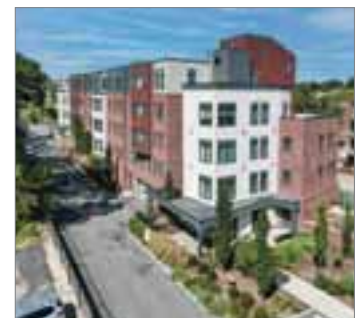
4945 WASHINGTON ST. WEST ROXBURY MULTI FAMILY $22,000,000 Listed by Steven Musto