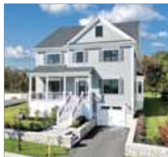
7 STARLING STREET WEST ROXBURY SINGLE FAMILY / $1,650,000 4 beds; 2 full, 1 half baths Listed by Rosemar Realty Group