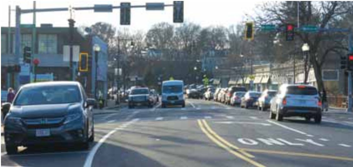
The work on Centre Street is nearing completion and residents have a lot to say about it.