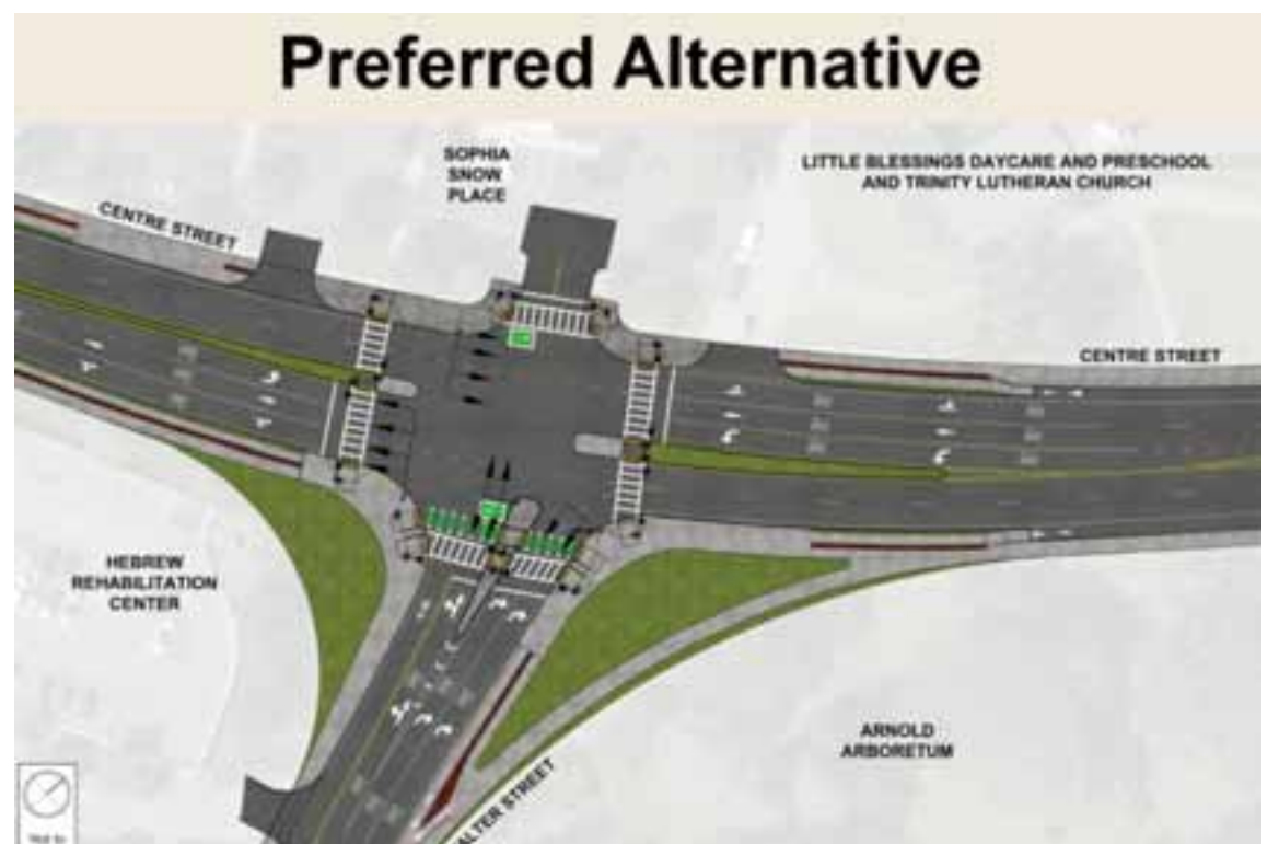
The proposed preferred design, which has been relatively unchanged since 2020, presents some issues for those who use the Trinity Lutheran Church in the right-hand corner.