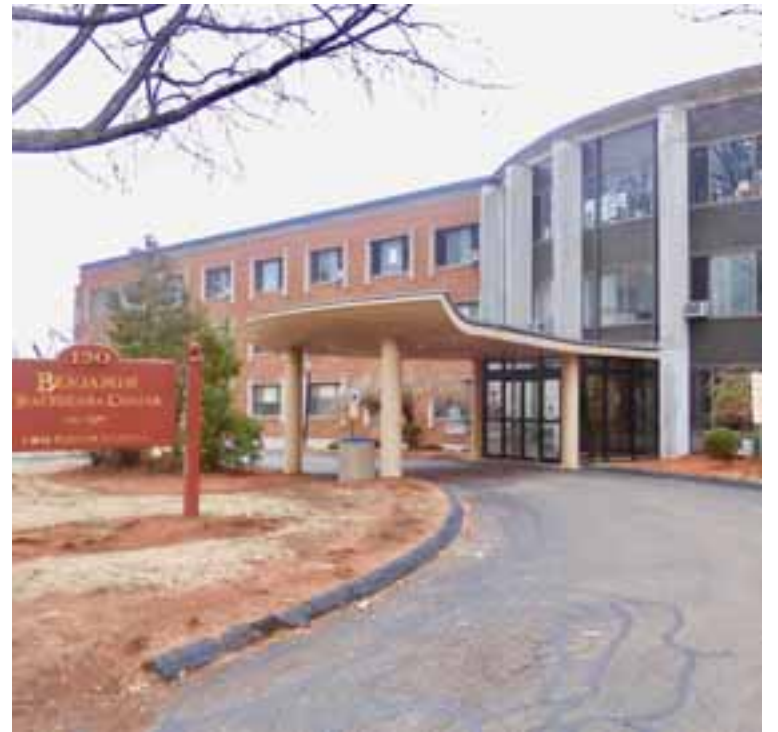
The Benjamin Healthcare Center on Fisher Hill Avenue is slated to close this summer.