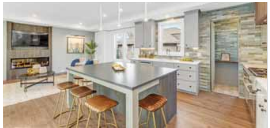
51 ROSEWAY STREET, JAMAICA PLAIN — SINGLE FAMILY 4 beds; 3 full, 1 half baths / $1,795,000 / Listed by Steven Musto