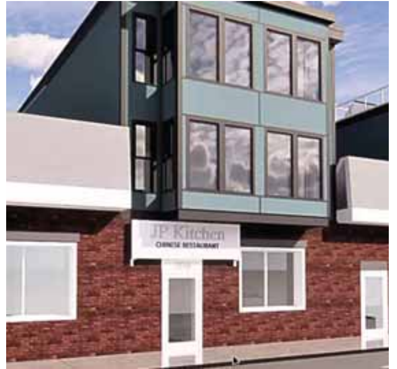
A rendering of the proposal for housing-over-restaurant at 3510 Washington St. in Jamaica Plain.