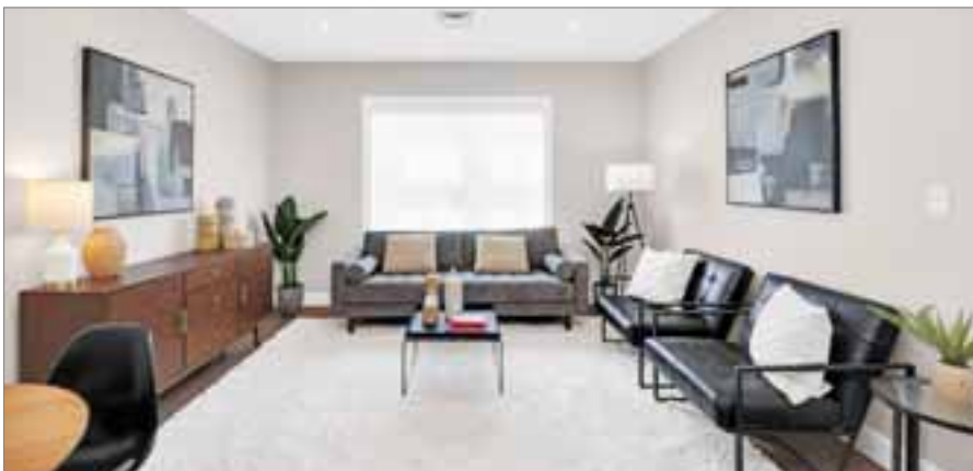
425 LAGRANGE STREET U:307, WEST ROXBURY — CONDO 2 beds; 2 full baths / $729,000 / Listed by Mike & Kris