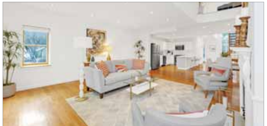
60 BURROUGHS STREET U:34, JAMAICA PLAIN — CONDO 2 beds; 2 full, 1 half baths / $1,299,000 / Listed by Mary Forde