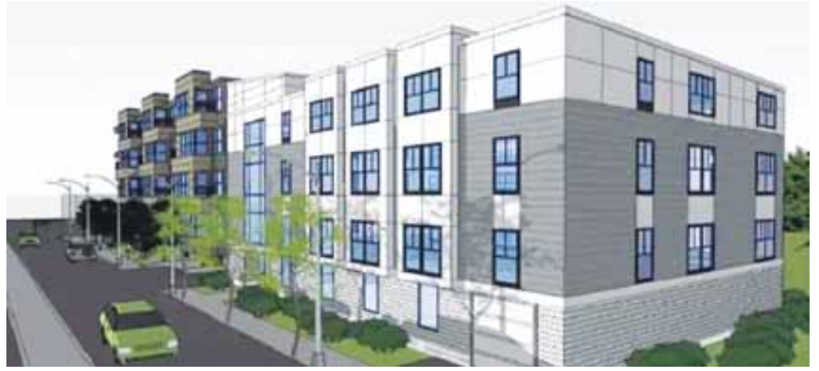
A rendering of the revised plans for 84 Stonley Rd.

What followed was less about the building and more