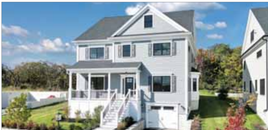
7 STARLING STREET, WEST ROXBURY — SINGLE FAMILY 4 beds; 2 full, 1 half baths / $1,650,000 / Listed by Rosemar Realty Group

YOUR EXPERT REAL ESTATE TEAM FOR BUYING OR SELLING IN AND AROUND THE BOSTON AREA!